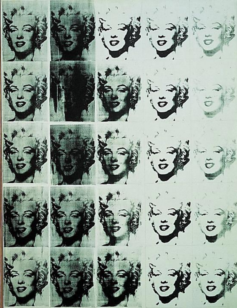
Andy Warhol, "Marilyn Diptych" (1962)