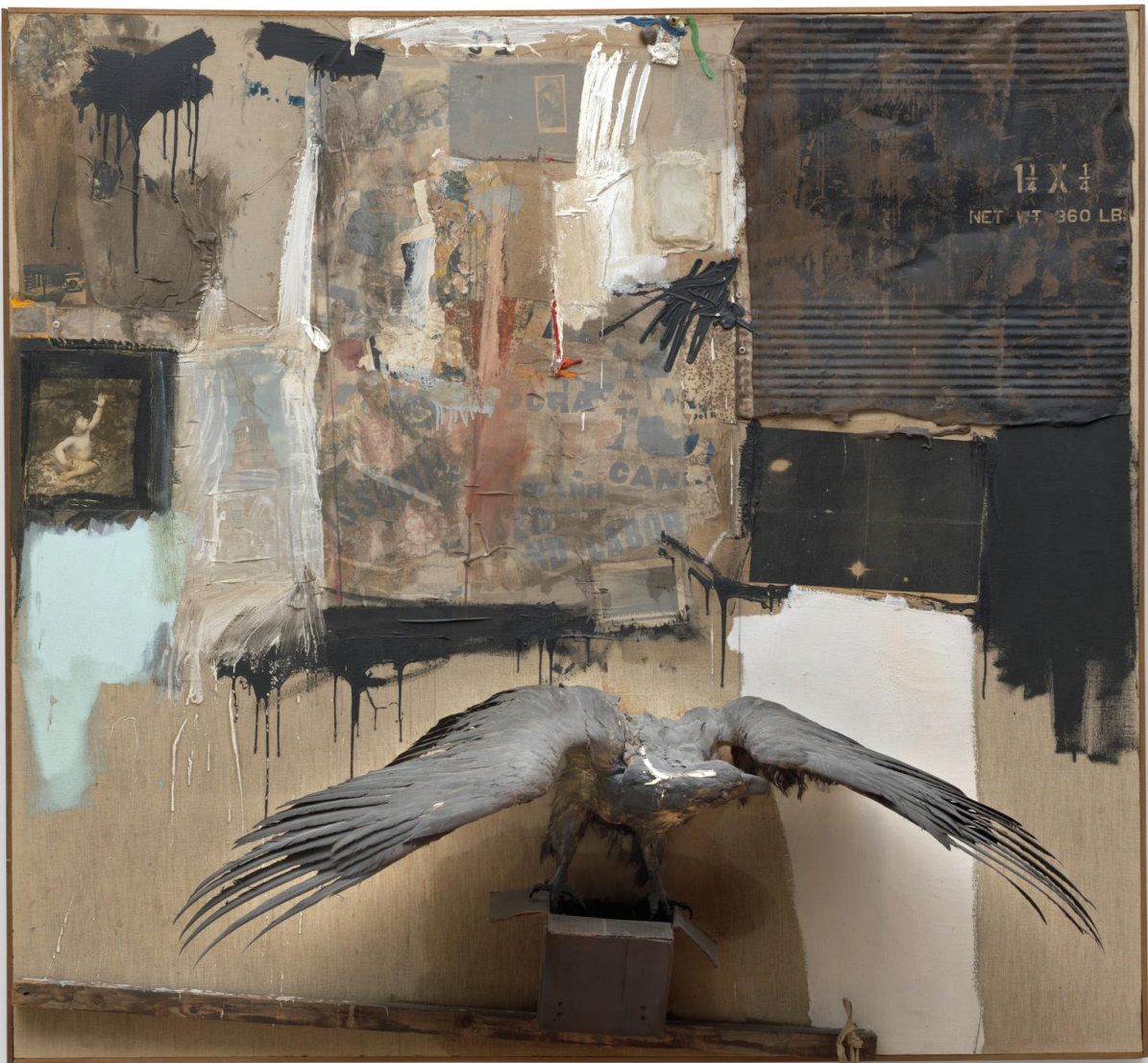
Robert Rauschenberg, "Canyon" (1959); Willem de Kooning, "Untitled" (c.1949)