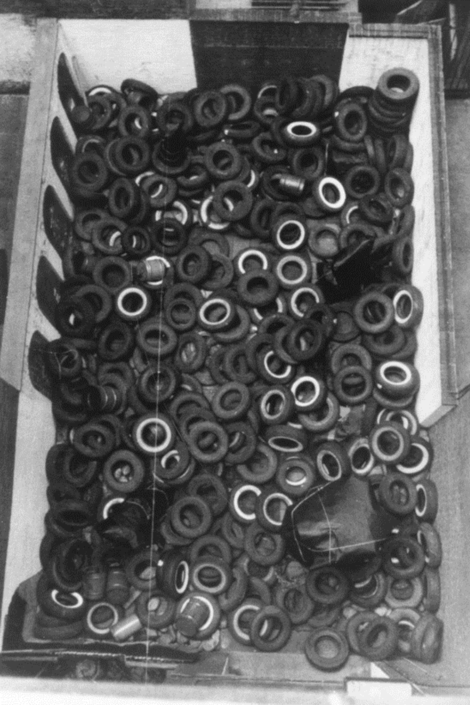
“Happening” entitled “Yard” by Alan Kaprow (New York, 1961)