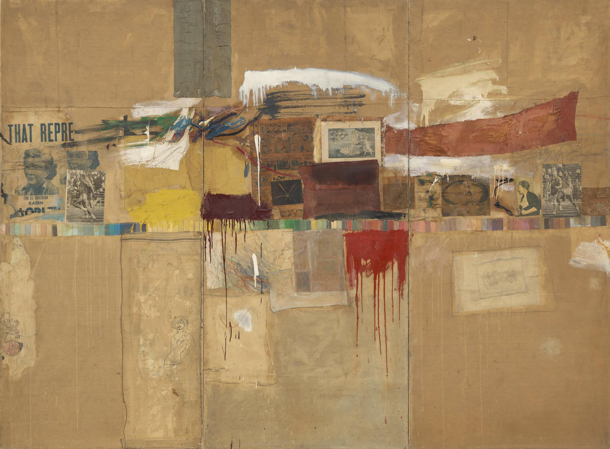
Robert Rauschenberg, "Rebus" (1955)