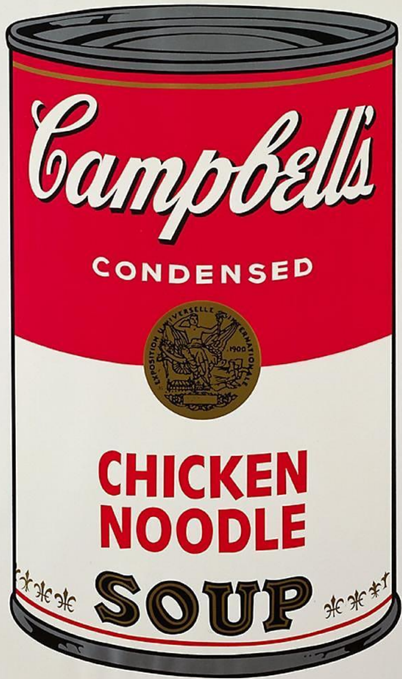
Andy Warhol, "Chicken Noodle" (1968); Advertisement for Campbell's Soup (c.1960)