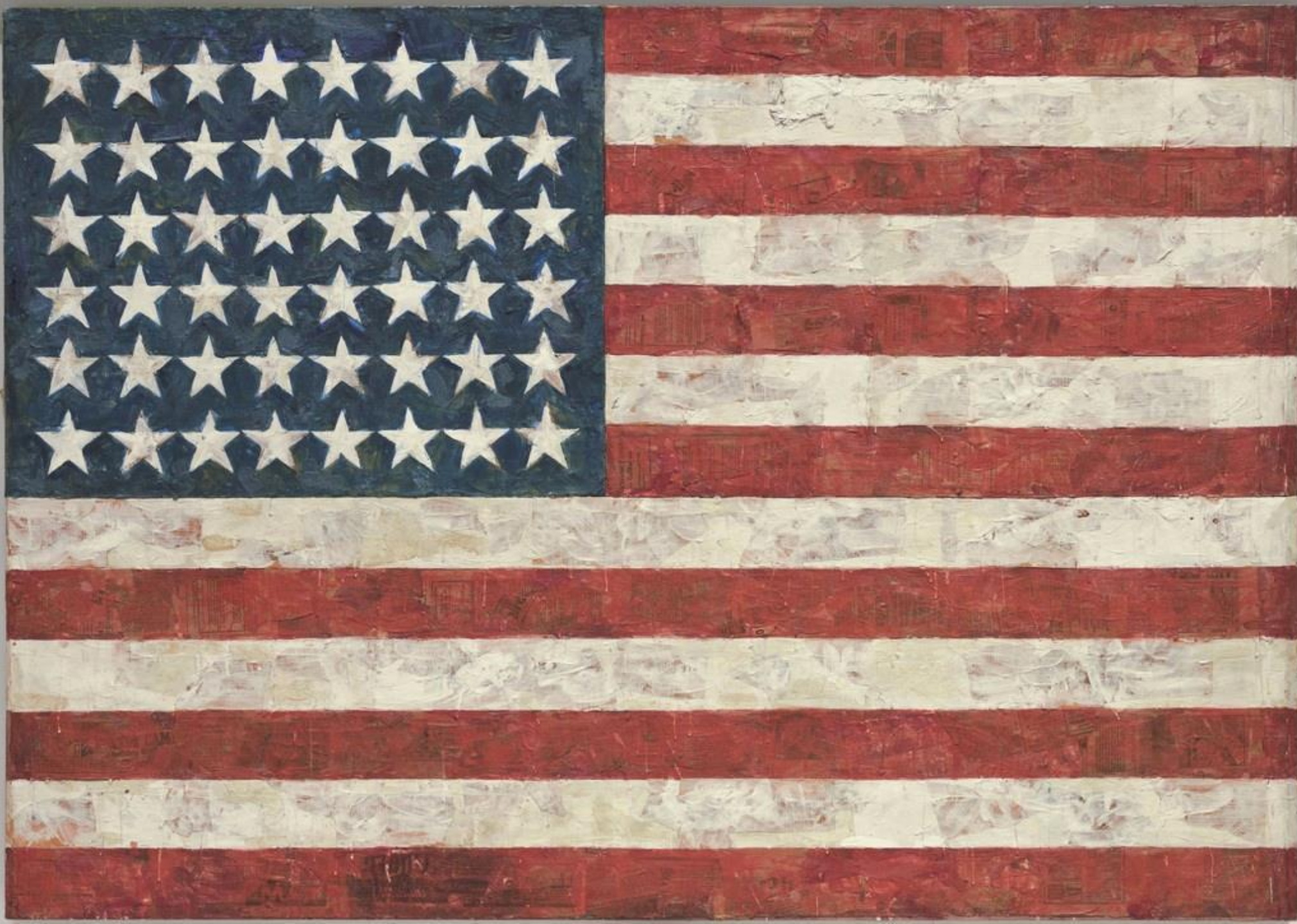
Jasper Johns, "Flag" (1955)