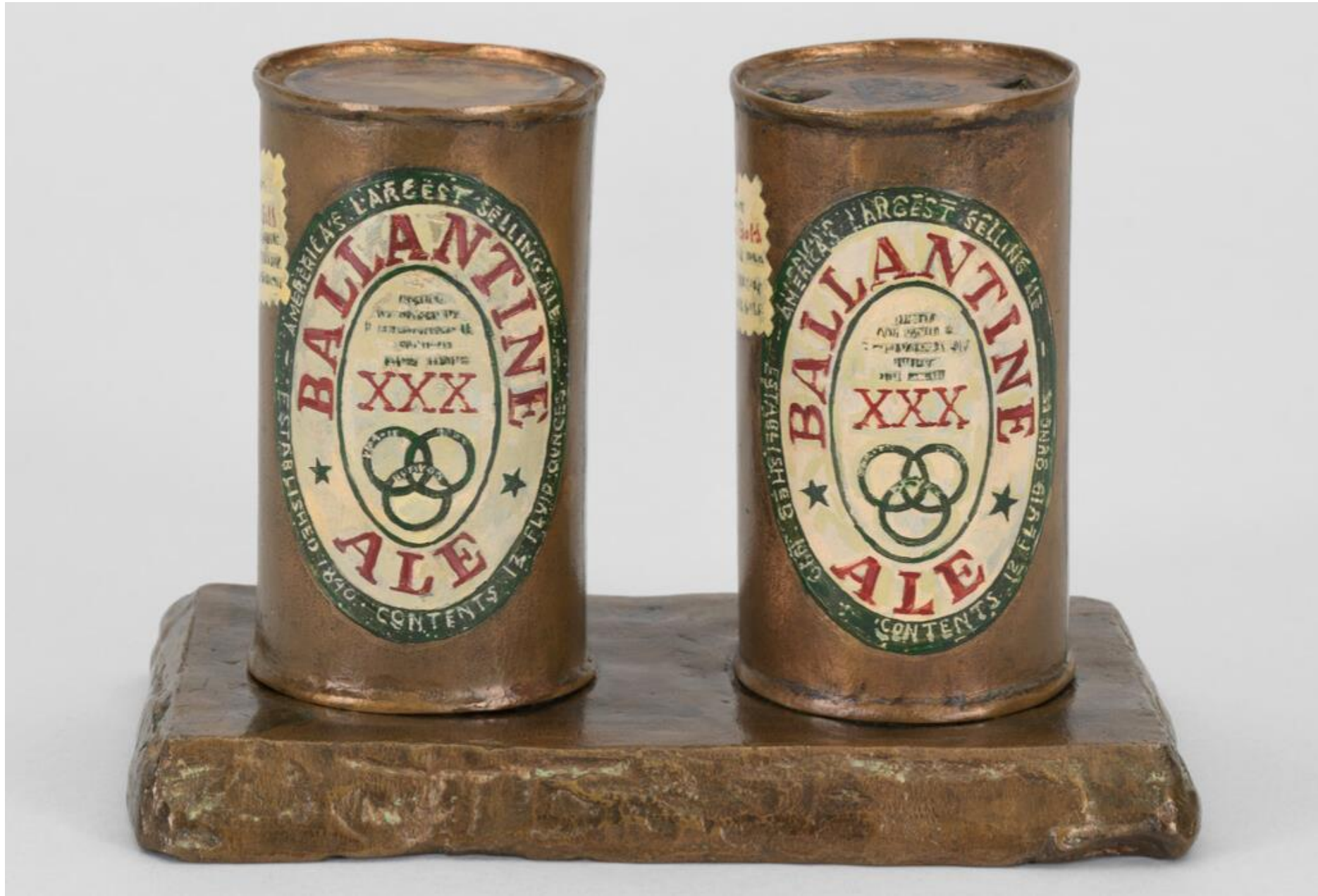
Jasper Johns, "Painted Bronze" (1960)