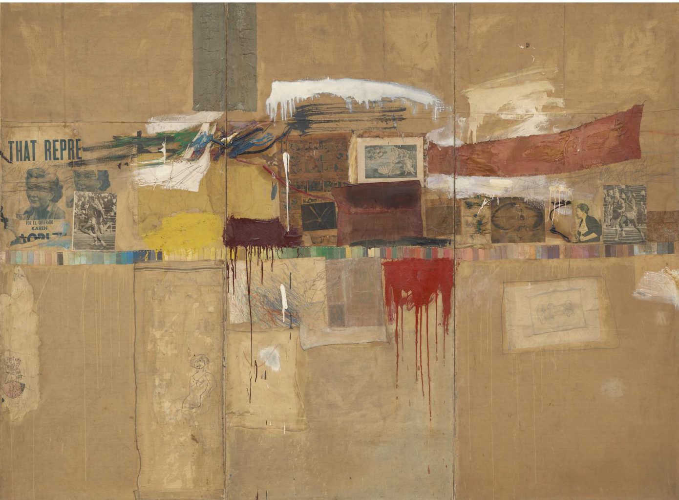
Robert Rauschenberg, "Rebus" (1955); Times Square in the 1950s