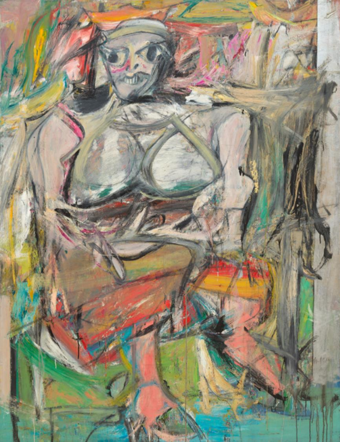
Willem de Kooning, "Woman I" (New York, 1950-1952); Promotional photograph of Marilyn Monroe from the movie "How to Marry a Millionaire" (set in New York, 1953)