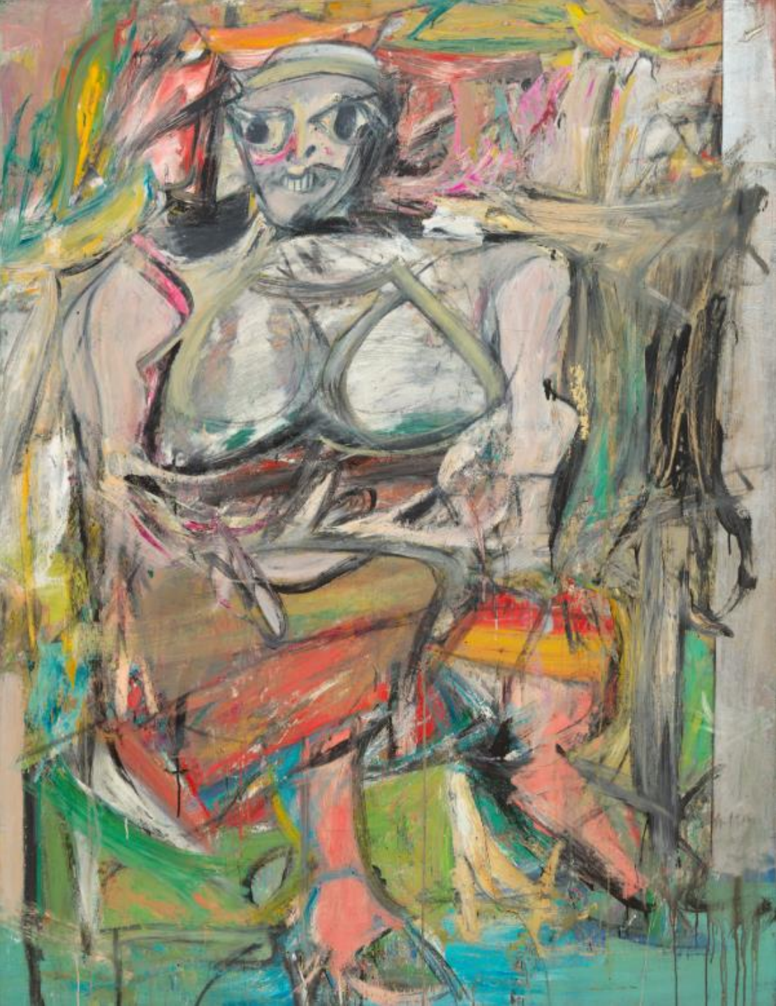
Willem de Kooning, "Woman I" (New York, 1950-1952)