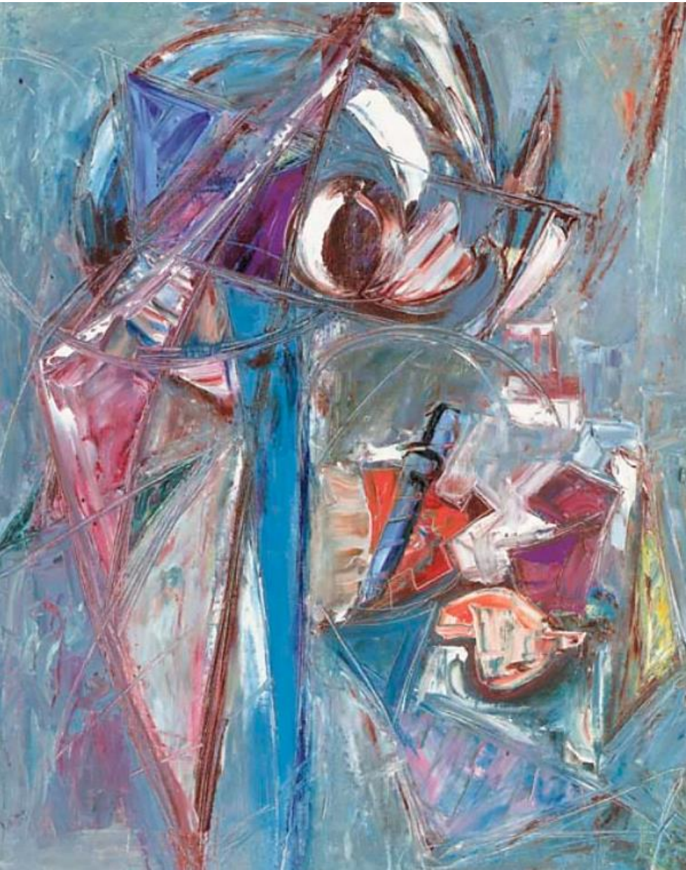
Lee Krasner, "Image Surfacing" (New York, 1945); Jackson Pollock, "The Key" (New York, 1946)