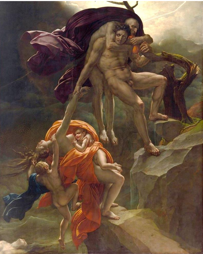
Anne-Louis Girodet de Roussy-Trioson, 'Scene from the Deluge' (France, 1806); Jacques-Louis David, 'The Intervention of the Sabine Women' (France, 1799)