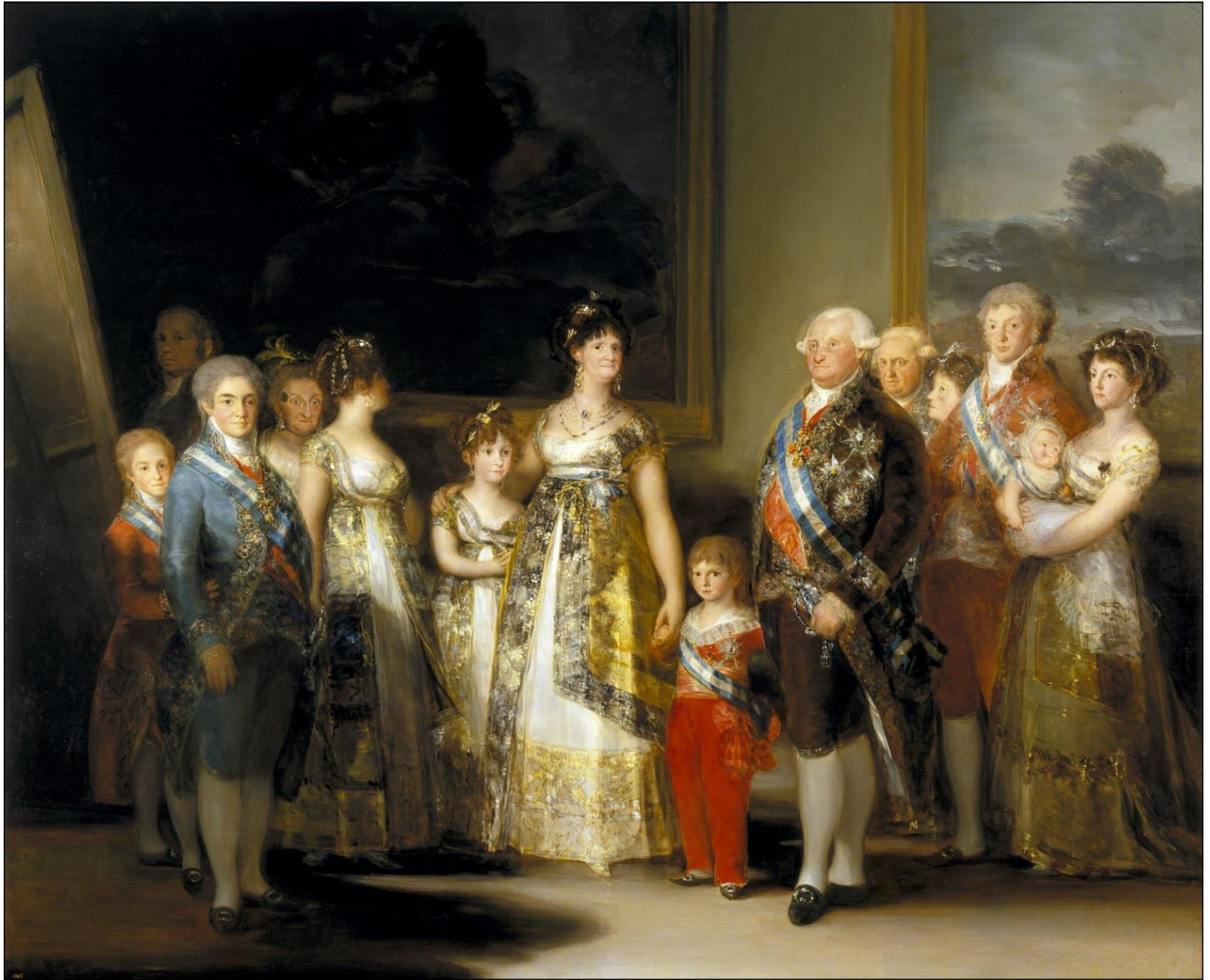
Goya, Portrait of the family of Charles IV (Spain, 1800)