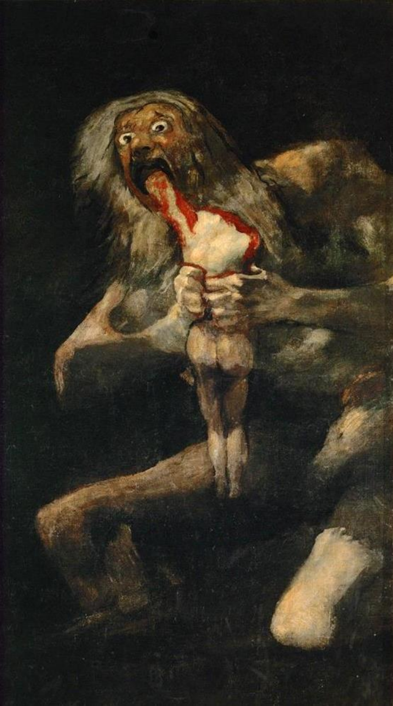
Goya, 'Saturn Devouring One of His Children' (Spain, c.1820)