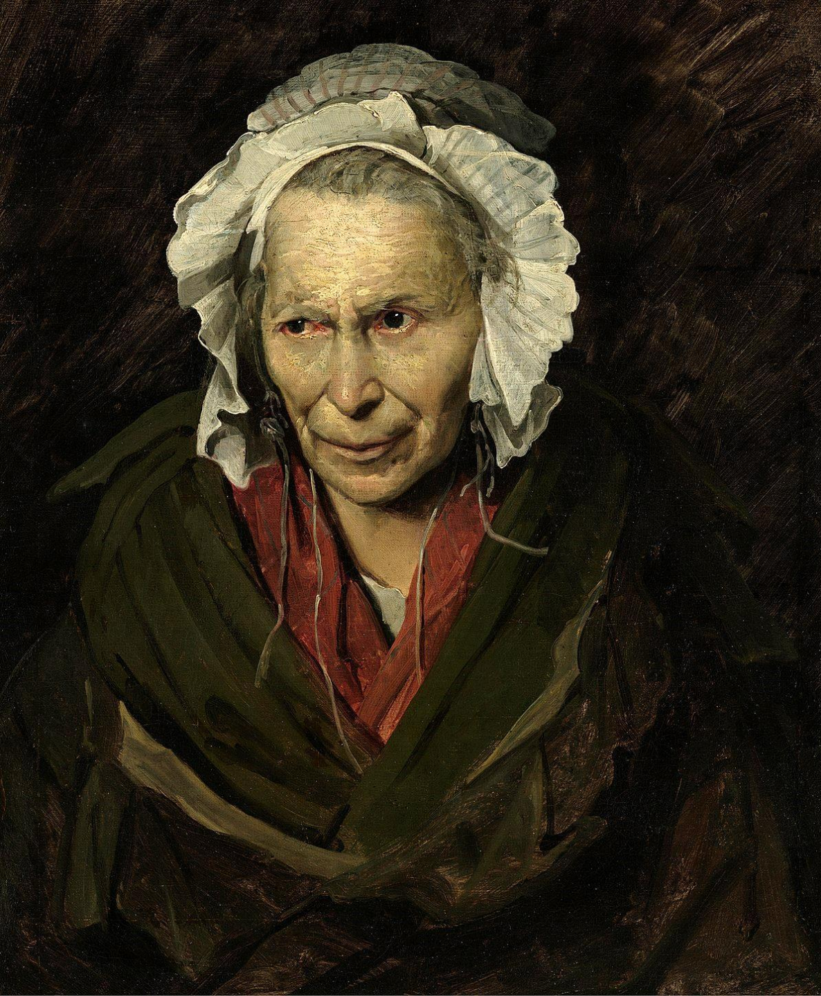
Portrait by Théodore Géricault (France, c.1820)