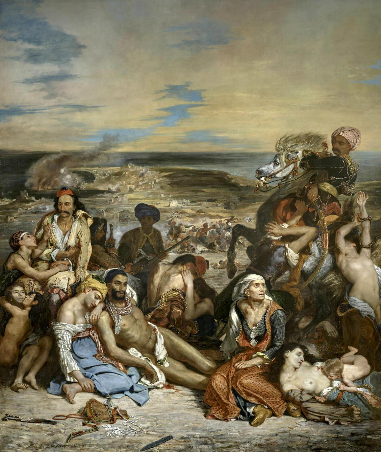
Eugène Delacroix, 'Scenes from the Massacre at Chios' (1824)