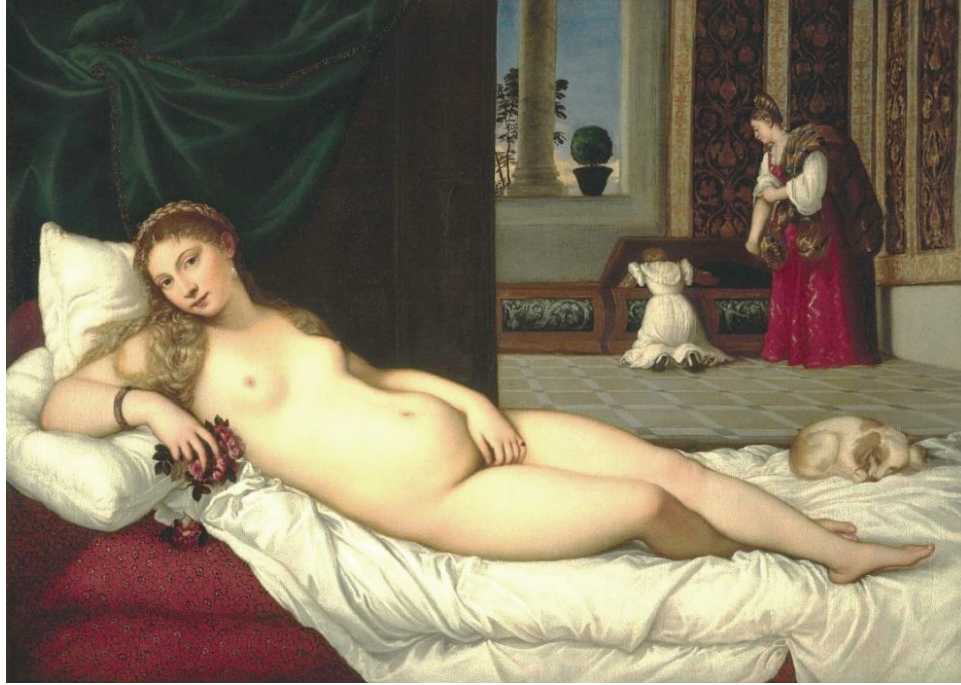
Titian, 'Venus of Urbino' (Italy, c.1538); Ingres, 'La Grande Odalisque' (1814)