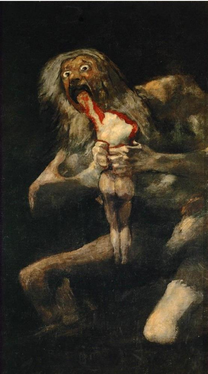
Goya, 'Saturn Devouring One of His Children' (c.1820); Ingres, 'Jupiter and Thetis' (France, 1811)