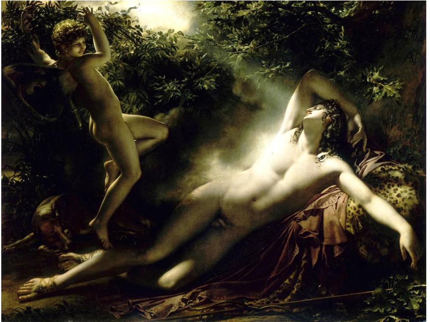
Anne-Louis Girodet de Roussy-Trioson, 'Endymion' (France, 1791)