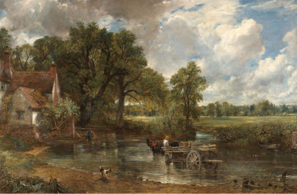
John Constable, 'Haywain' (England, 1821); Detail from Delacroix, 'Massacre at Chios' (France, 1824)