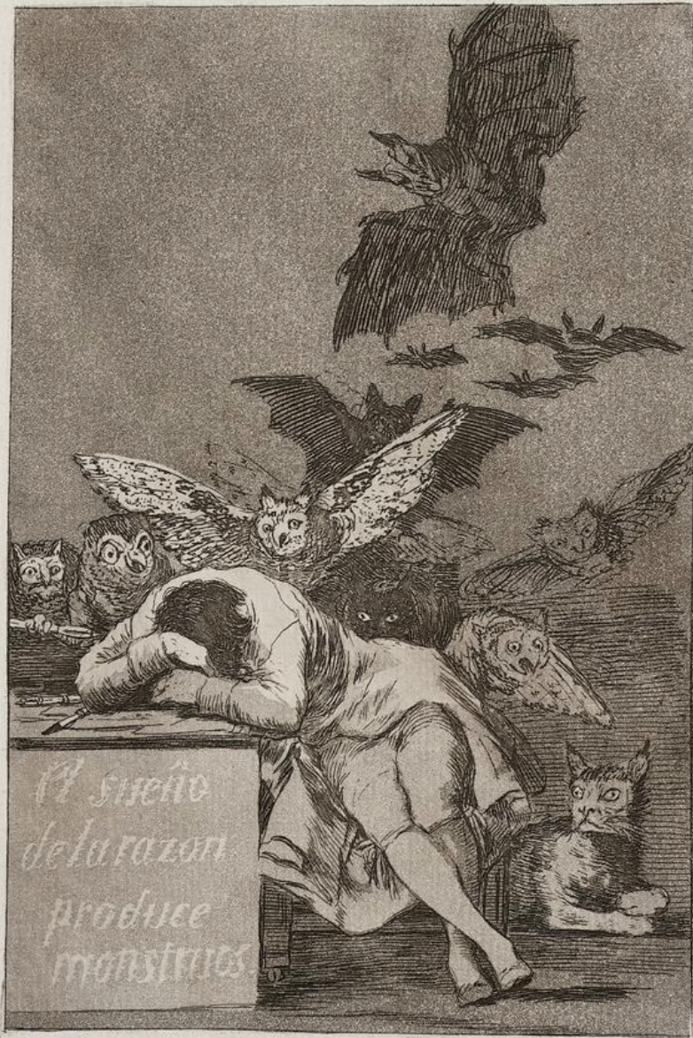
Francisco de Goya y Lucientes, 'The Sleep of Reason Produces Monsters' (Spain, 1799)