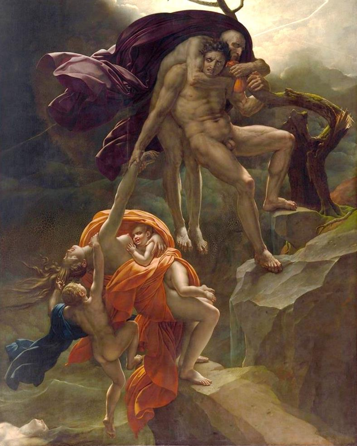
Anne-Louis Girodet de Roussy-Trioson, 'Scene from the Deluge' (France, 1806)