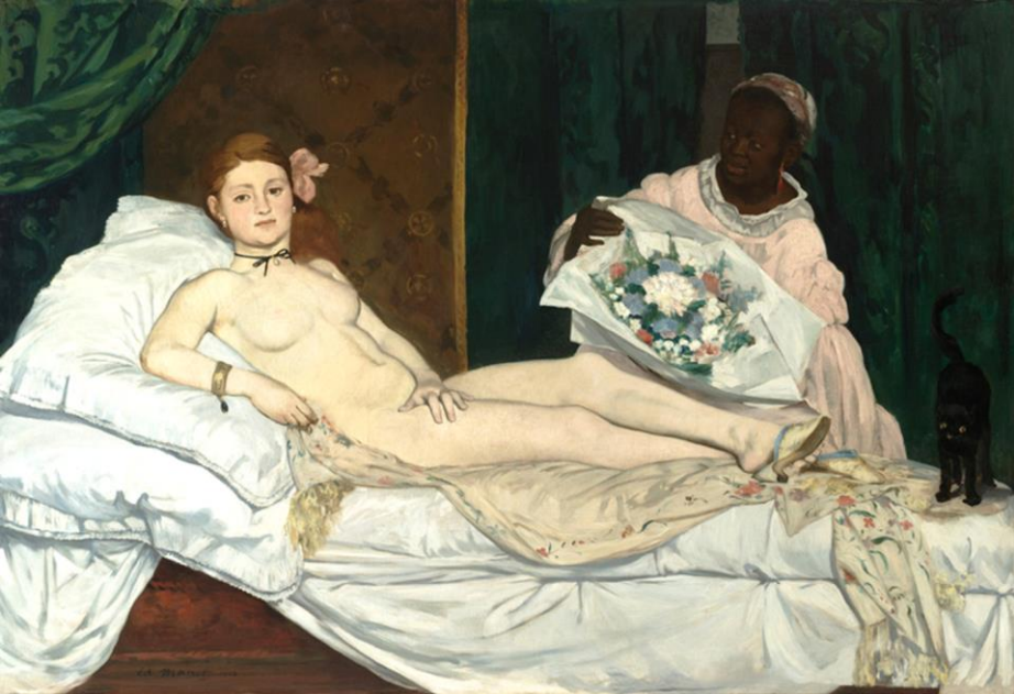
Édouard Manet, 'Olympia' (1863); Ingres, 'La Grande Odalisque' (1814); Titian, 'Venus of Urbino' (c.1538)