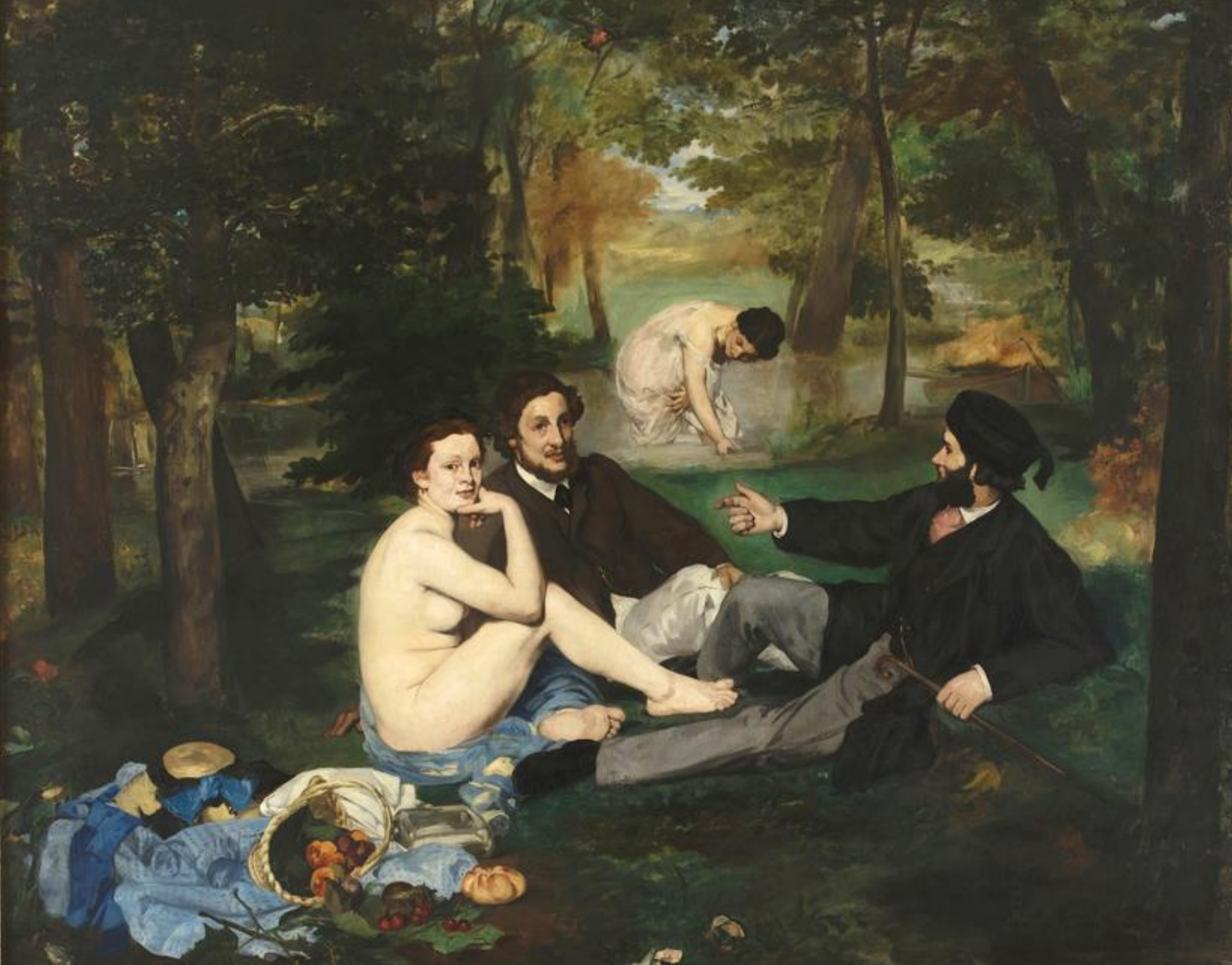
Édouard Manet, 'Luncheon on the Grass' (1863)