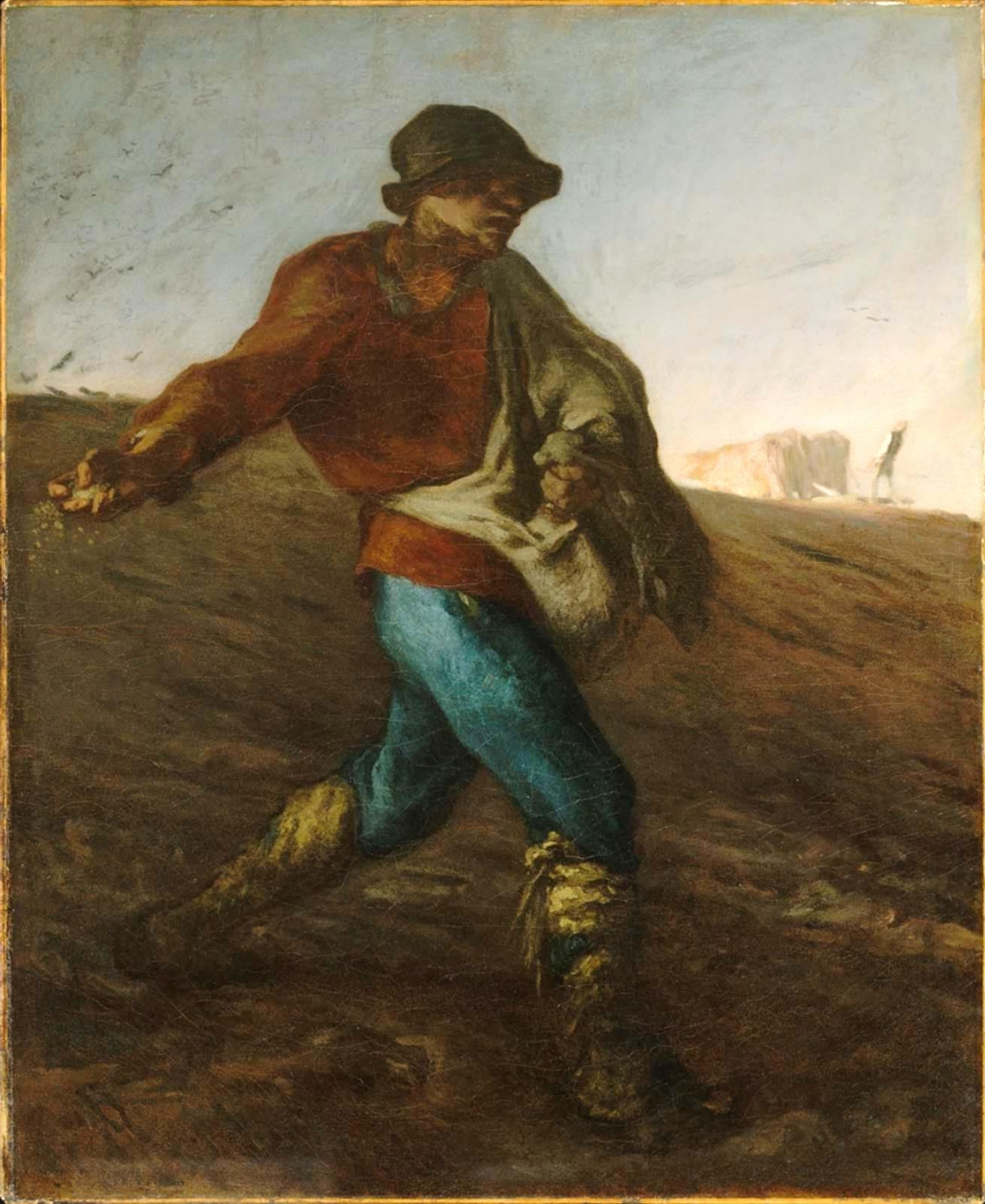
Jean-Francois Millet, 'The Sower' (c.1850)