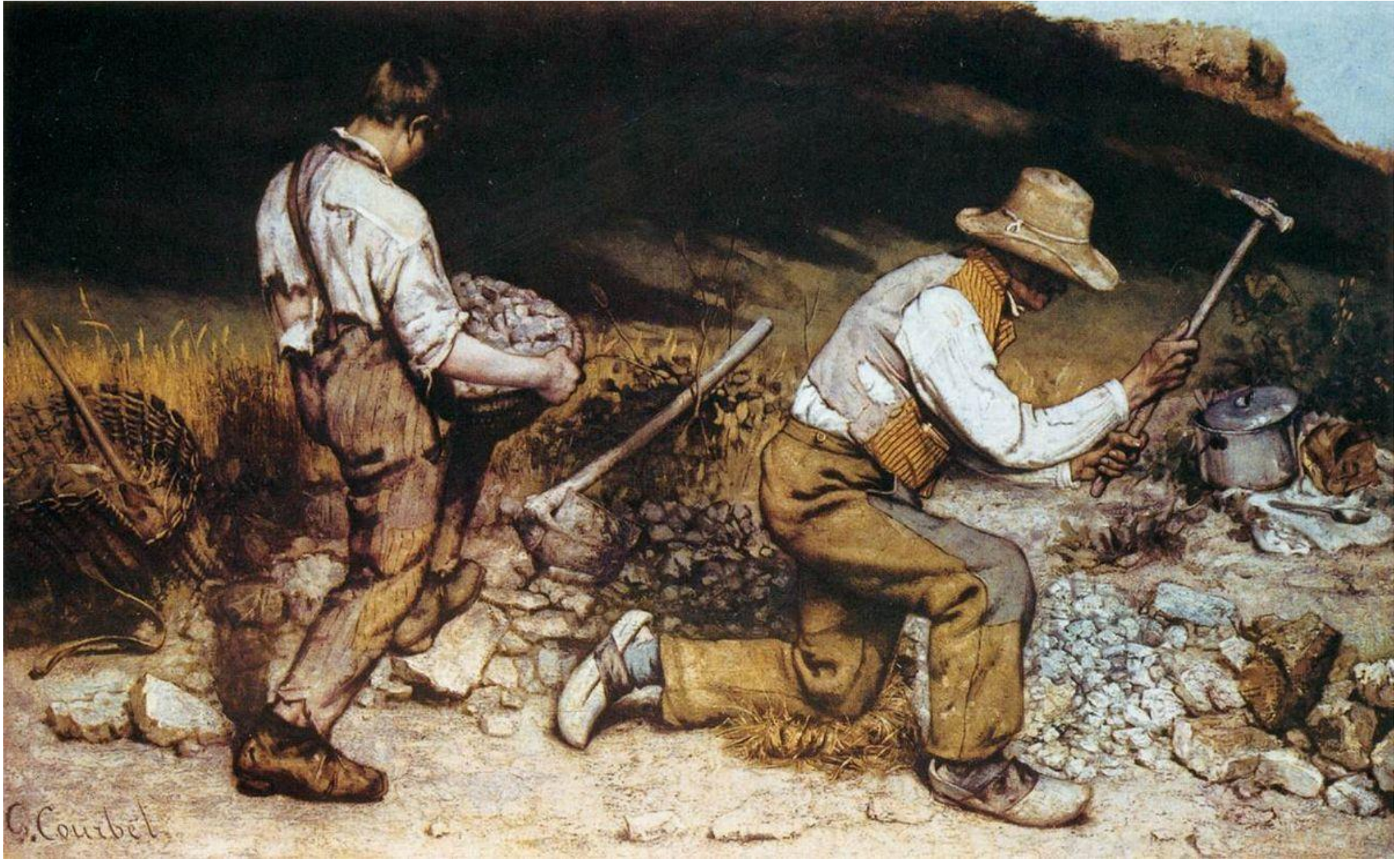
Gustave Courbet, 'The Stone Breakers' (1849)