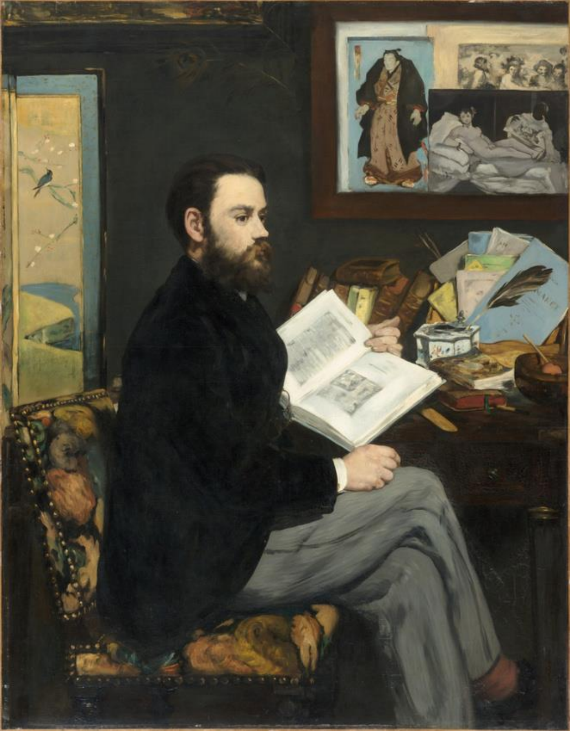
Édouard Manet, portrait of Emile Zola (1868)