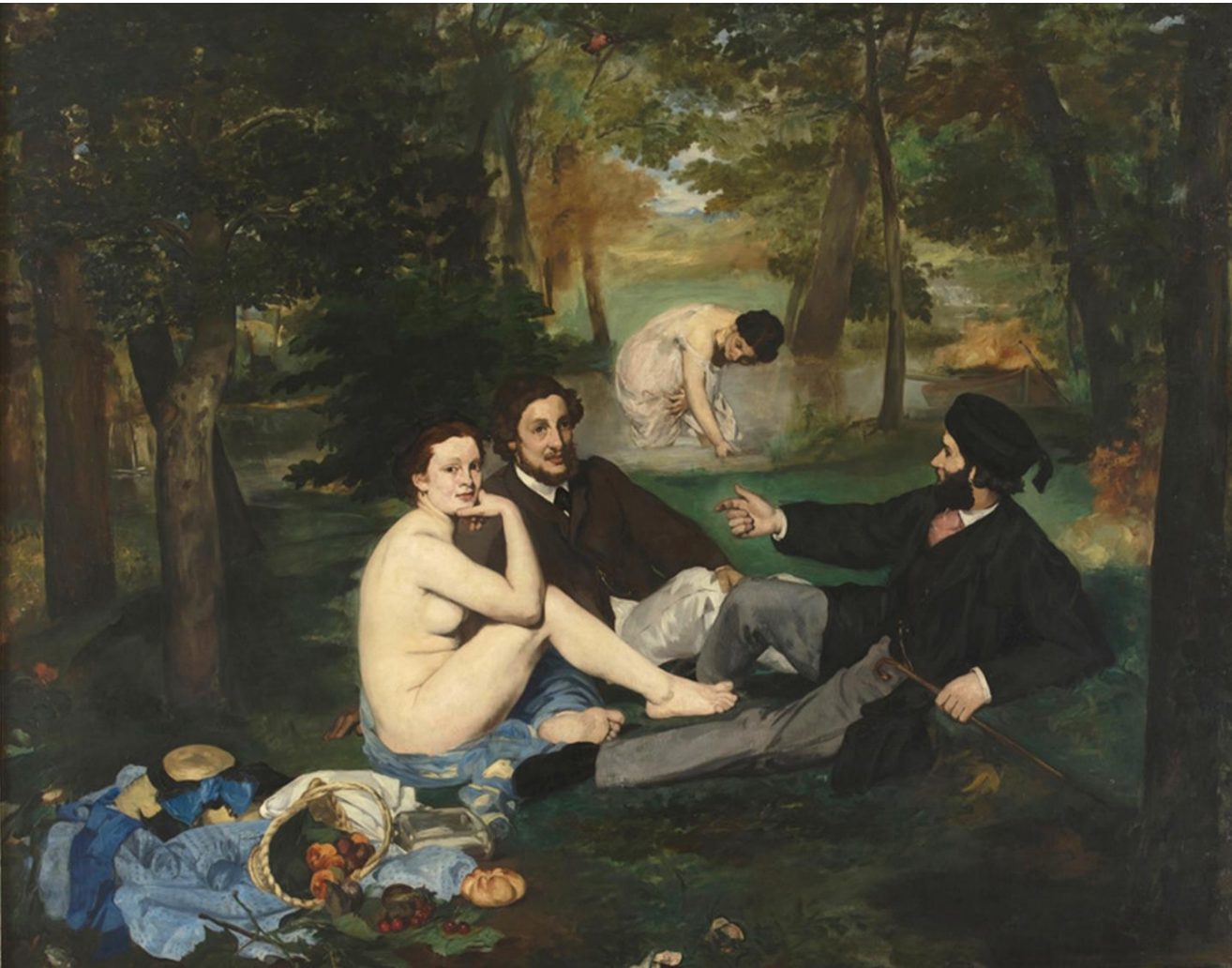
Édouard Manet, 'Luncheon on the Grass' (1863); Titian, 'Pastoral Concert' (c.1510)