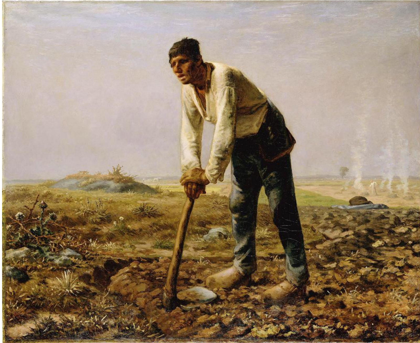
Jean-Francois Millet, 'Man with a Hoe' (c.1860)