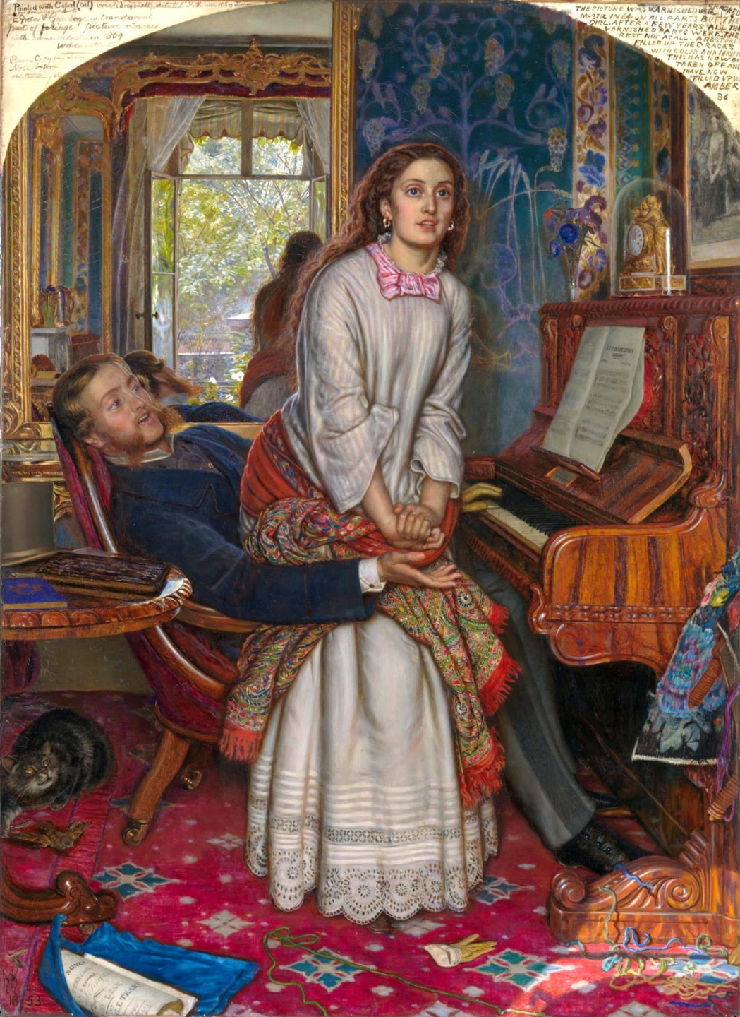
William Holman Hunt, “The Awakening Conscience” (1853)