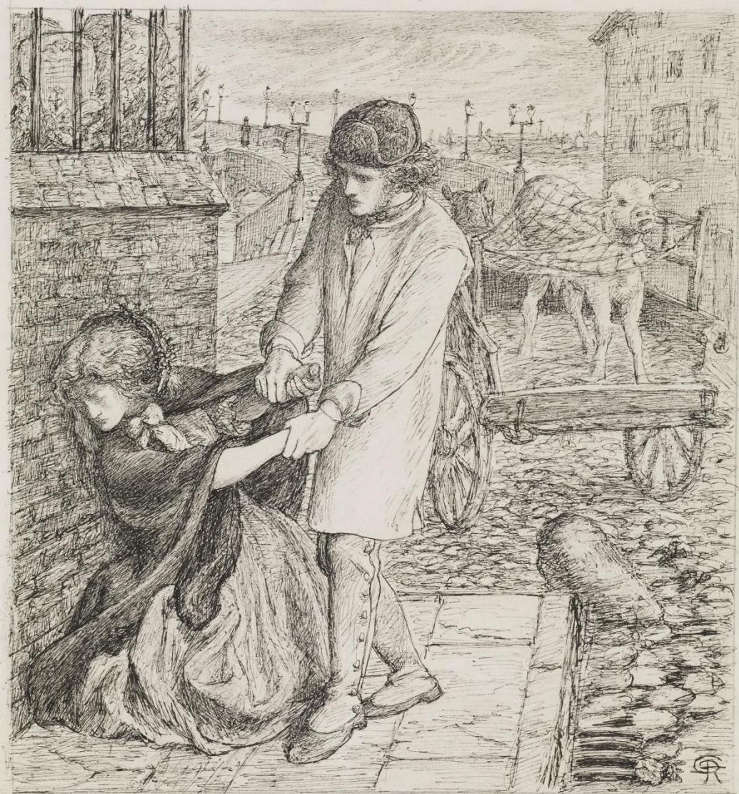
Dante Gabriel Rossetti, preparatory sketch for "Found" (1853)

"I remember thee; the kindness of thy youth, the love of thy betrothal." Jerem. II. 2.