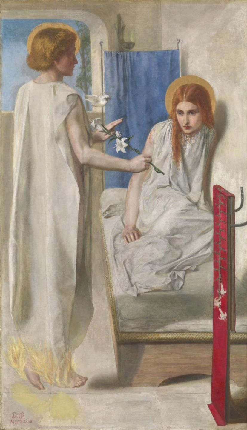
Dante Gabriel Rossetti, "Ecce Ancilla Domini" (c.1850); Fra Angelico, "Annunciation" (c.1440)