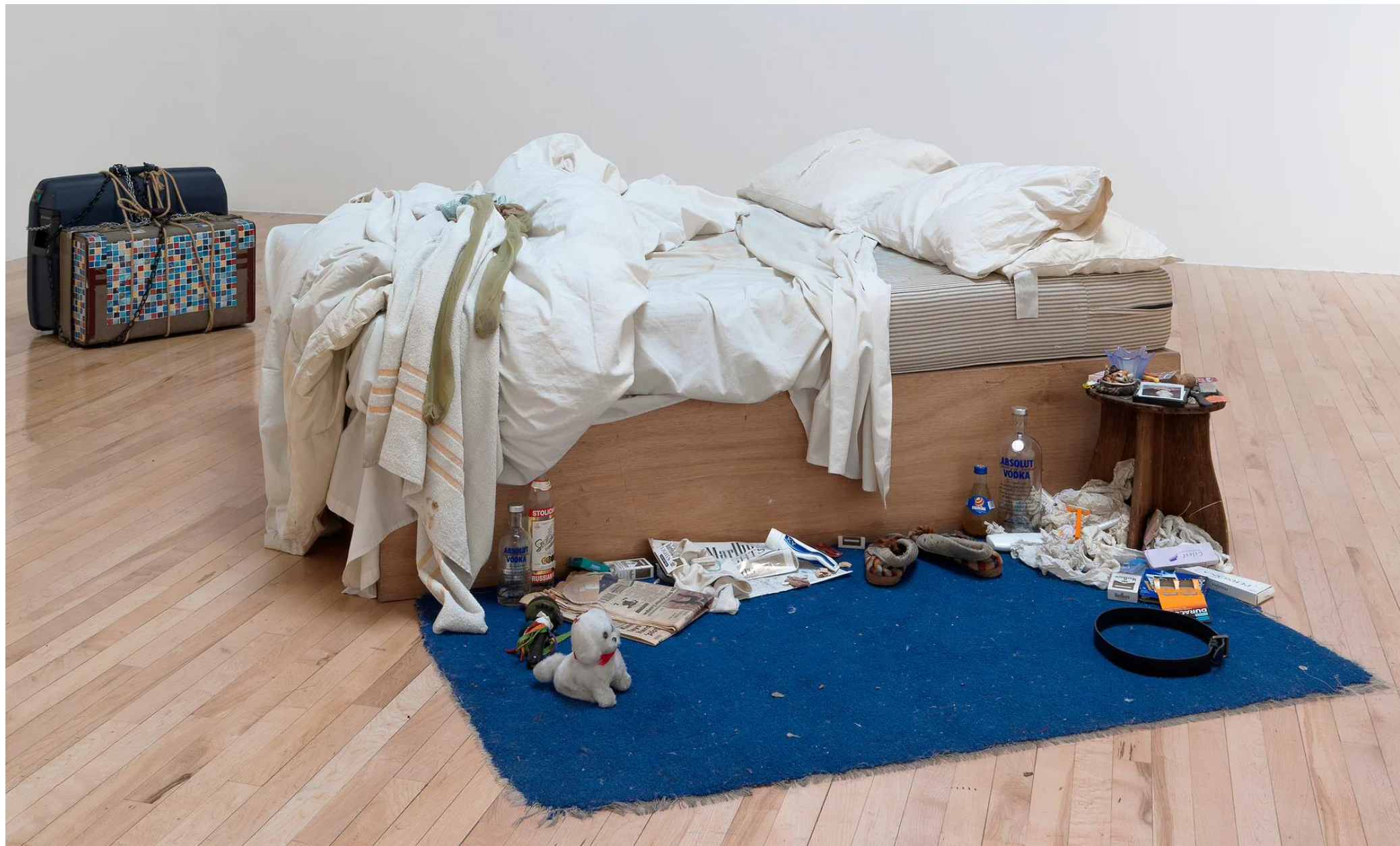
Tracey Emin, 'My Bed' (1998)