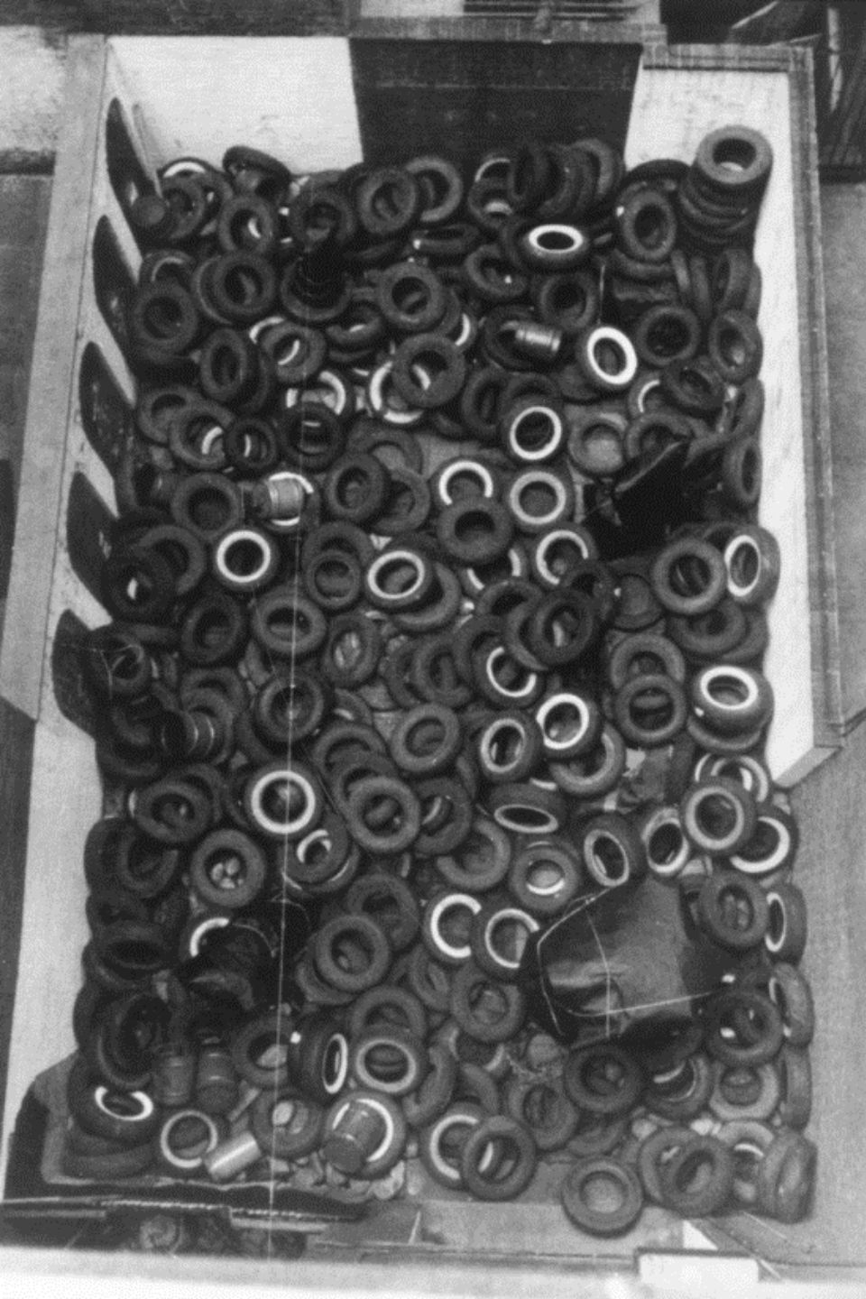
Still photographs from the 'Happening' entitled 'Yard' by Alan Kaprow (New York, 1961)