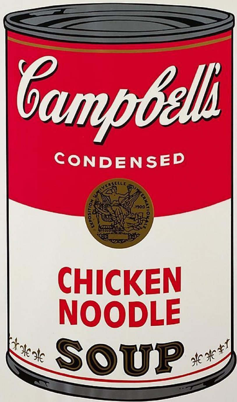
Andy Warhol, 'Chicken Noodle' (from 'Campbell's Soup I,' 1968); Advertisement for Campbell's Soup (c.1960)