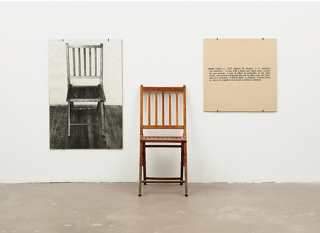
Joseph Kosuth, 'One and Three Chairs' (1965); Detail from Raphael's 'School of Athens' (Italy, c.1510)