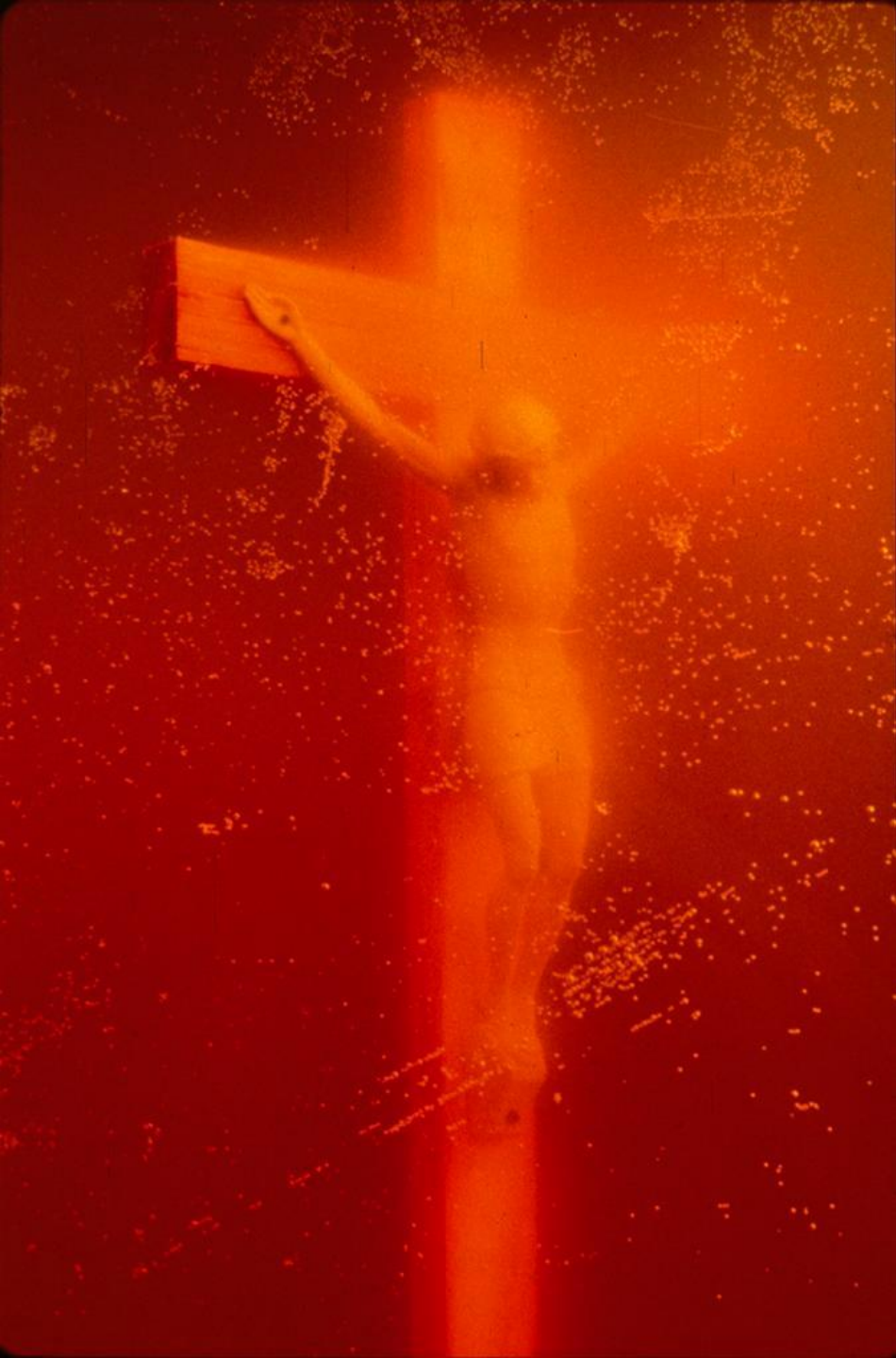
Andres Serrano, 'Immersion/Piss Christ' (1987)