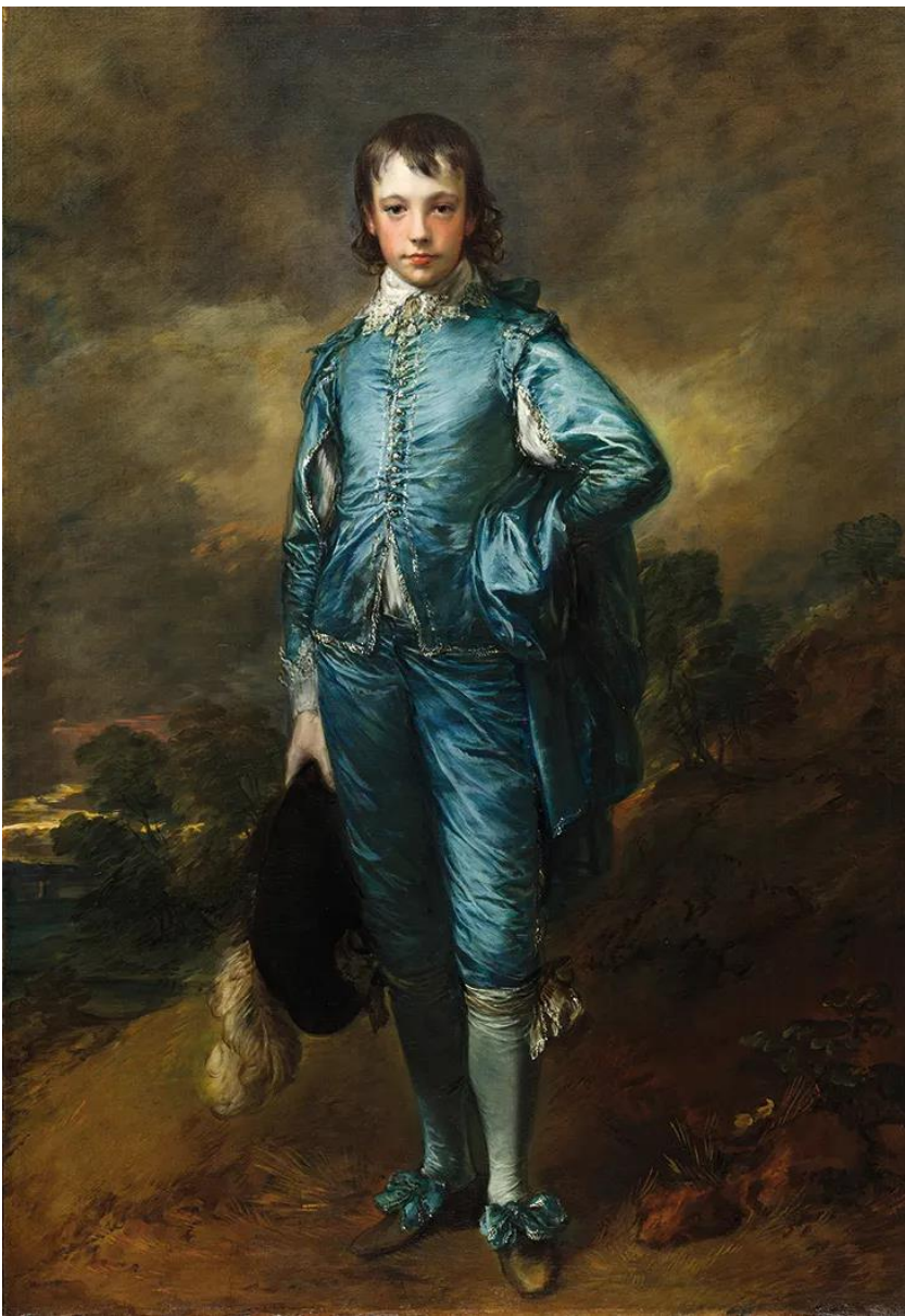
Thomas Gainsborough, 'Portrait of a Young Gentleman' (1770); Kehinde Wiley, 'Portrait of a Young Gentleman' (2021)