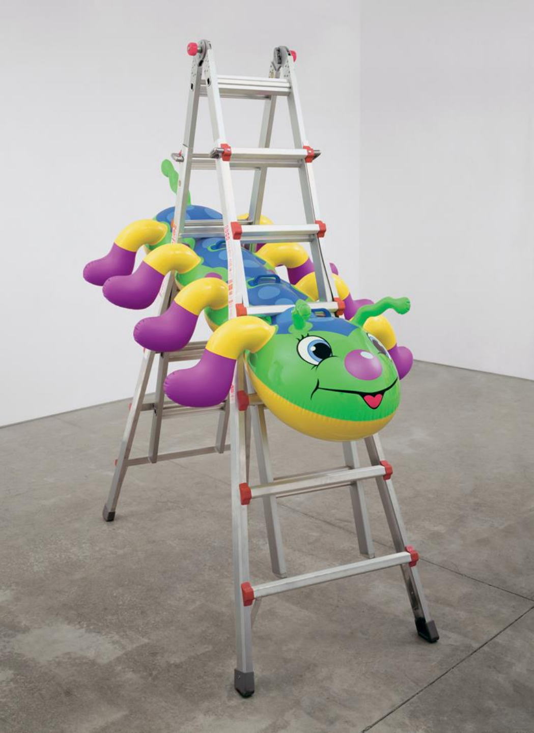
Jeff Koons, 'Caterpillar Ladder' (2003)