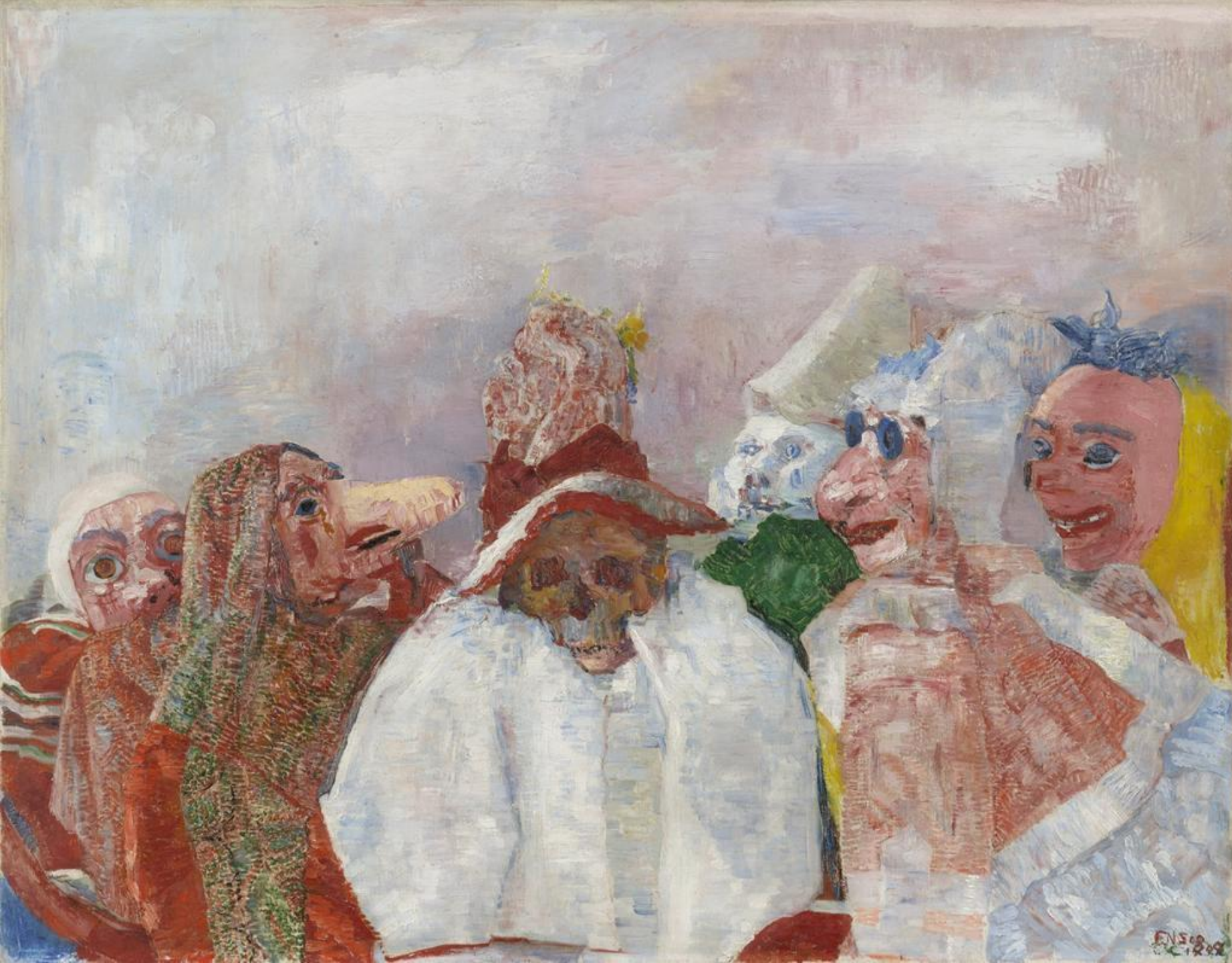
James Ensor, 'Masks Confronting Death' (1888)