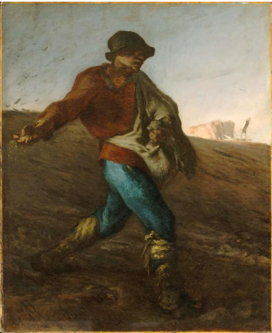
Jean-François Millet, 'The Sower' (1850); Vincent van Gogh, 'The Sower' (1888)