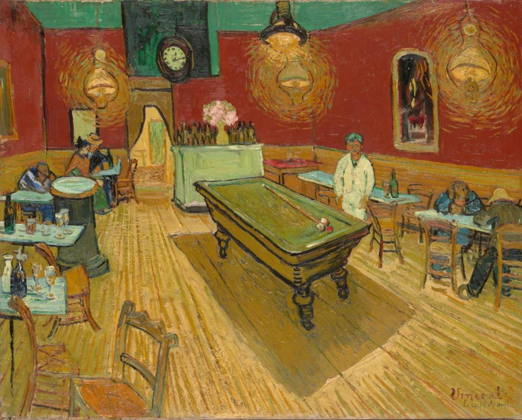
Vincent van Gogh, 'The Night Café' (1888)