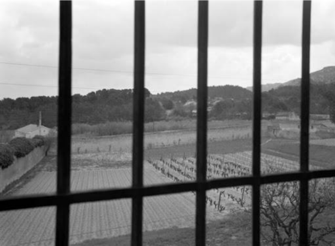
View from van Gogh's room at the Asylum of Saint Paul de Mausole in Saint Remy de Provence; 'Starry Night' (1889)