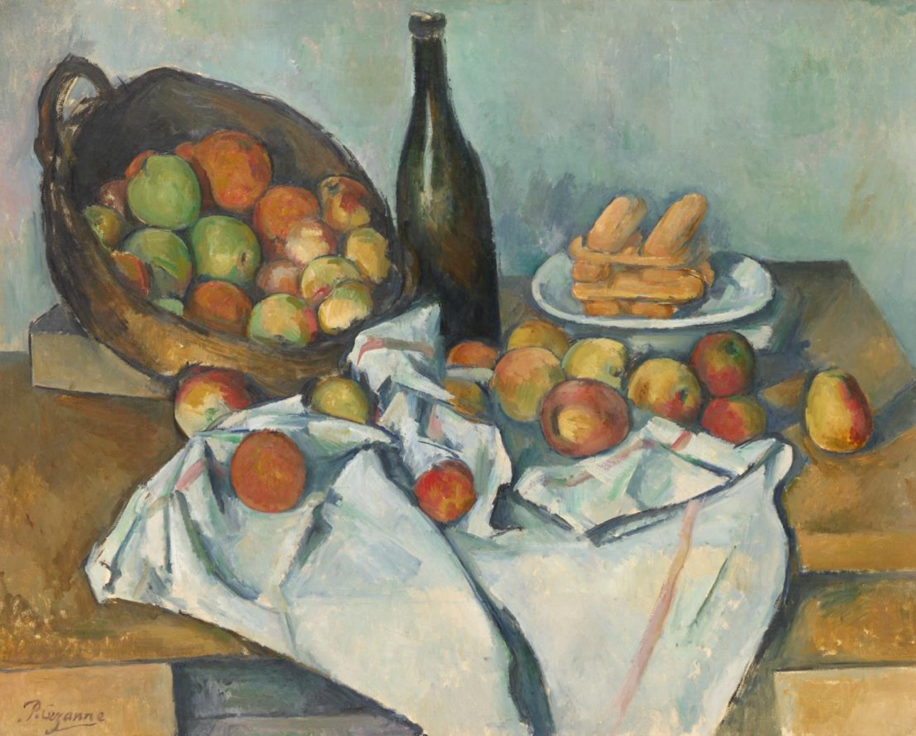
Paul Cézanne, 'Still Life with a Basket of Apples' (c.1895)