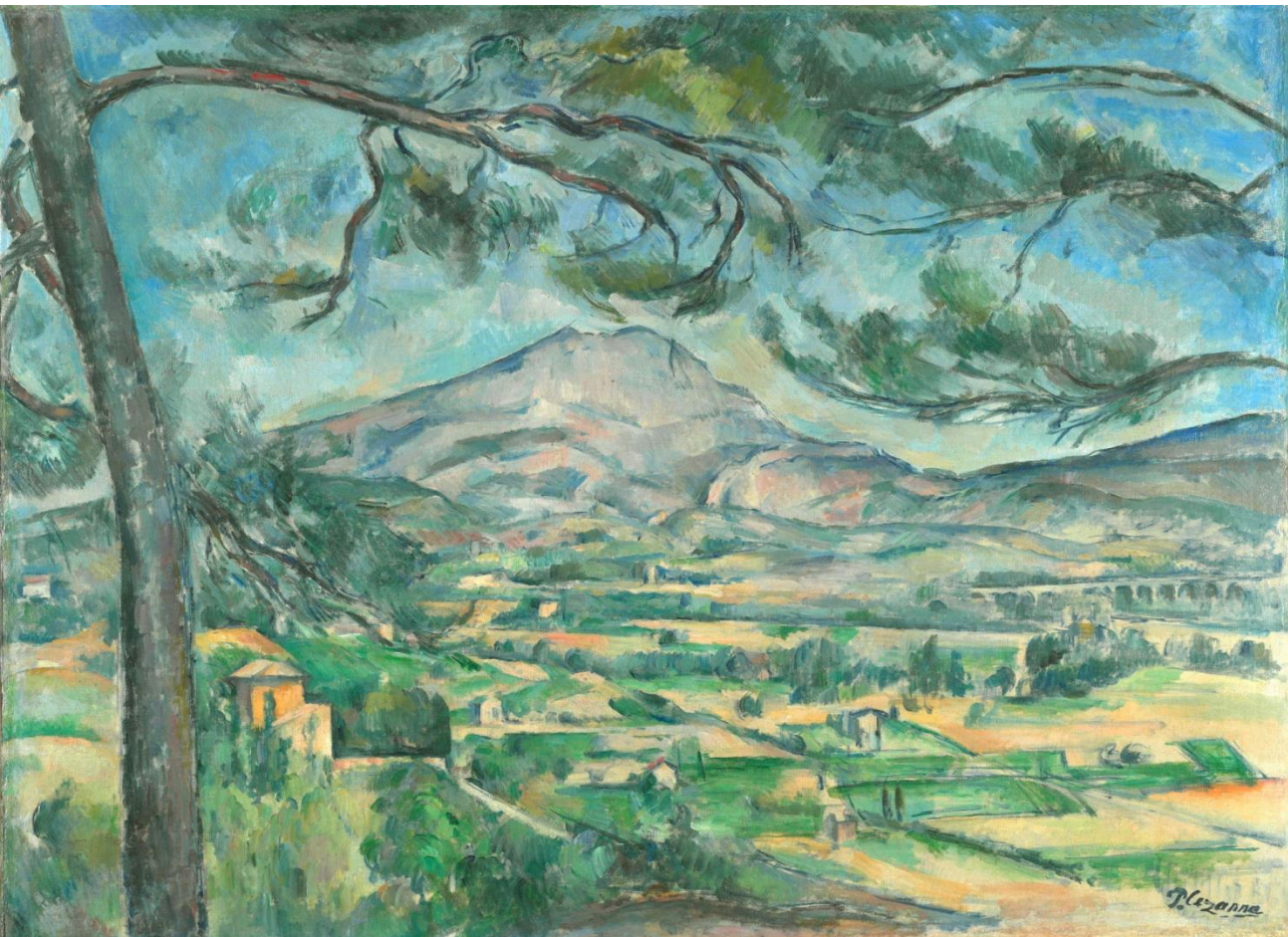
Paul Cézanne, 'Mont Sainte-Victoire with Large Pine' (c.1887); Claude Monet, 'Haystacks' (1891)