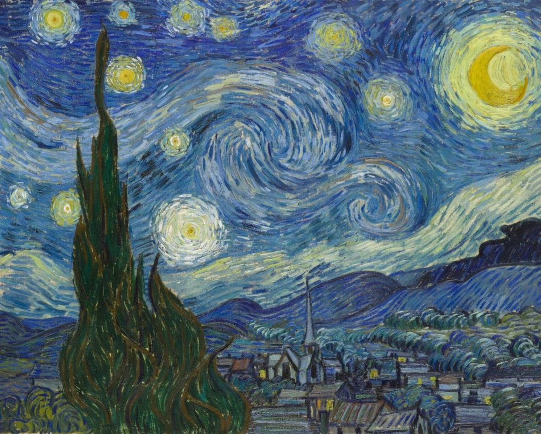
Vincent van Gogh, 'Starry Night' (1889)