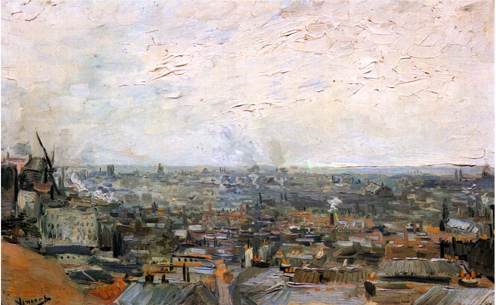
Vincent van Gogh, "View of Paris from Montmartre" (1886)