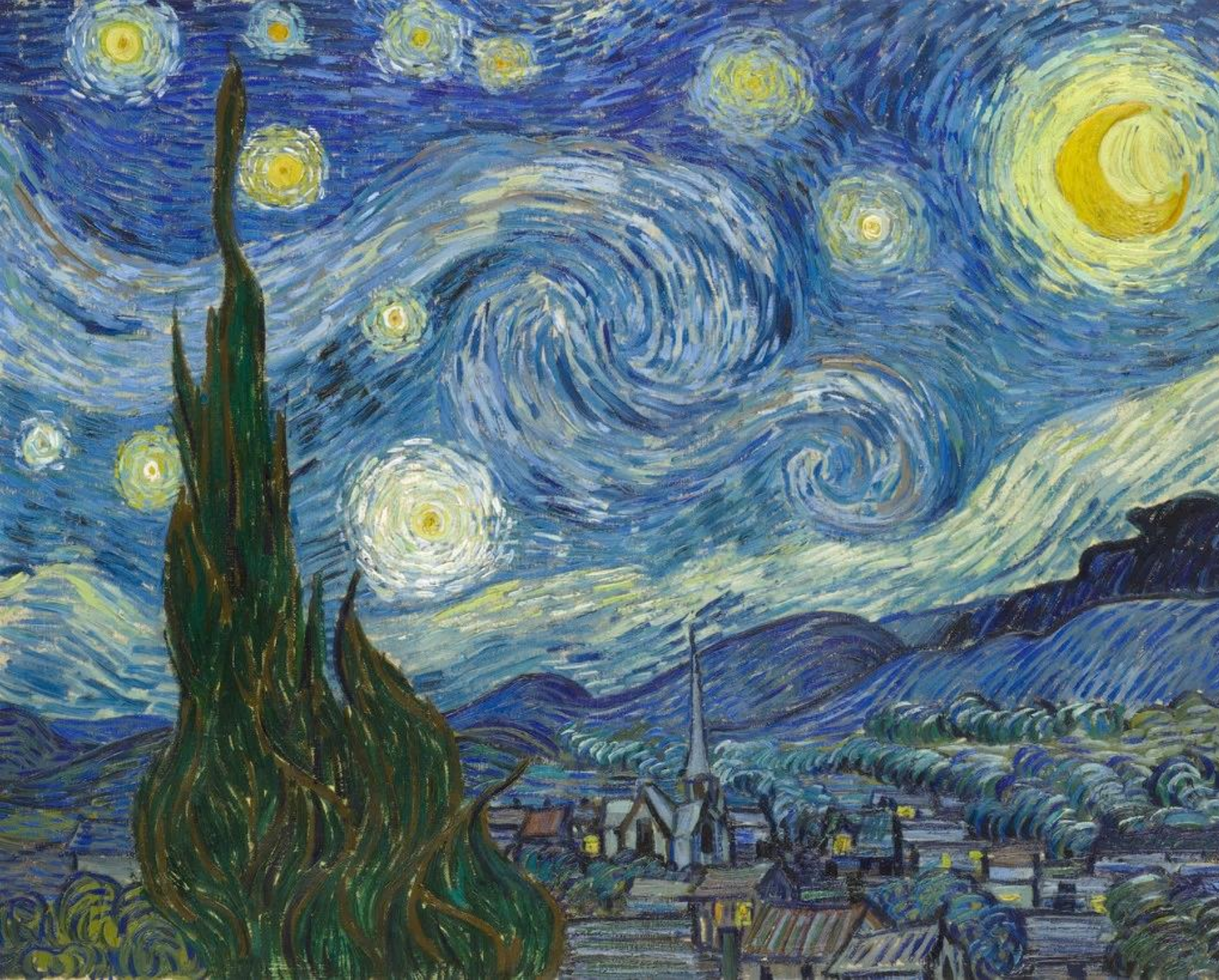
Vincent van Gogh, "Starry Night" (1889)