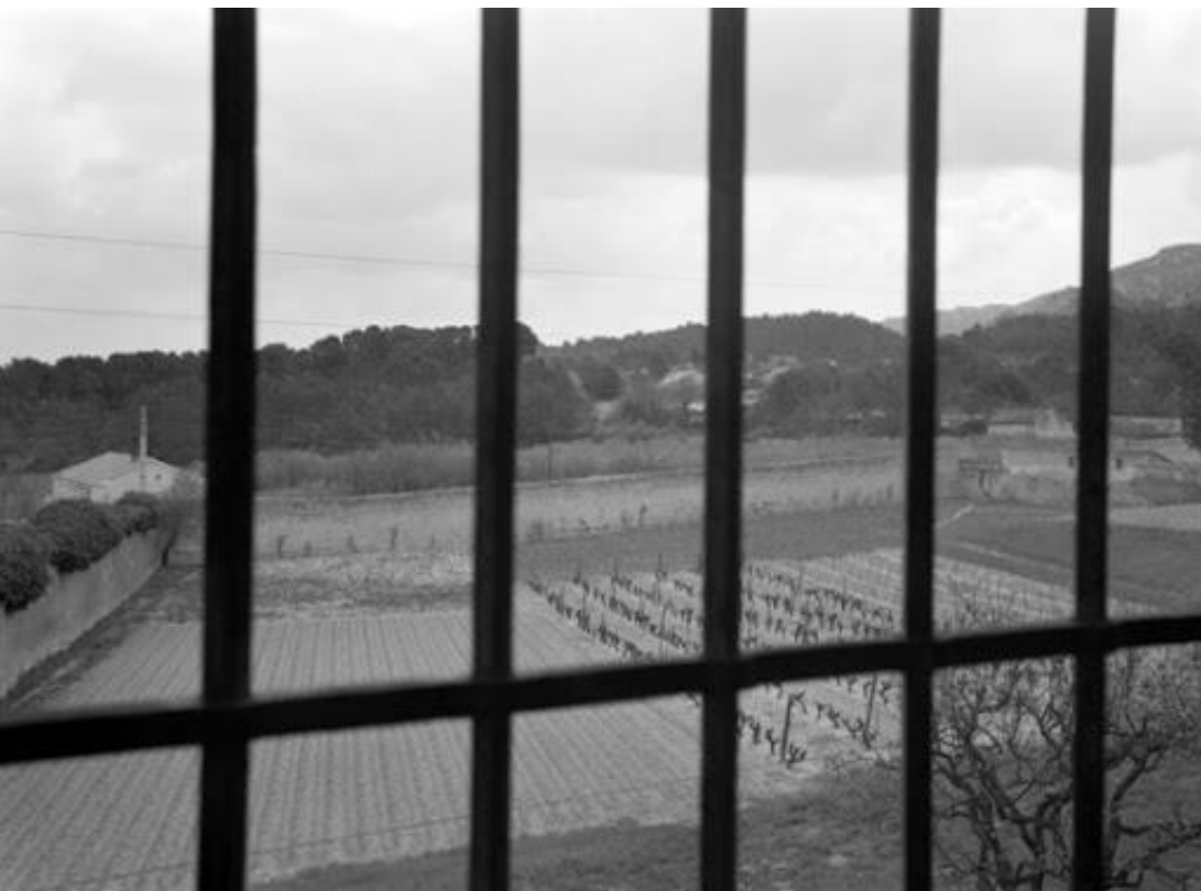
View from van Gogh's room at the Asylum of Saint Paul de Mausole in Saint Remy de Provence; "Starry Night" (1889)