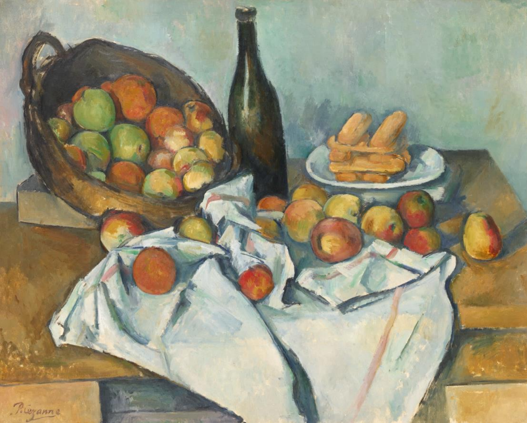
Paul Cezanne, "Still Life with a Basket of Apples" (c.1895)