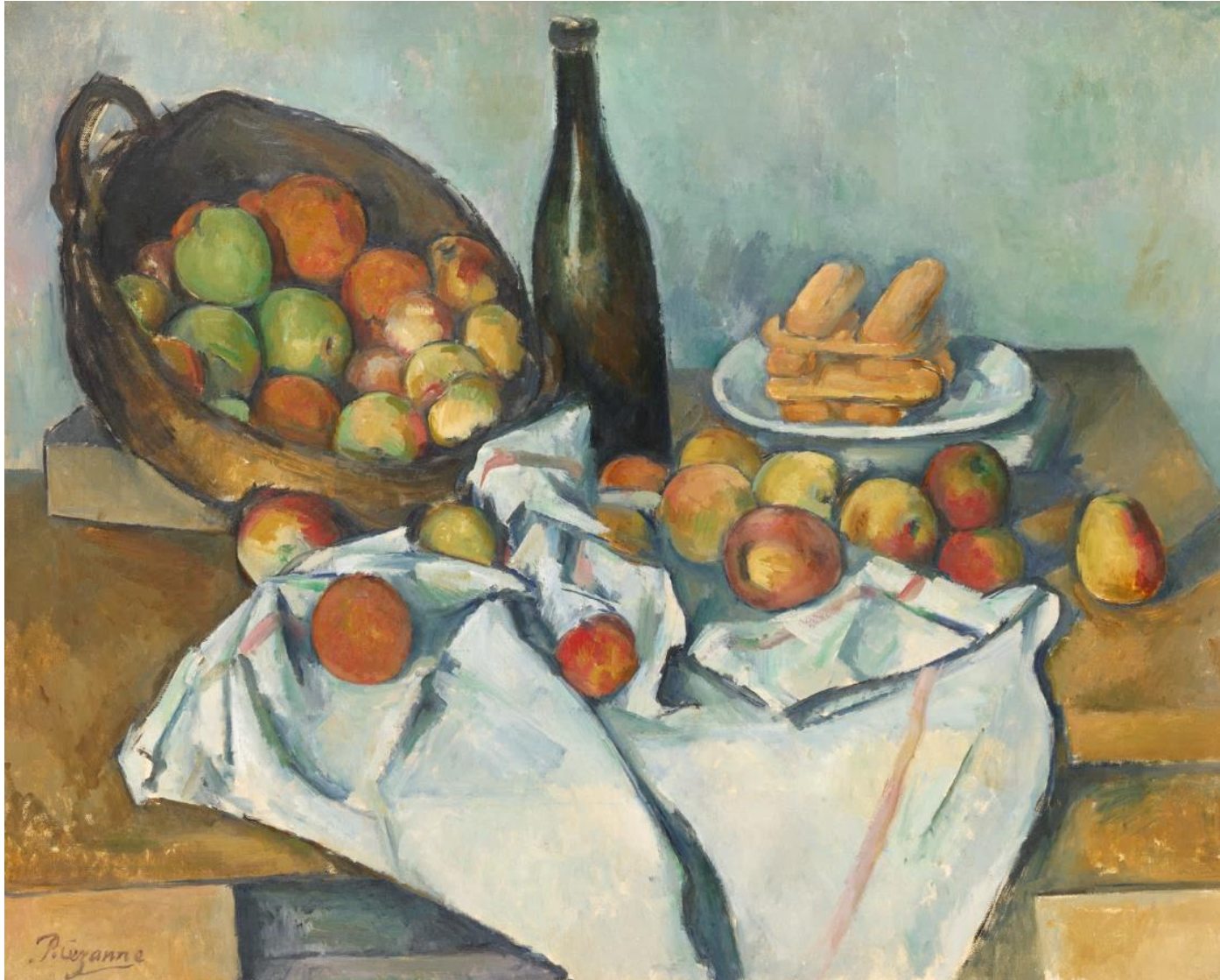
Paul Cezanne, "Still Life with a Basket of Apples" (c.1895); Pieter Claesz, "Still Life with Drinking Vessels" (1649)