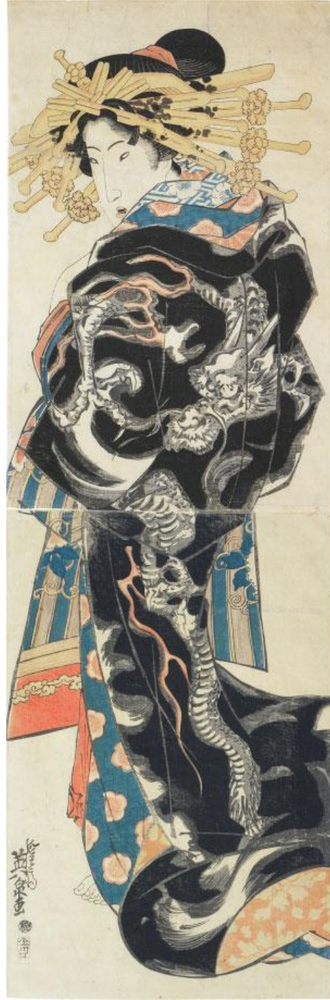
Vincent van Gogh, "Courtesan" (1887); Keisai Eisen, print depicting a courtesan wearing an kimono with a dragon design (Japan, c.1835)