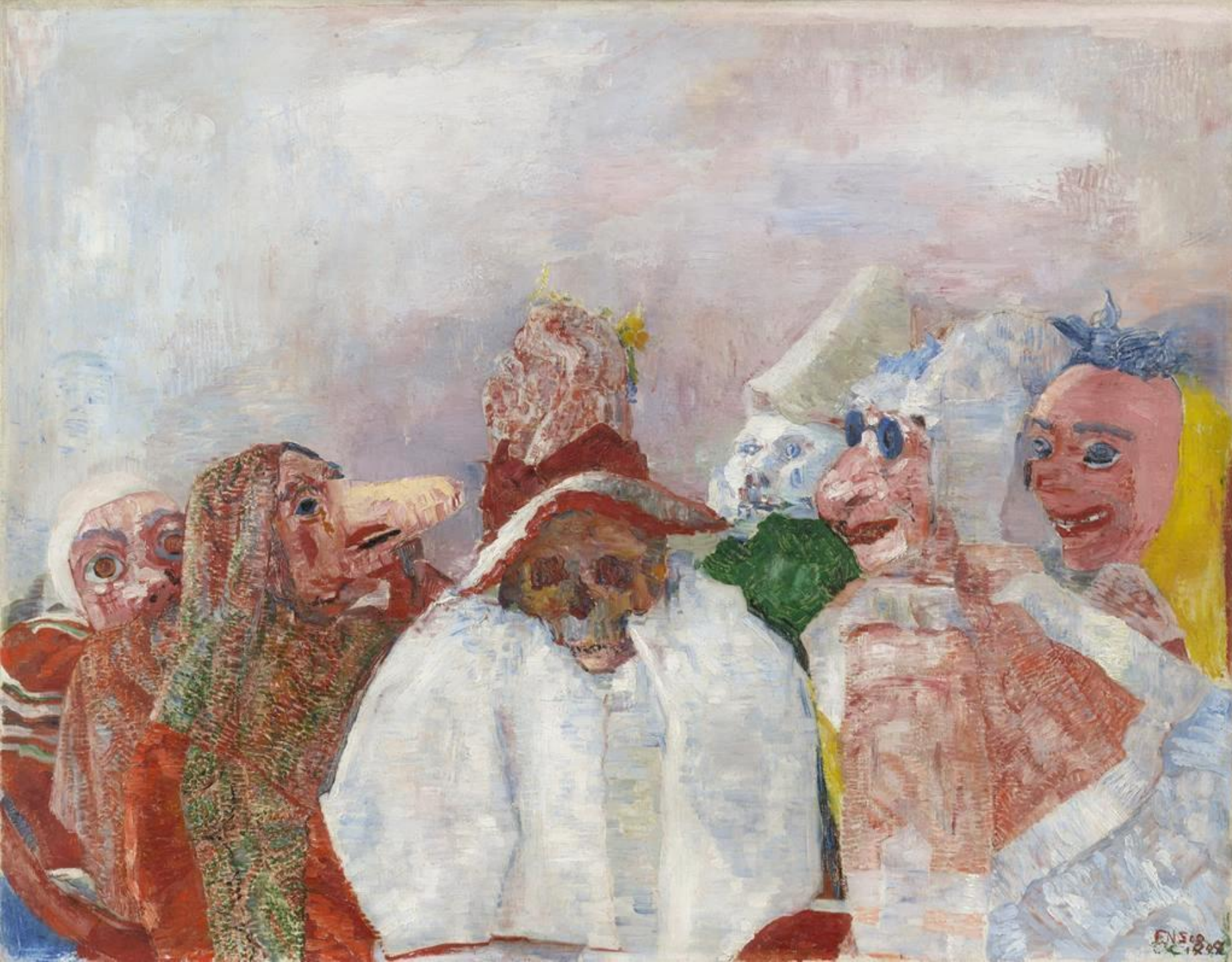
James Ensor, "Masks Confronting Death" (1888)