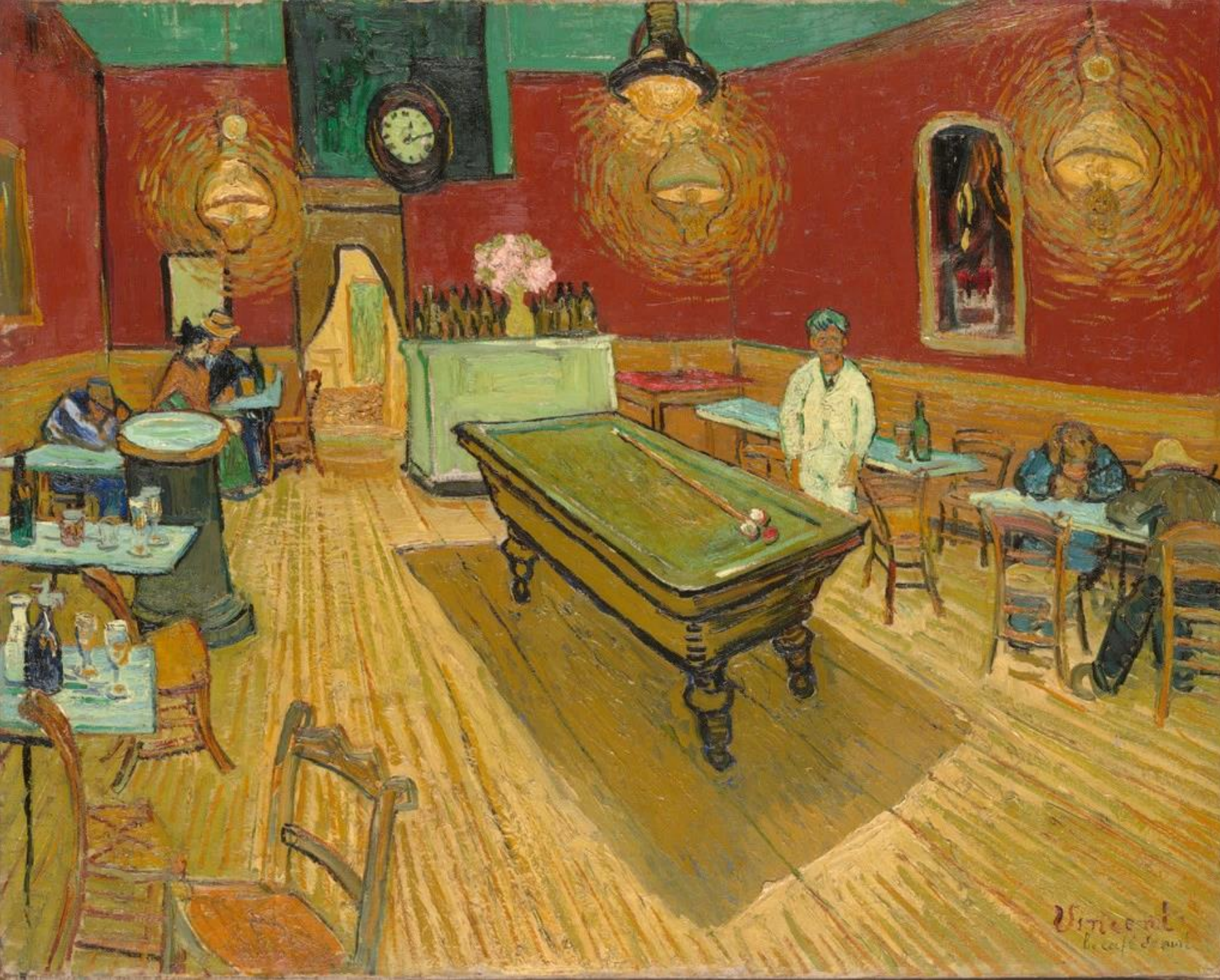
Vincent van Gogh, "The Night Café" (1888)