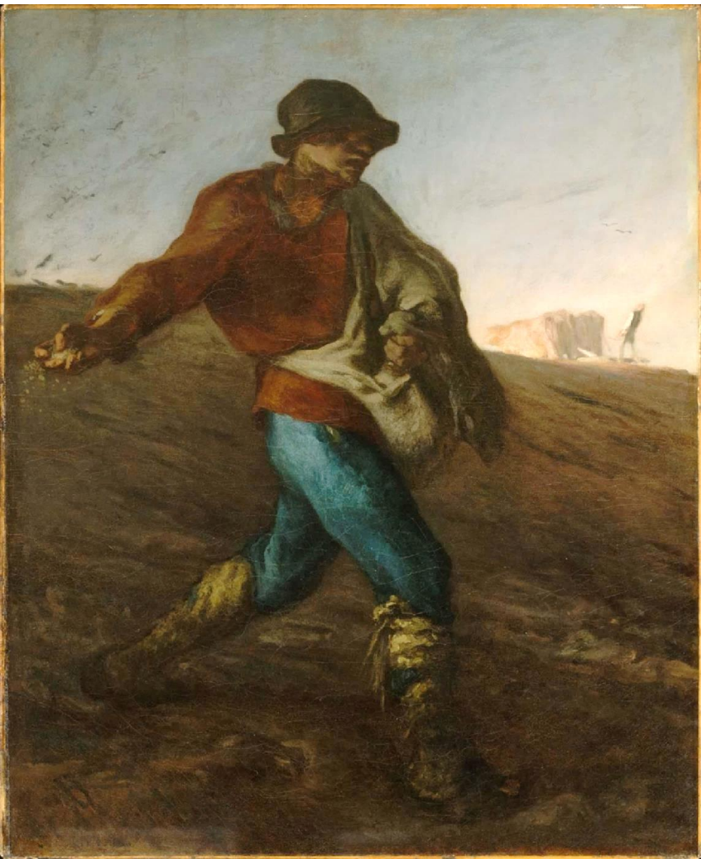
Jean-François Millet, "The Sower" (1850); Vincent van Gogh, "The Sower" (1888)