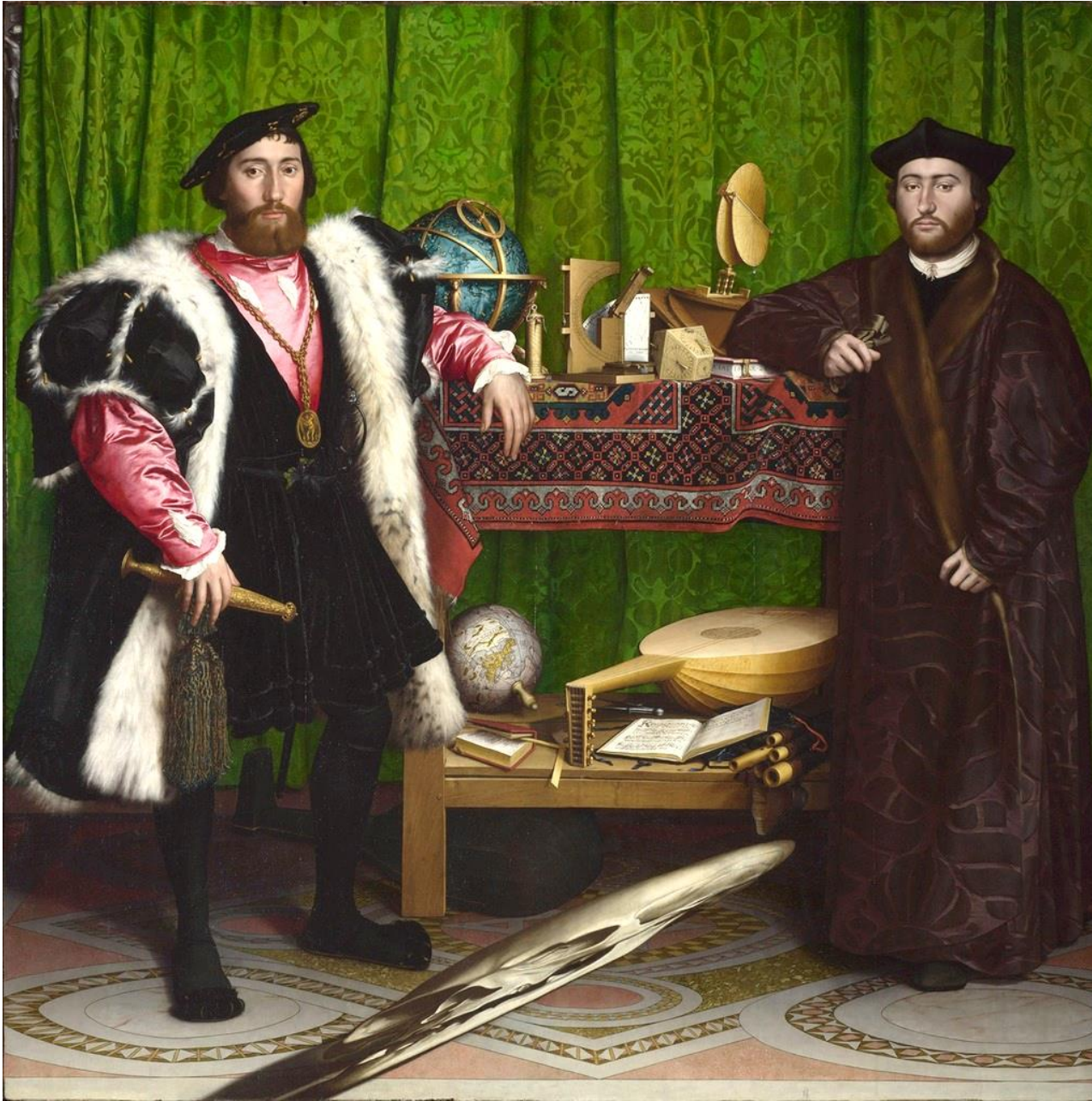
Hans Holbein the Younger, full view and oblique detail view of “The French Ambassadors” (1533)