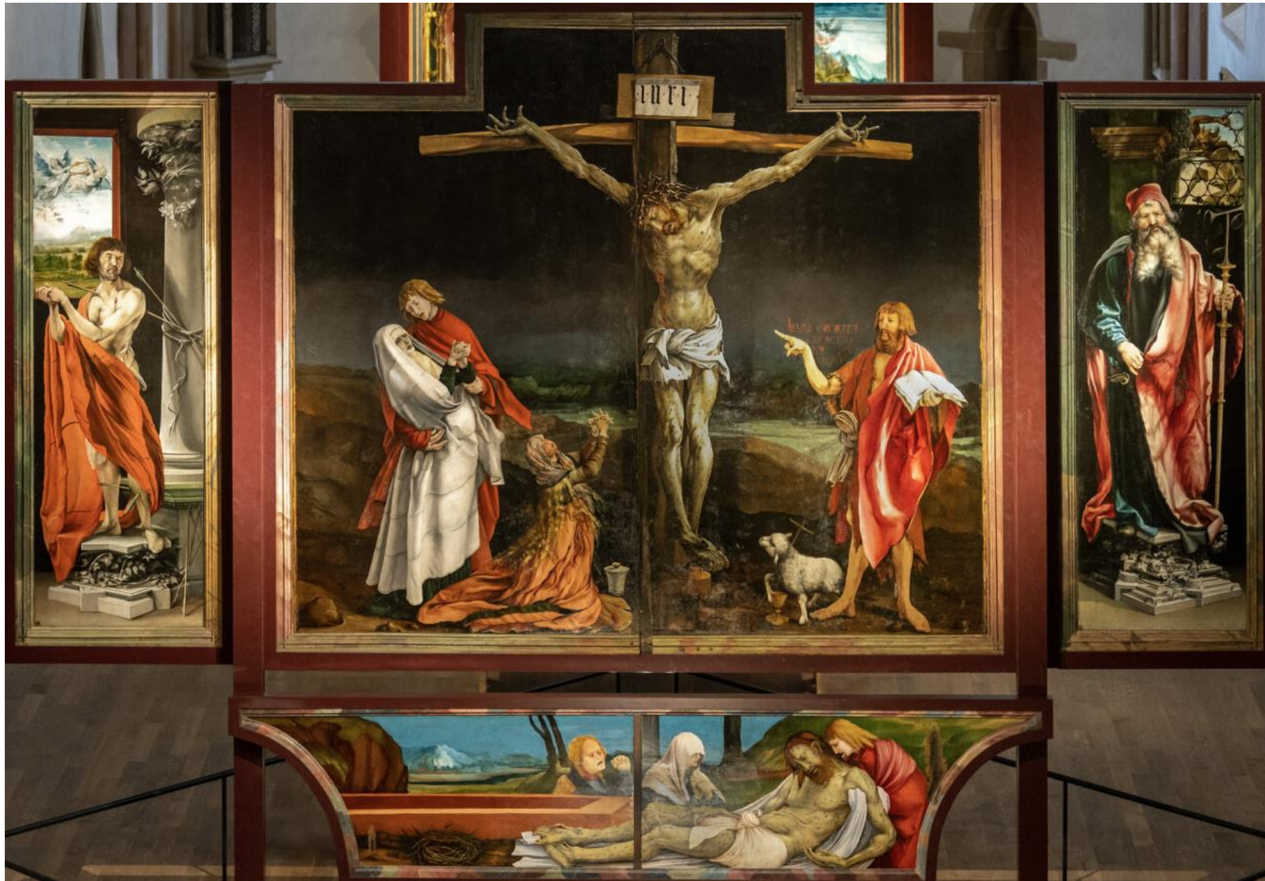
Matthias Grünewald, paintings created for the exterior of the Isenheim Altarpiece (c.1510)