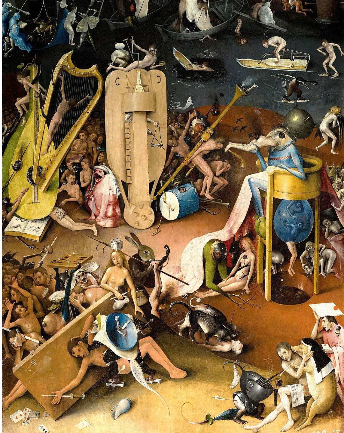
Hieronymus Bosch, interior right panel of the “Garden of Earthly Delights Triptych” (c.1510)