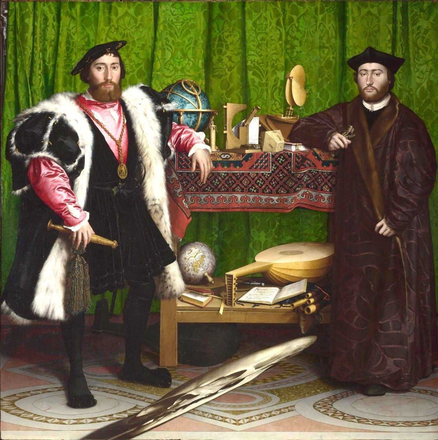
Hans Holbein the Younger, "The French Ambassadors" (England, 1533)