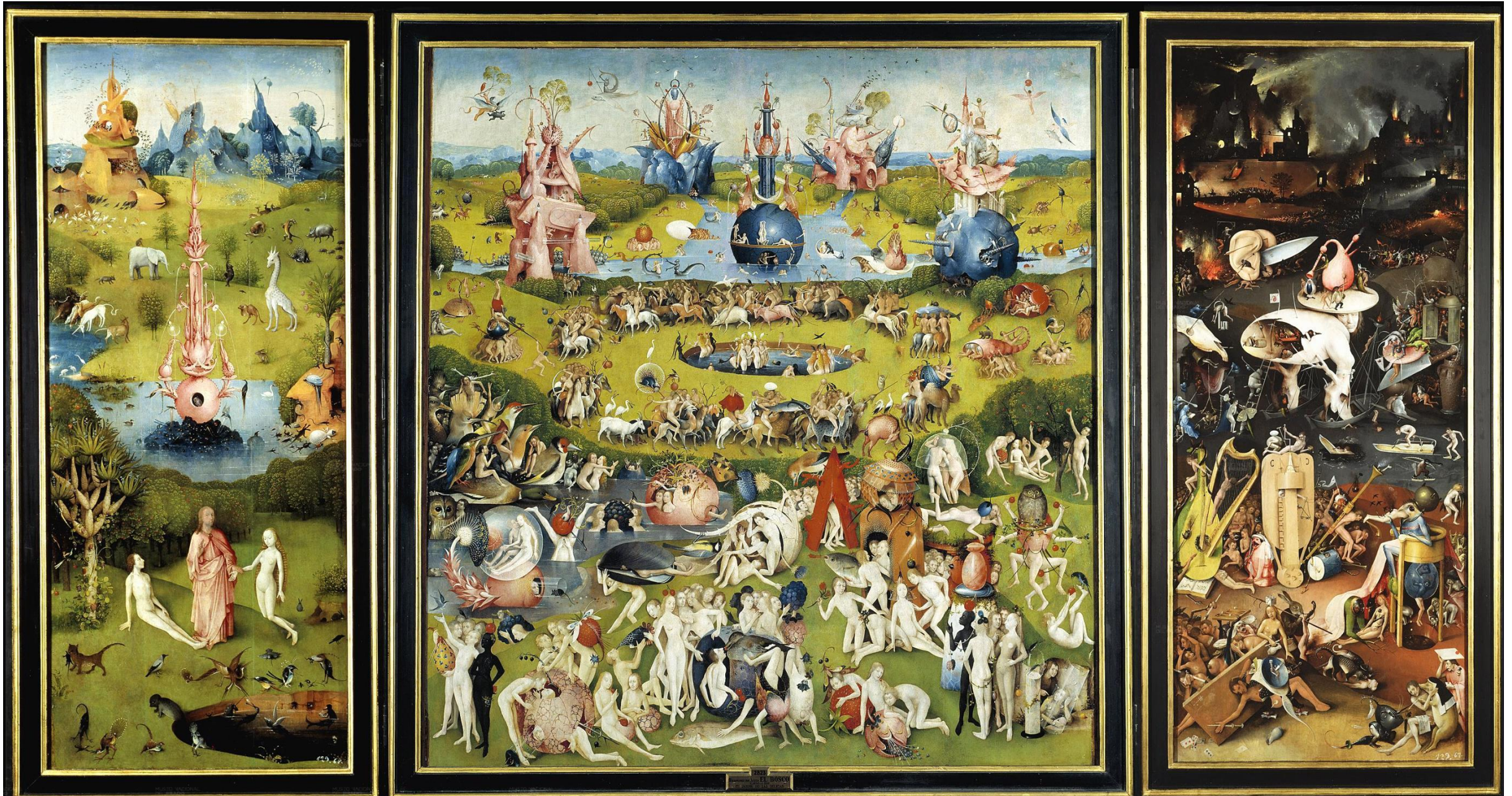
Hieronymus Bosch, interior of the “Garden of Earthly Delights” Triptych” (c.1510)