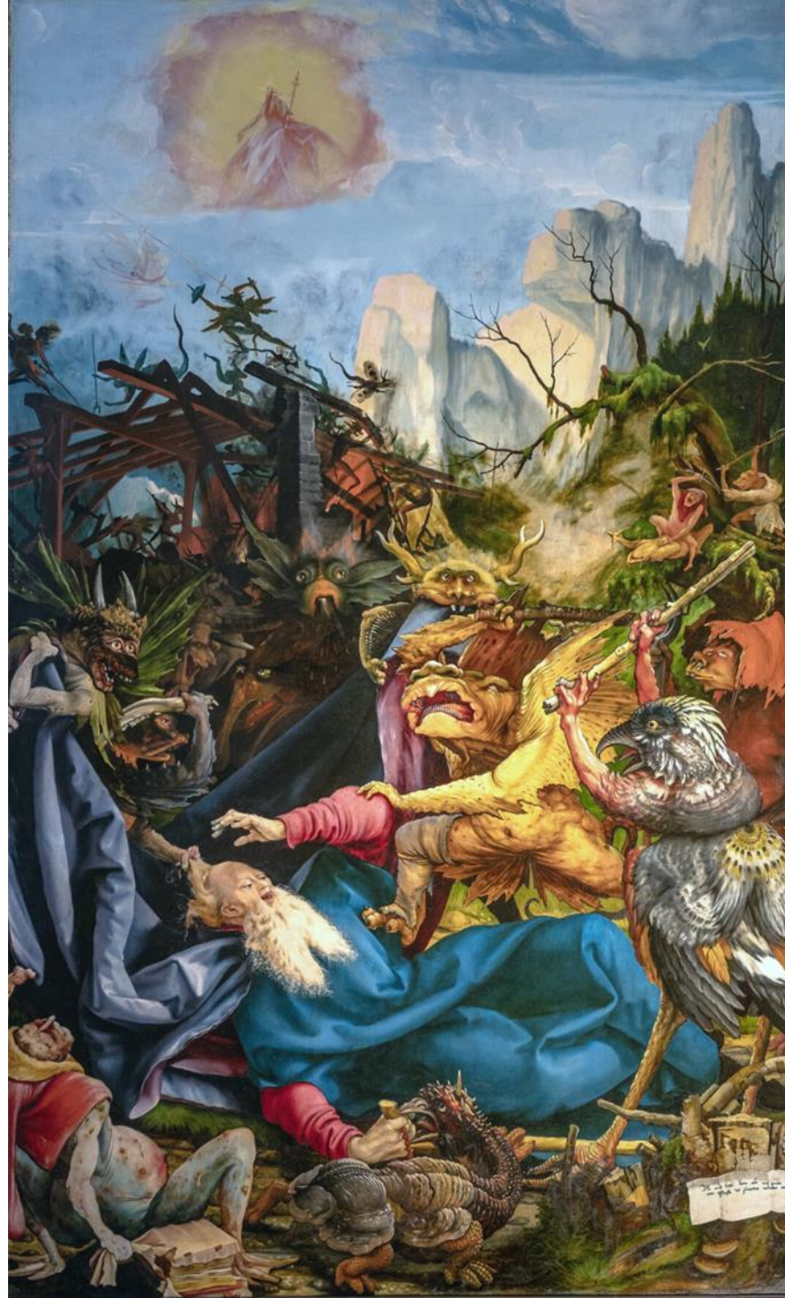
Matthias Grünewald, paintings depicting Saint Anthony for the Isenheim Altarpiece (c.1510)