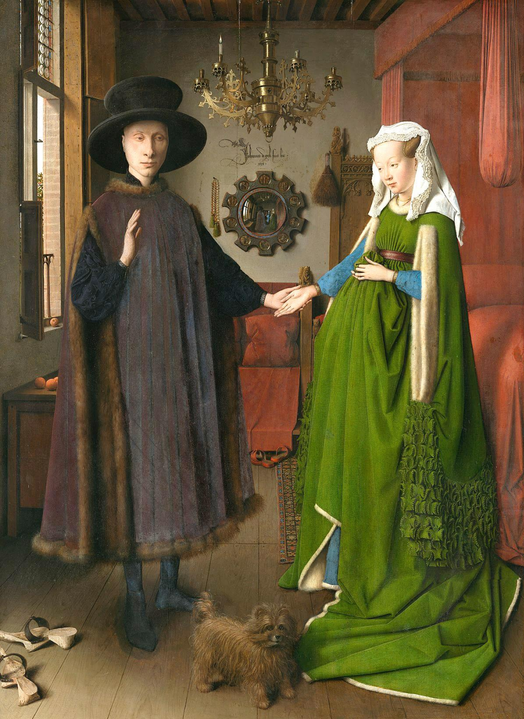
Jan van Eyck, “Double Portrait of Giovanni Arnolfini and His Wife” (Flanders, 1434)