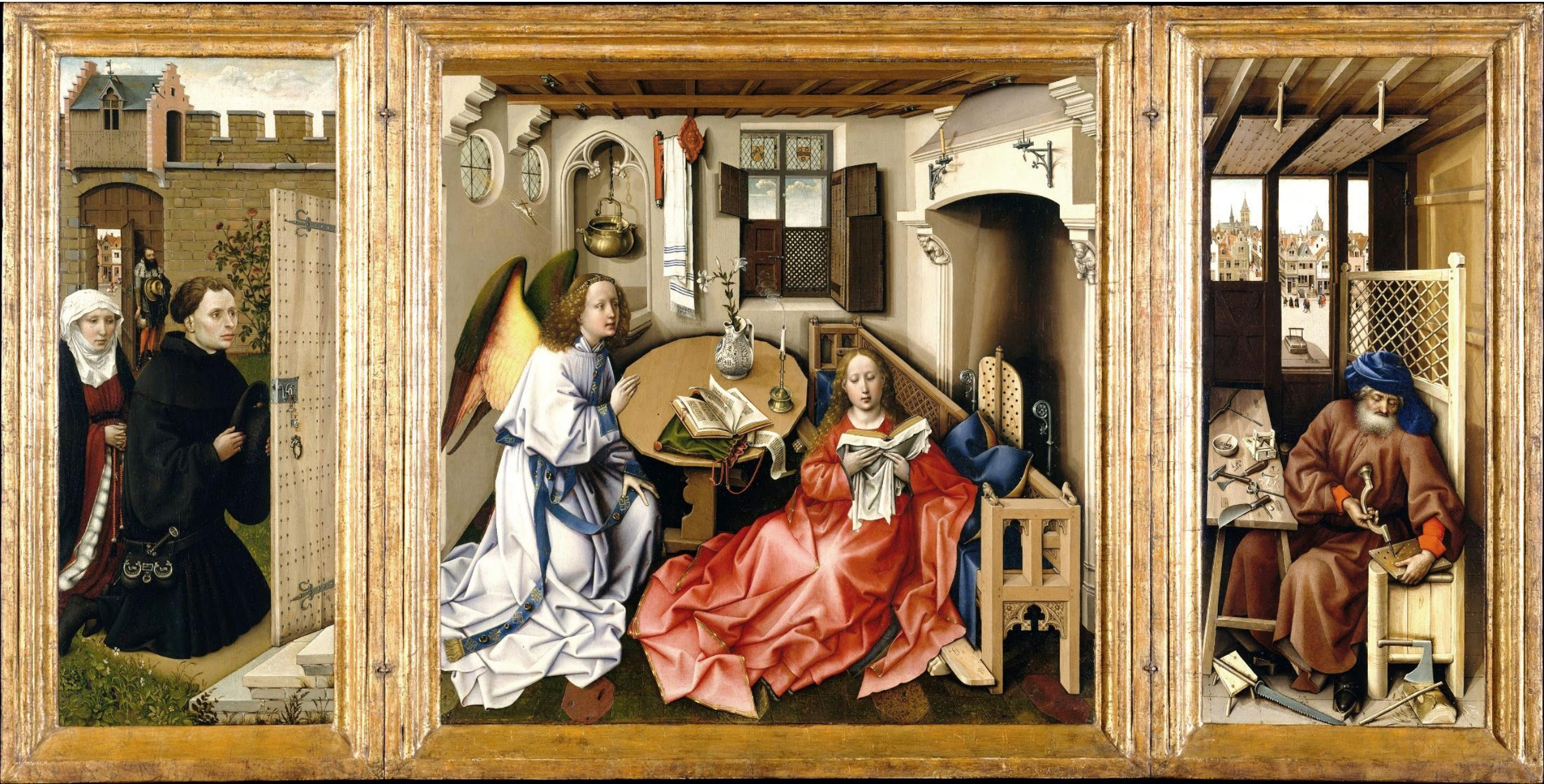
Workshop of the Master of Flémalle, "Mérode Altarpiece" (Flanders, c.1425)