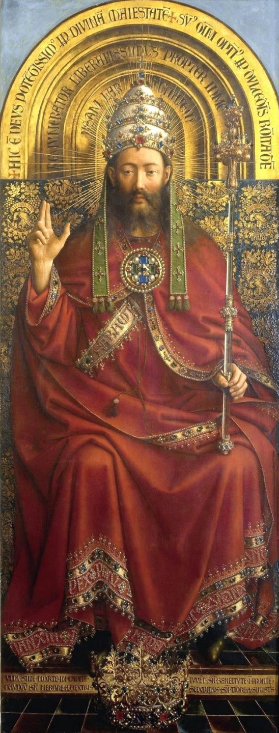
Details from the interior of the “Ghent Altarpiece”: God enthroned and the Lamb of God adored by saints and angels (1432)