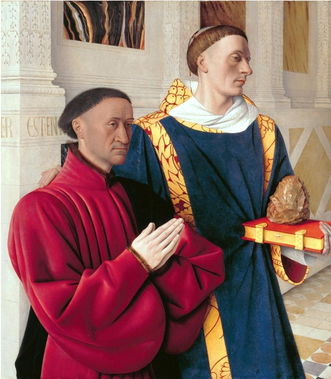
Jean Fouquet, "Melun Diptych" – "Étienne Chevalier and St. Stephen," "Virgin and Child" (c.1455)