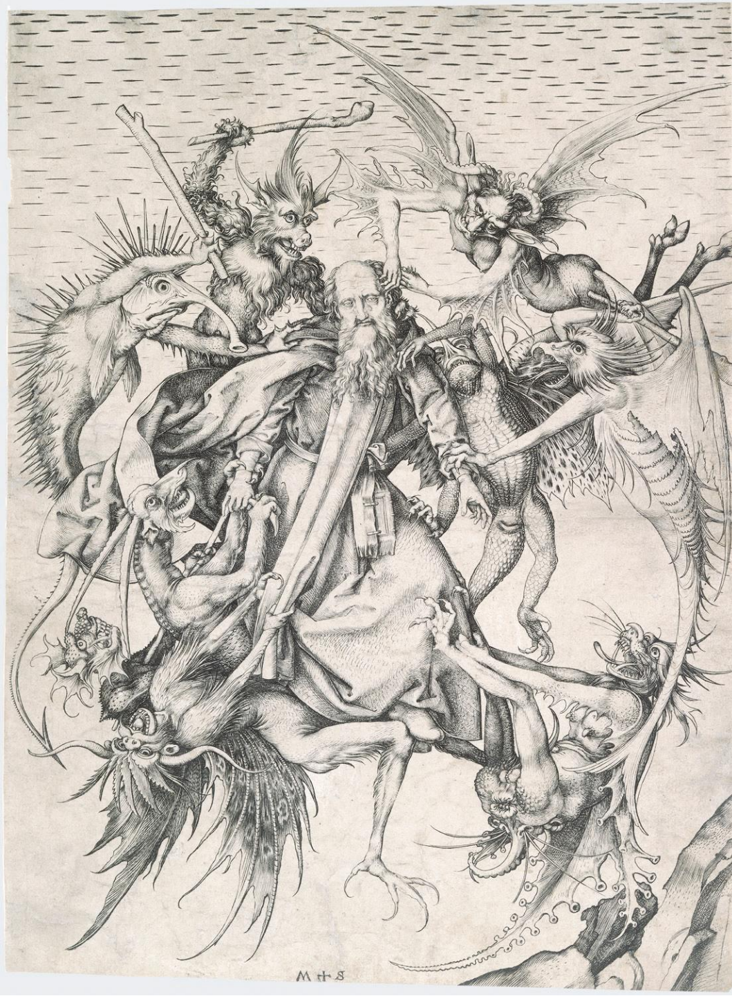
Martin Schongauer, engraving depicting the “Temptations of St. Anthony” (c.1475)