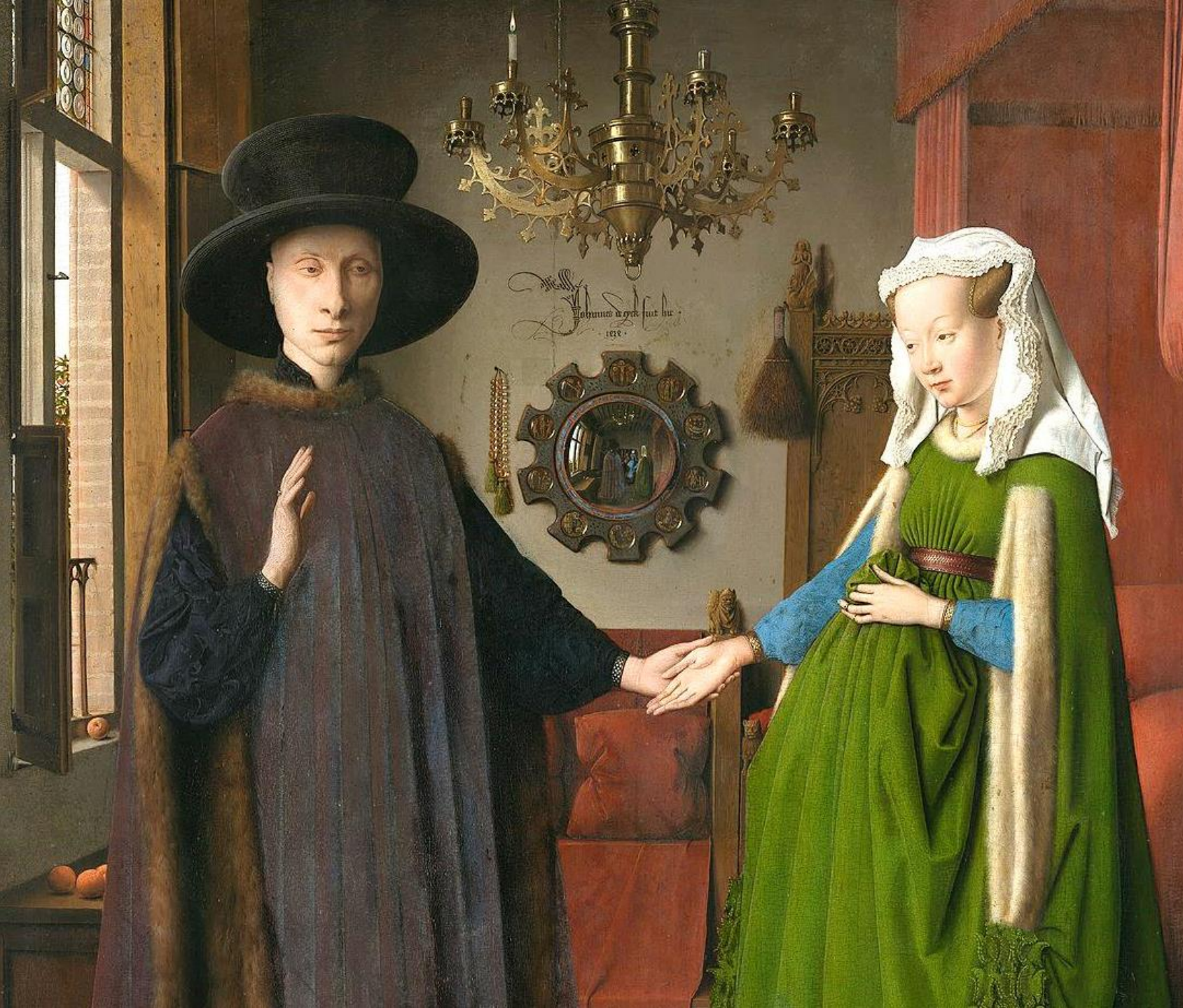
Detail from the “Double Portrait of Giovanni Arnolfini and His Wife” (1434)