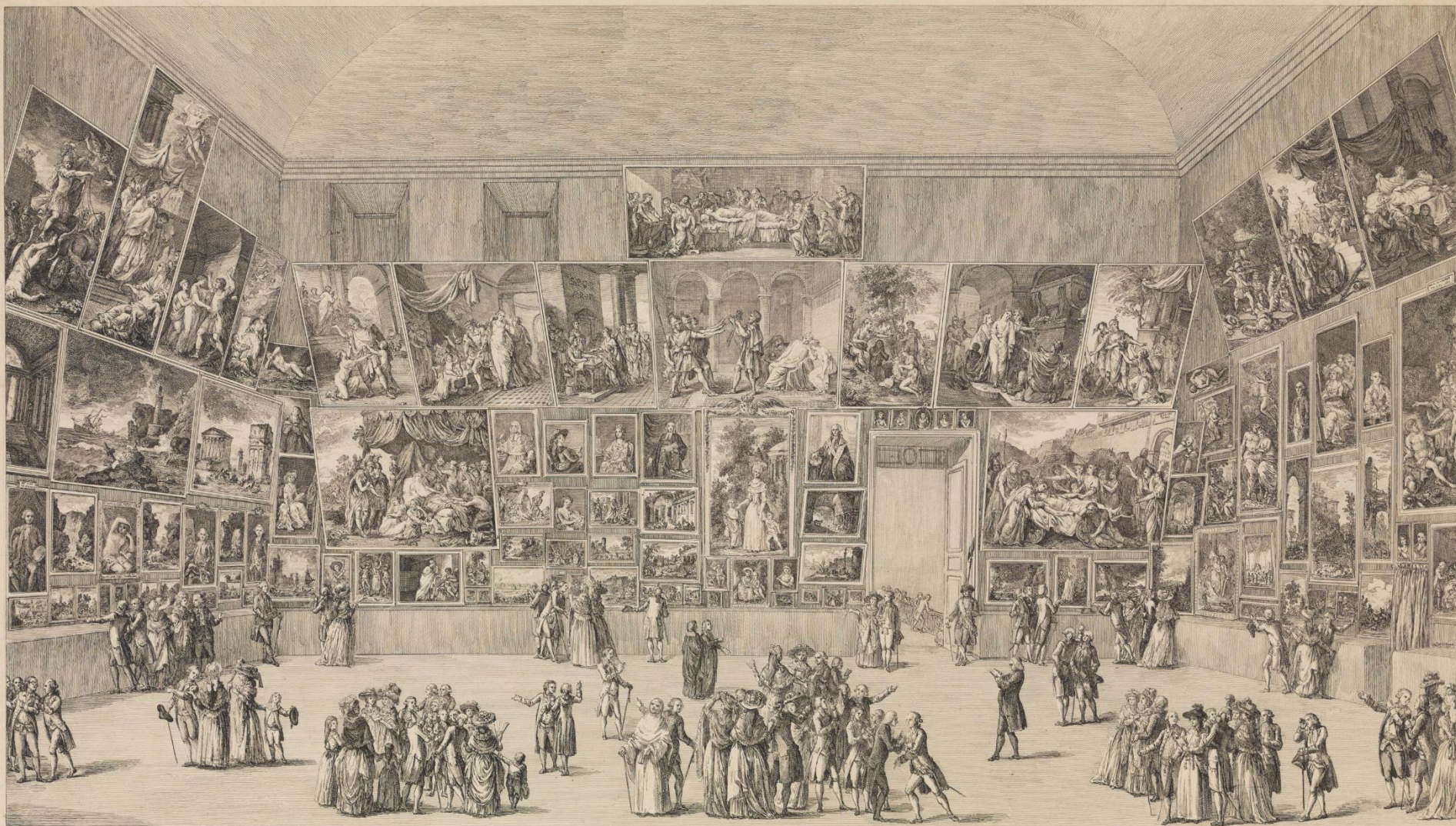
Coup-d'œil exact de l'arrangement des Peintures au Salon du Louvre, en 1785. Gravé de mémoire, et terminé durant le temps de l'exposition.