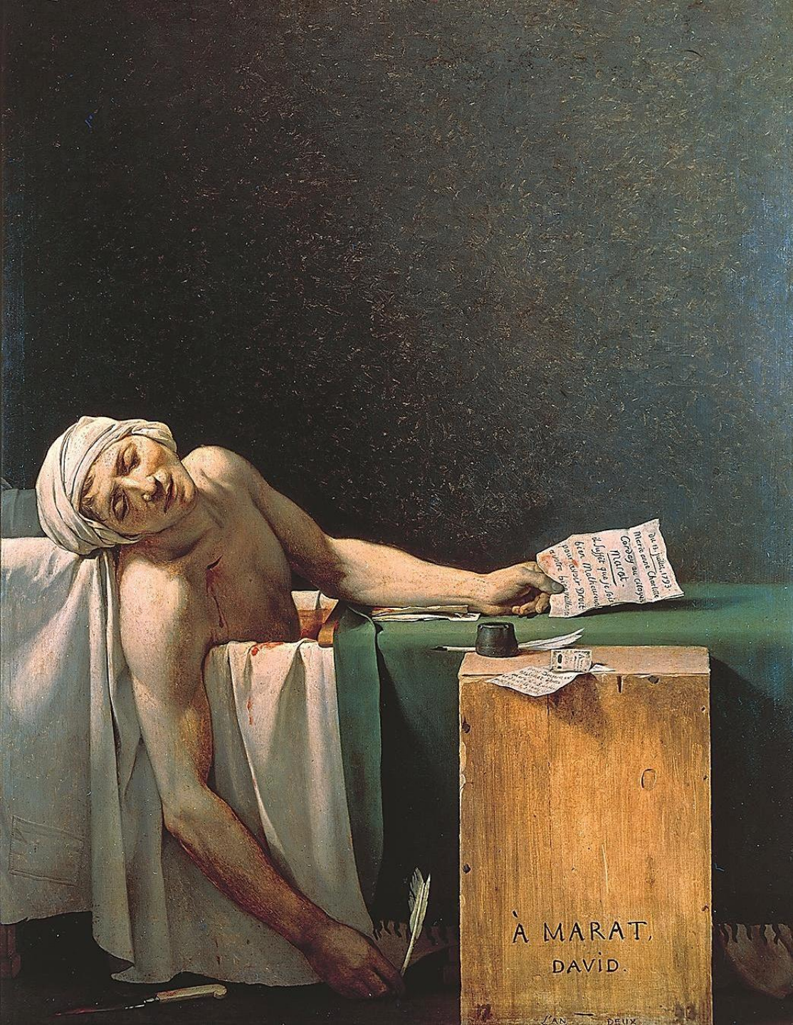
Jacques-Louis David, 'Death of Marat' (France, 1793)