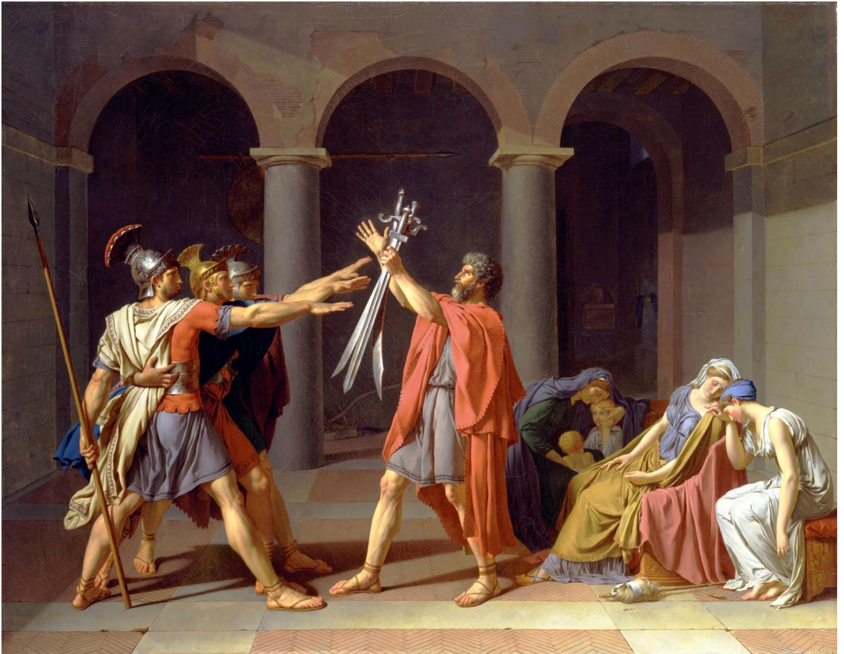
Jacques-Louis David, 'Oath of the Horatii' (France, 1784)