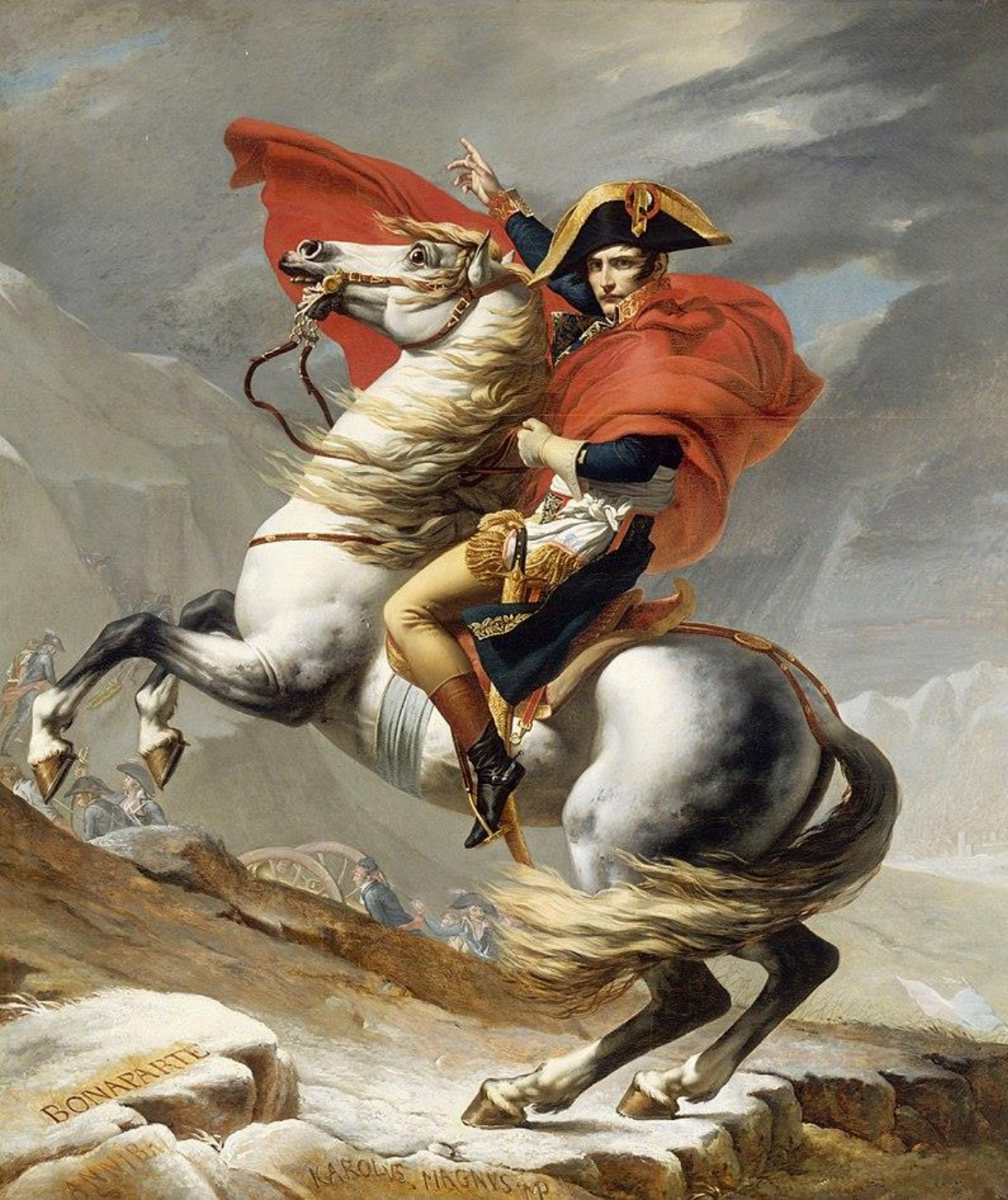
Jacques-Louis David, 'Napoleon Crossing the Alps' (France, c.1800)