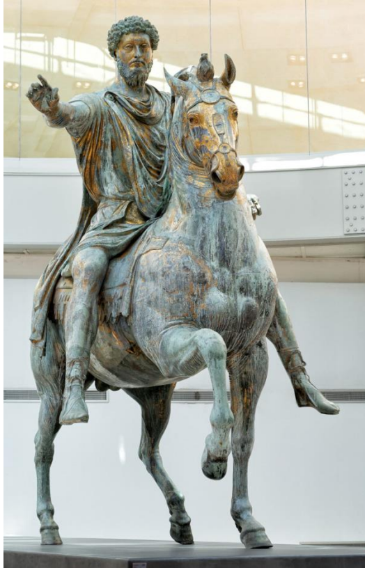
Equestrian portrait of Marcus Aurelius (Italy, c.175); Detail of a mosaic depicting Alexander the Great (Italy; original painting c.310 BCE); David, 'Napoleon Crossing the Alps' (c.1800)