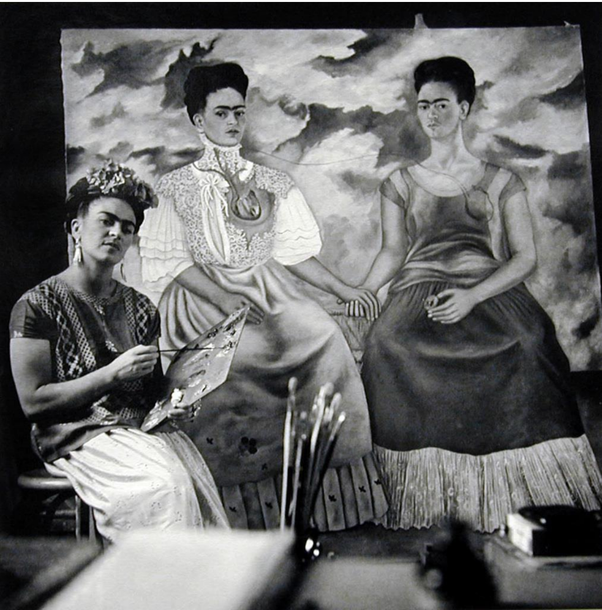
Frida Kahlo at work on, and detail from, 'The Two Fridas' (1939)