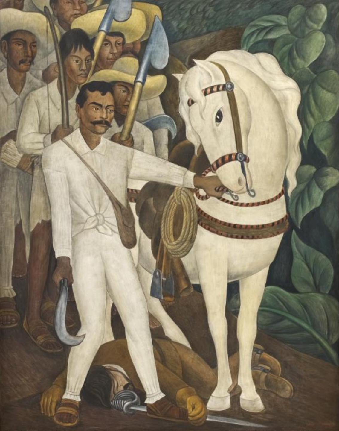
Diego Rivera, 'Agrarian Leader Zapata' (1931)