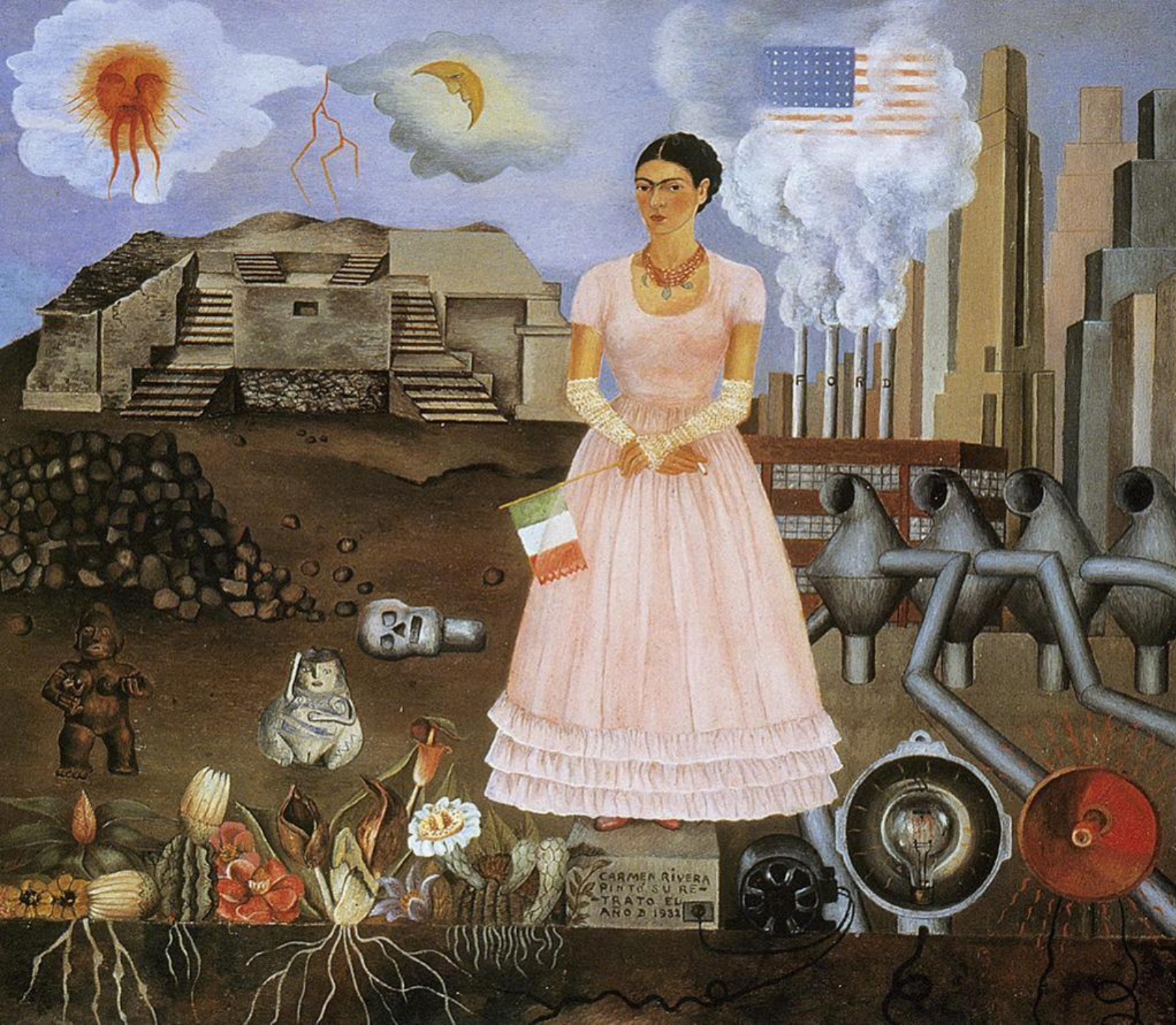
Frida Kahlo, 'Self Portrait on the Border' (1932)