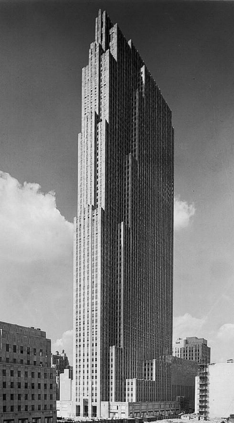
Rockefeller Center (1931-1939); Diego Rivera at work on 'Man at the Crossroads' (1934)