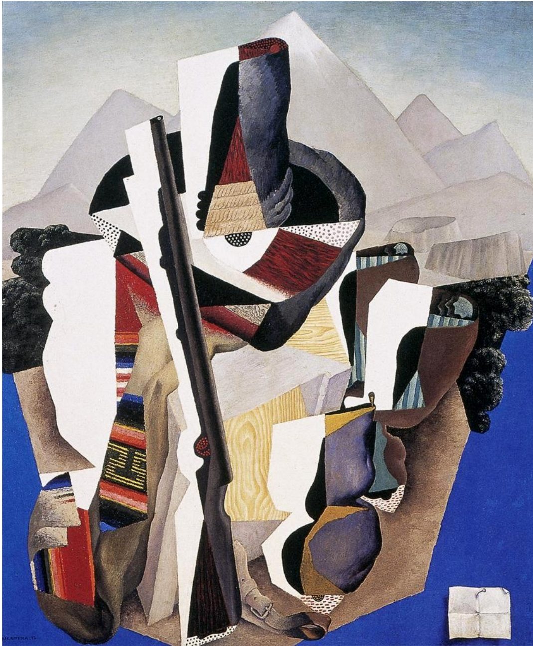
Diego Rivera, 'Zapatista Landscape' (1915); Photograph of Emiliano Zapata