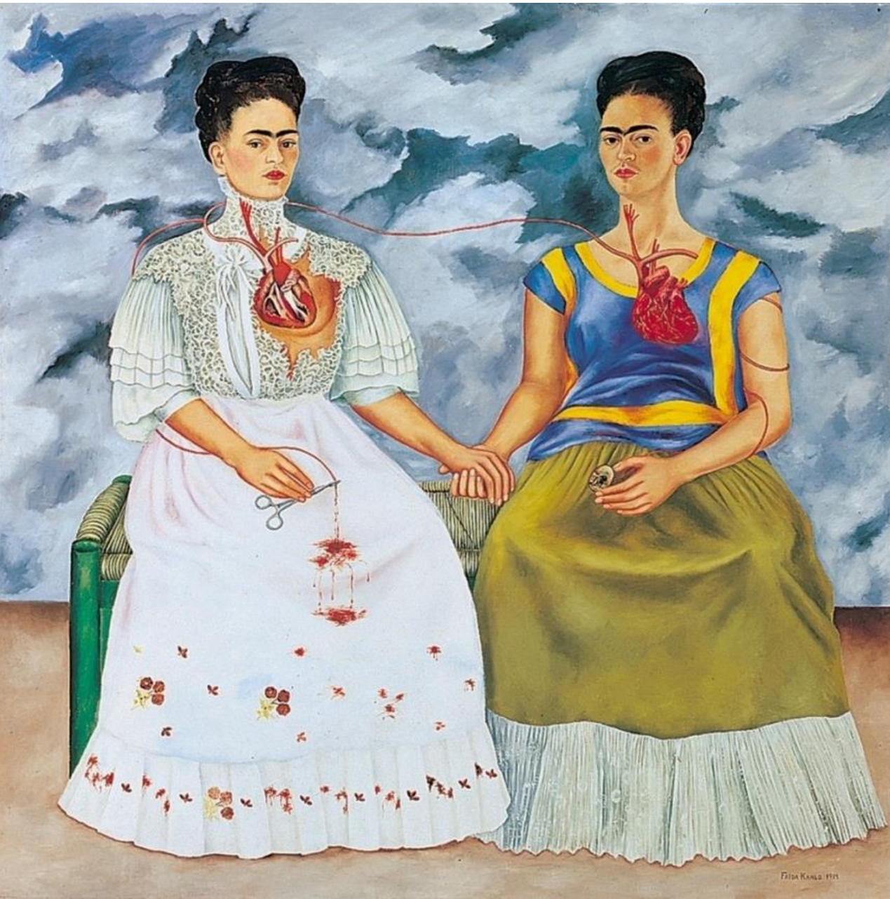
Frida Kahlo, "The Two Fridas" (1939); Aztec sculpture of Coatlicue (Mexico, 16 th century)