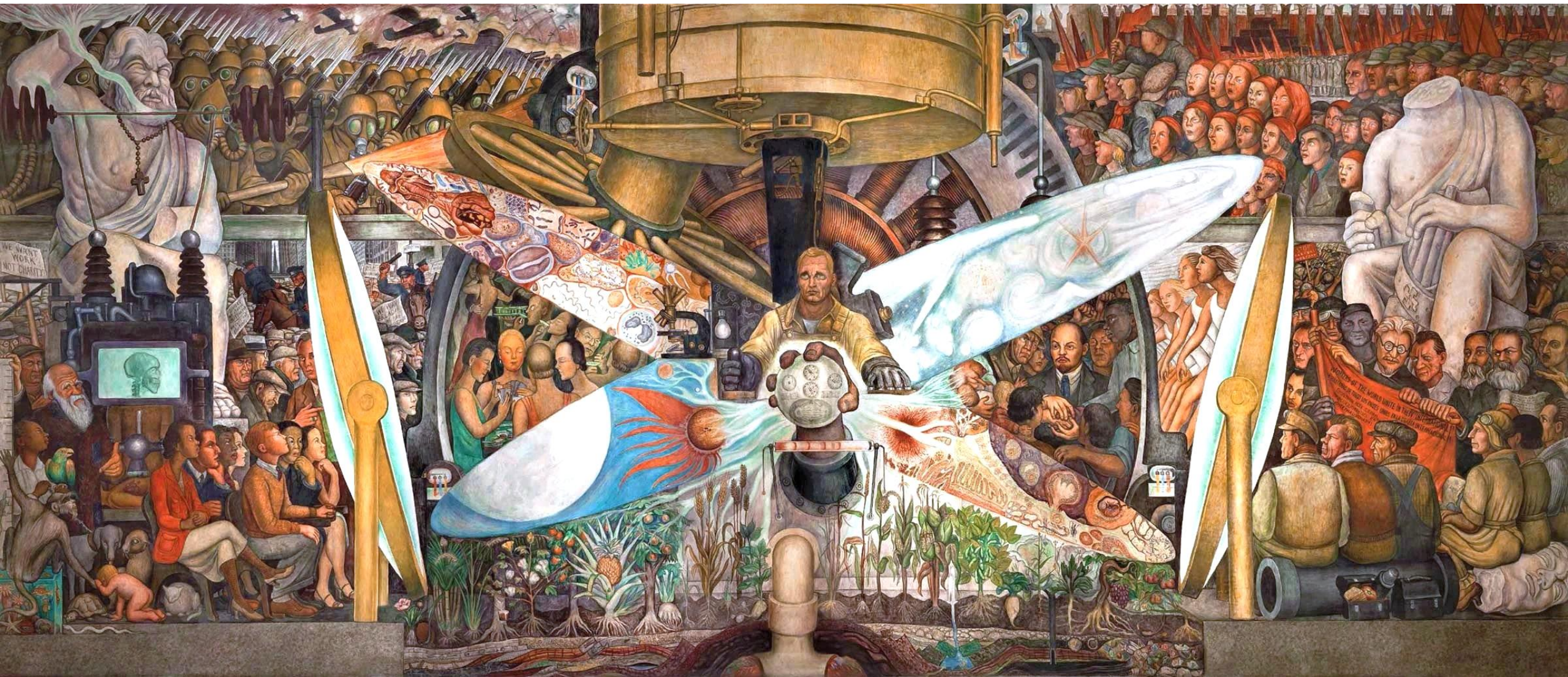
Diego Rivera, "Man at the Crossroads" (Rockefeller Center, New York City) → "Man, Controller of the Universe" (Palace of Fine Arts, Mexico City, 1934)