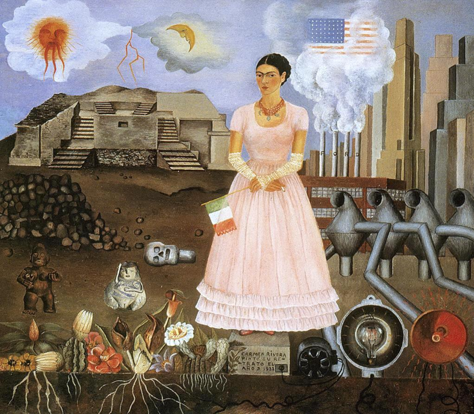
Frida Kahlo, "Self Portrait on the Border" (1932)