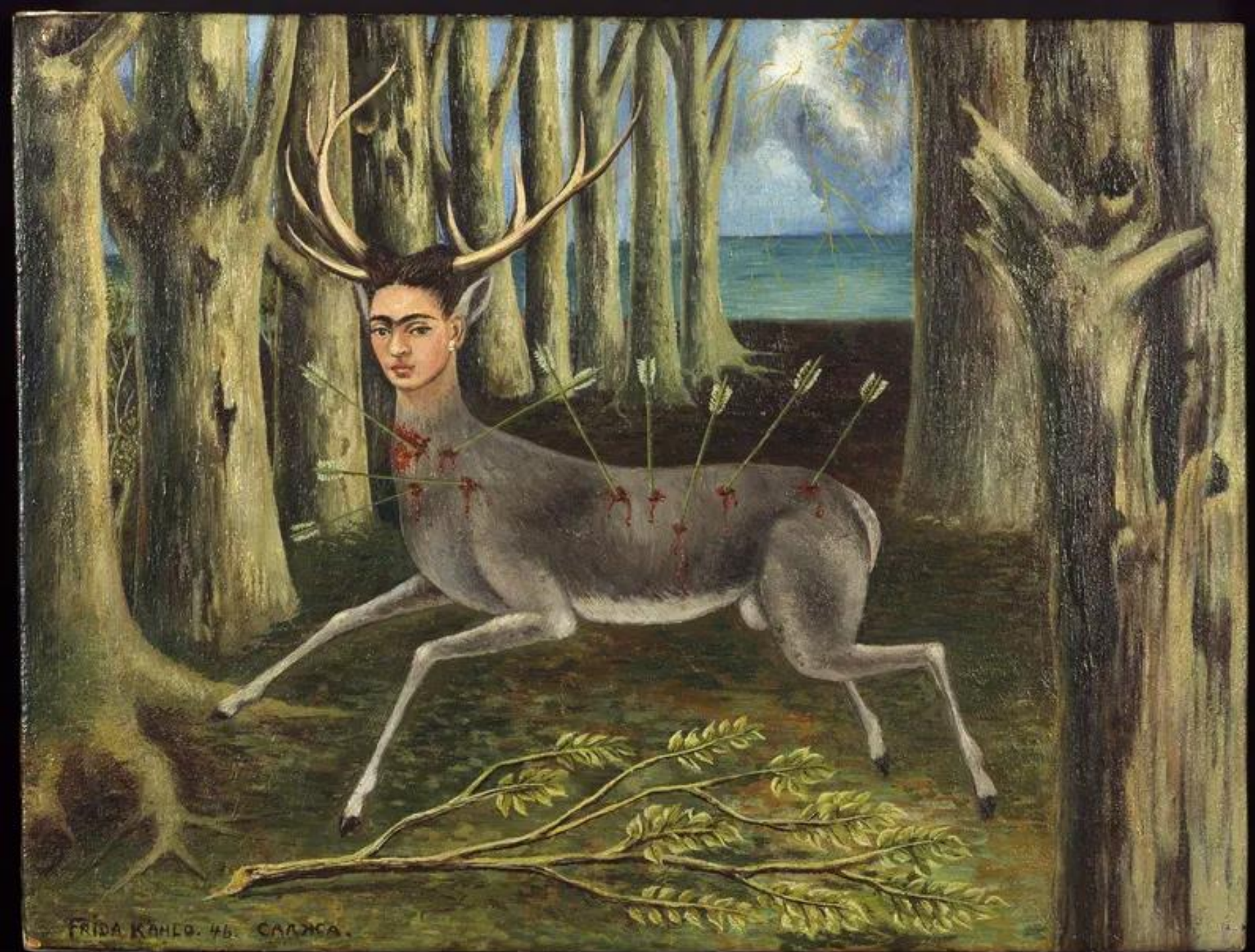
Frida Kahlo, "The Wounded Deer" (1946)