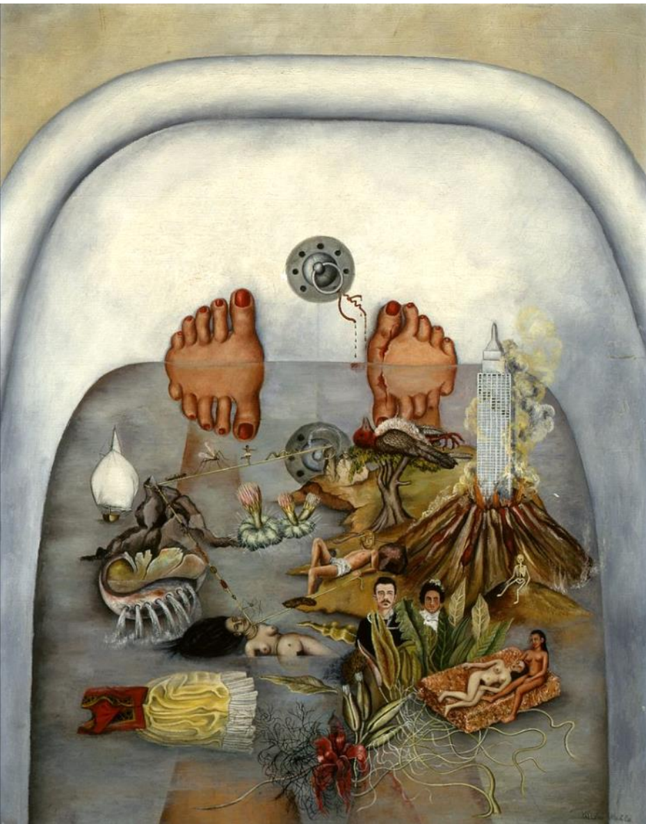
Frida Kahlo, "What the Water Gave Me" (1938)