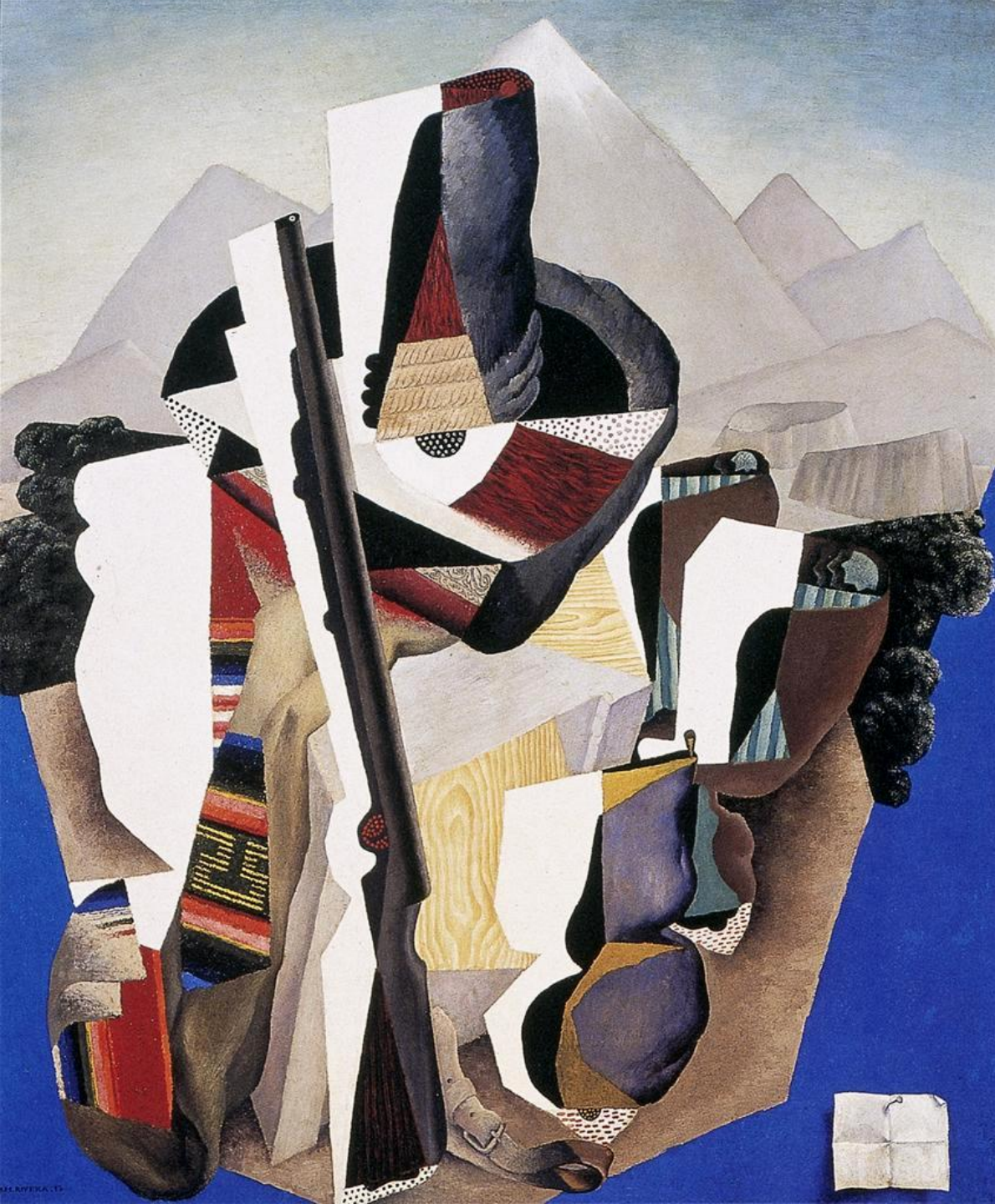
Diego Rivera, "Zapatista Landscape" (1915); photograph of Emiliano Zapata