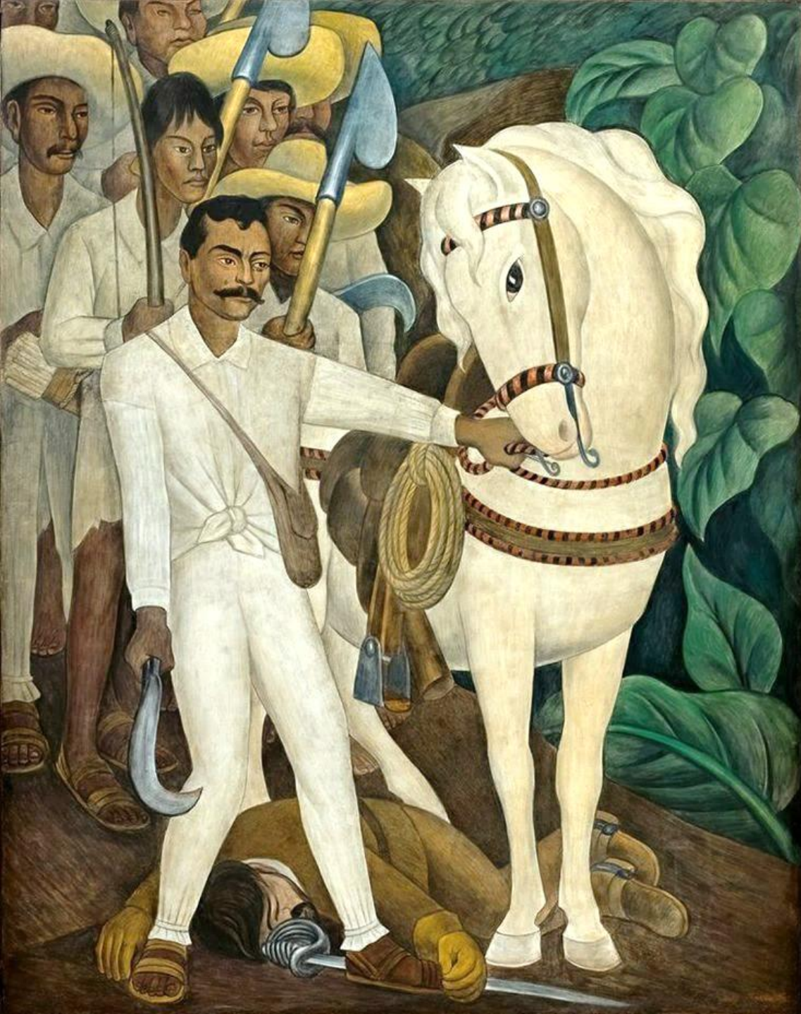
Diego Rivera, "Agrarian Leader Zapata" (1931)