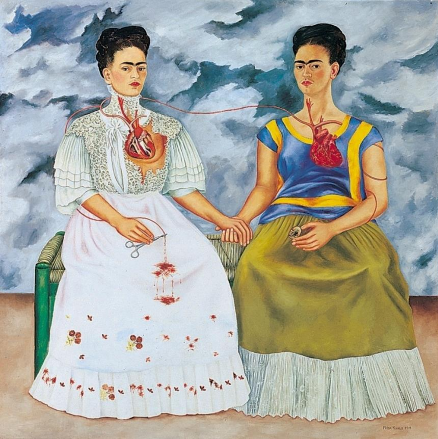
Frida Kahlo, "The Two Fridas" (1939)