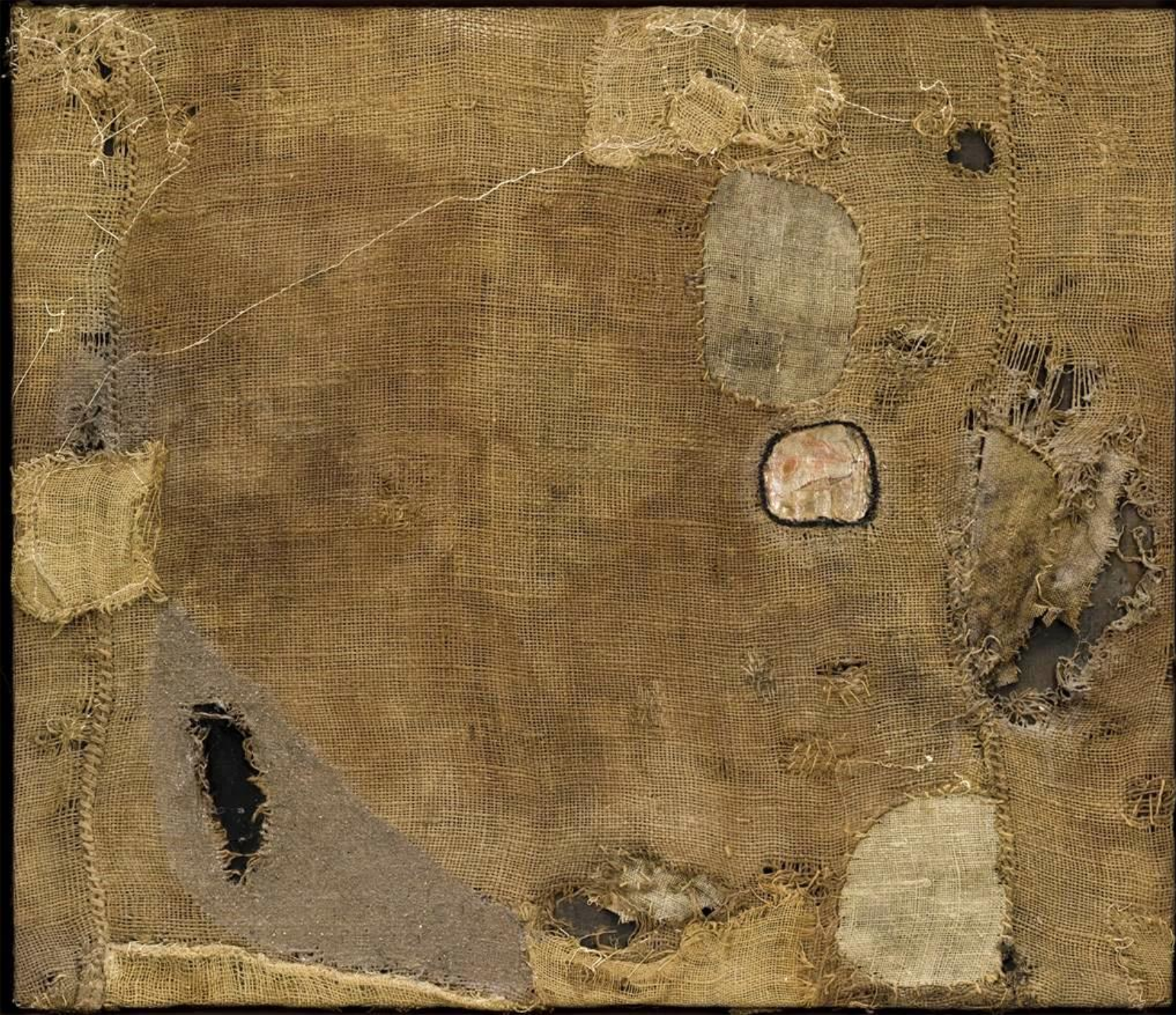
Alberto Burri, "Sackcloth" (Italy, 1953)