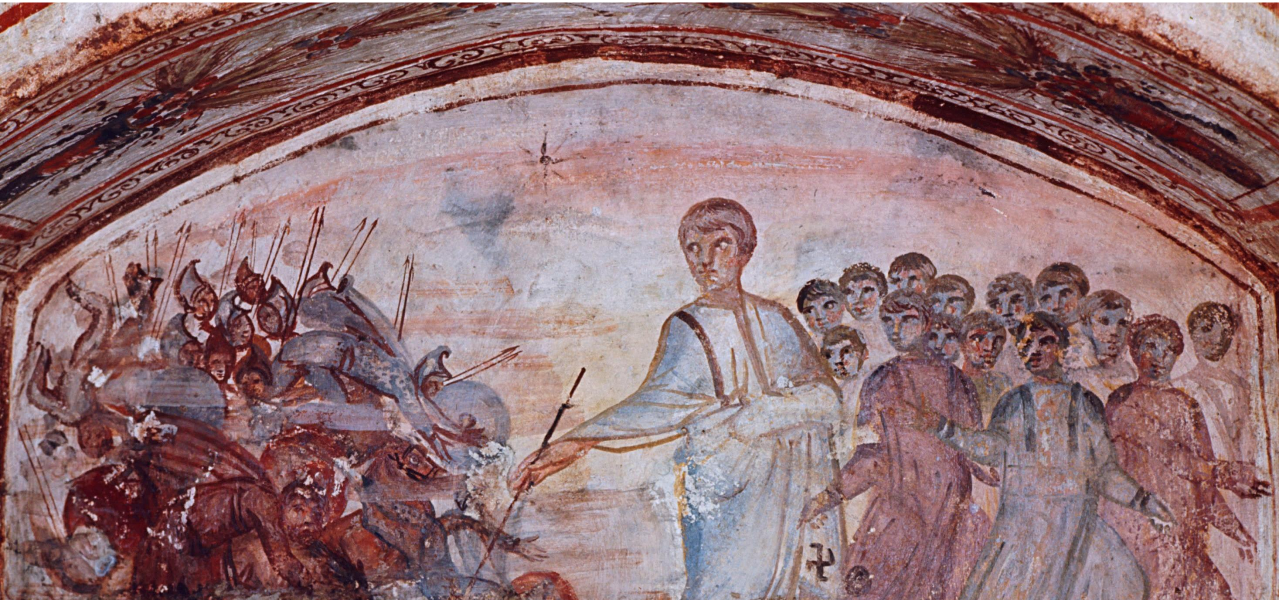
Detail of a mural depicting Moses leading the Hebrew peoples across the Red Sea (Rome, 'Via Latina' catacomb, c.300 CE)