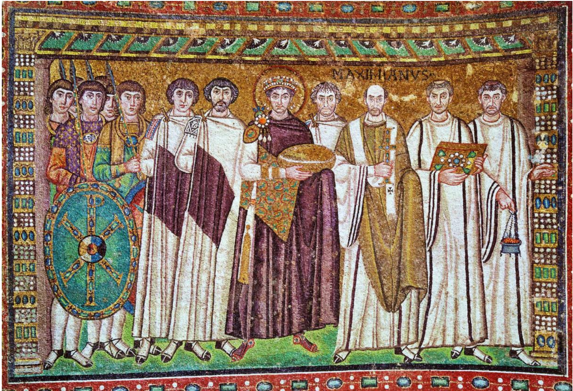
Mosaic depicting Emperor Justinian and his attendants at San Vitale (c.540 CE)