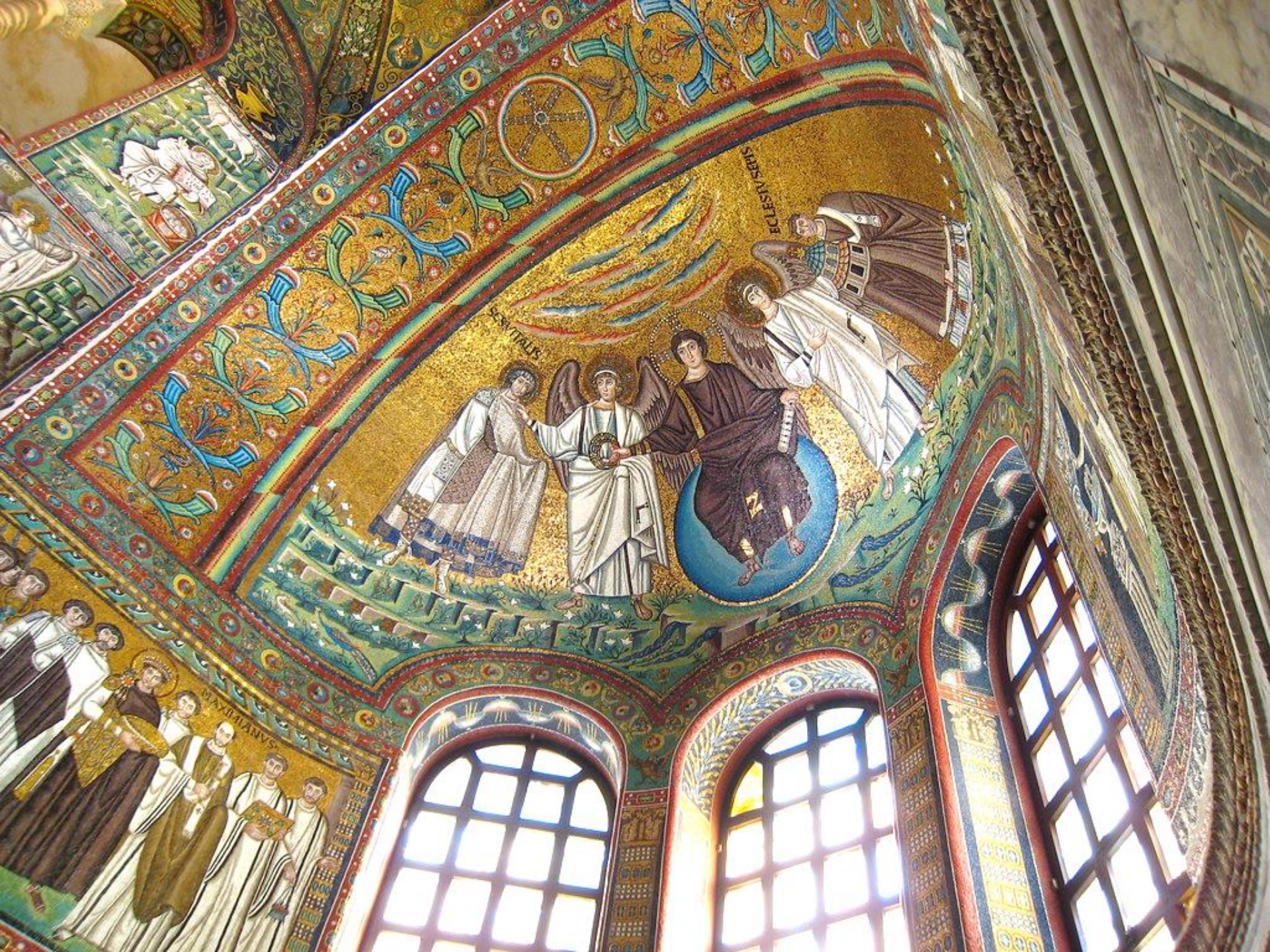
View into the sanctuary of San Vitale (c.540)