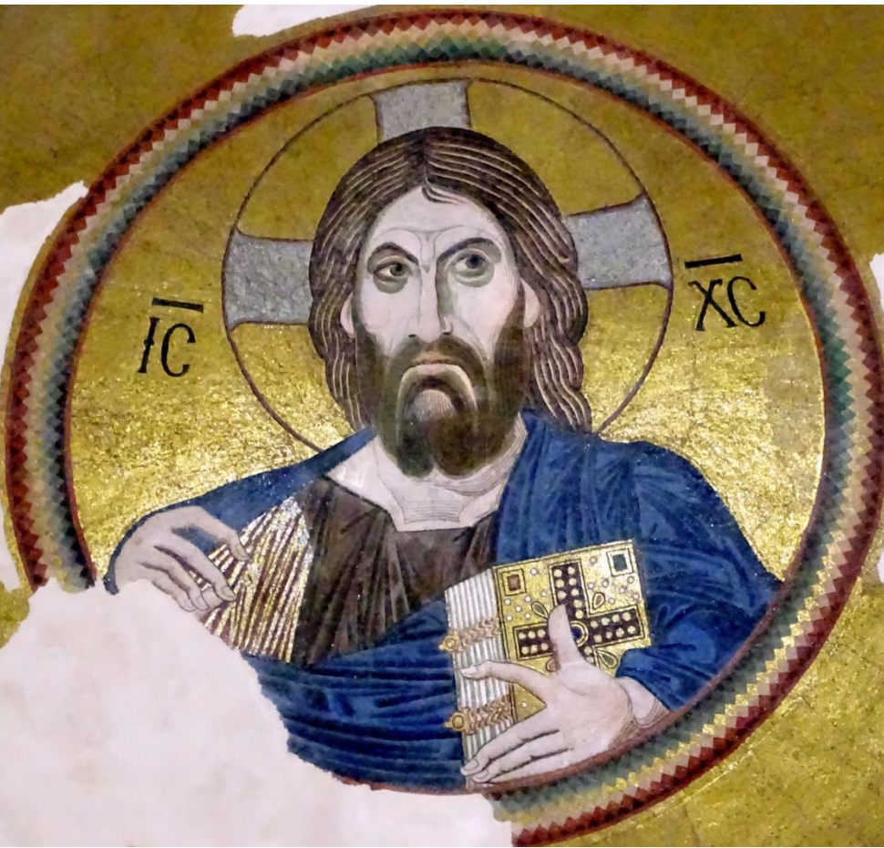
Mosaic depicting Jesus Christ as 'Pantokrator' in the Church of the Dormition in Daphni (c.1100 CE); Mosaic depicting Jesus Christ as the 'Good Shepherd' in the Oratory of Galla Placidia (Ravenna, Italy, c.540 CE)