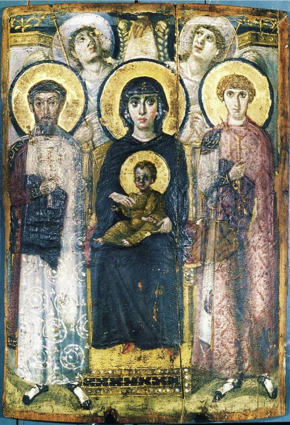
Icon depicting the 'Virgin and Child with Saints and Angels' (Monastery of Saint Catherine, Egypt, c.570 CE)