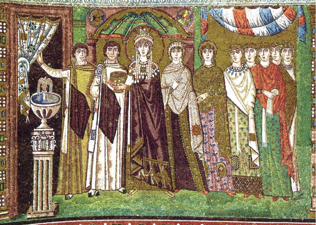
Mosaics depicting Empress Theodora and Emperor Justinian with their attendants at San Vitale (c.540 CE)