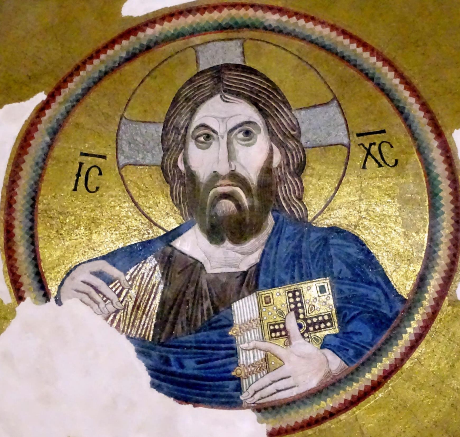
Mosaic depicting Jesus Christ as 'Pantokrator' (Universal Sovereign) in the Church of the Dormition (Daphni, Greece, c.1100 CE)