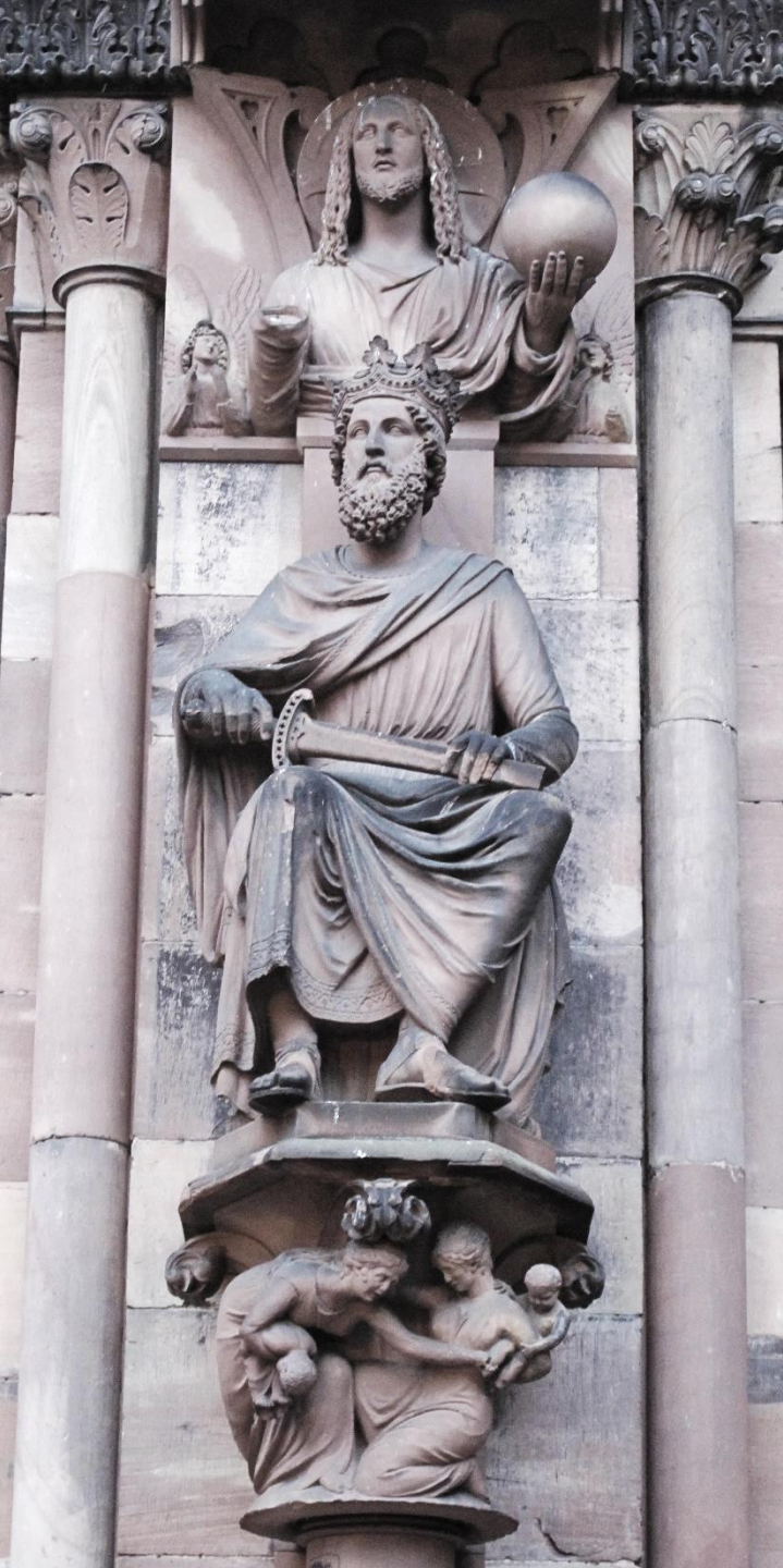
Sculptures depicting Jesus Christ, King Solomon, and the 'Judgment of Solomon' on the south portal of Strasbourg Cathedral (13 th century)