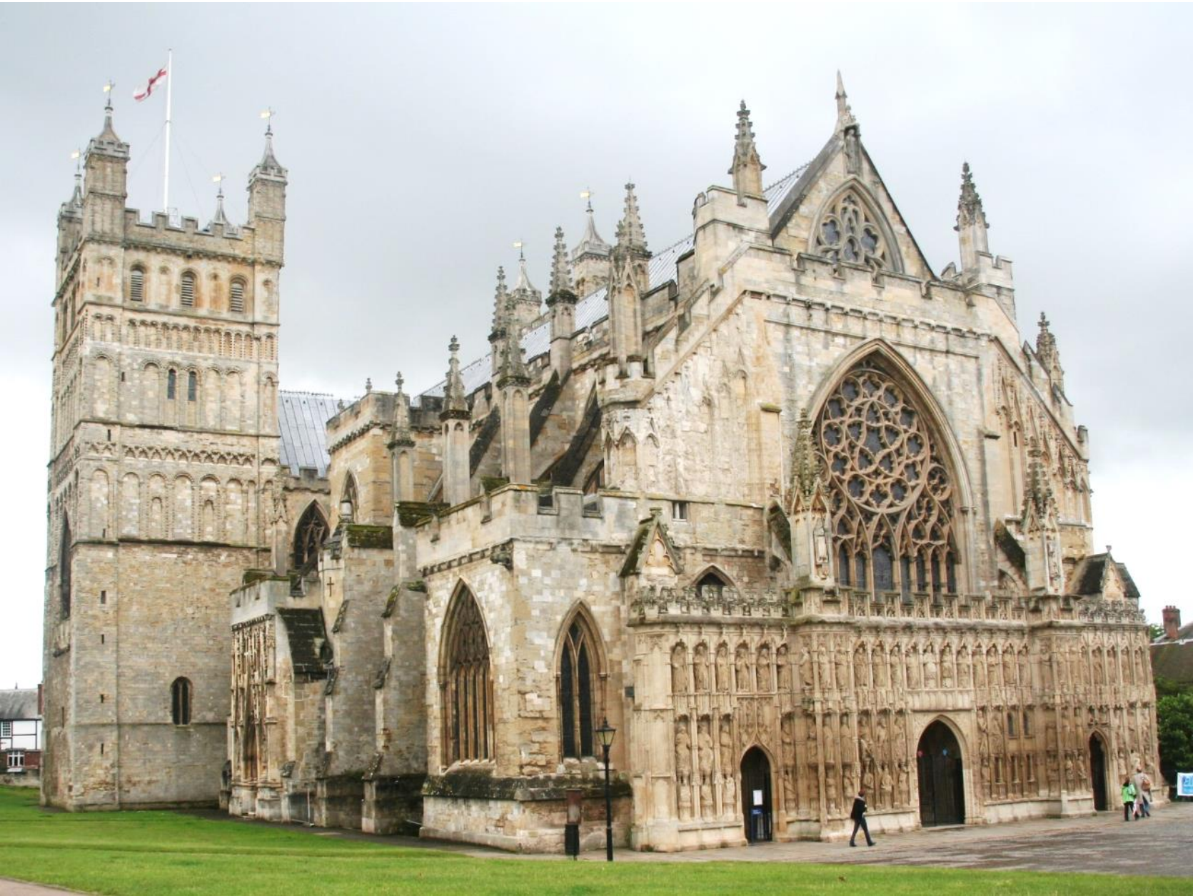
Exeter Cathedral (England, 13 th – 14 th century)