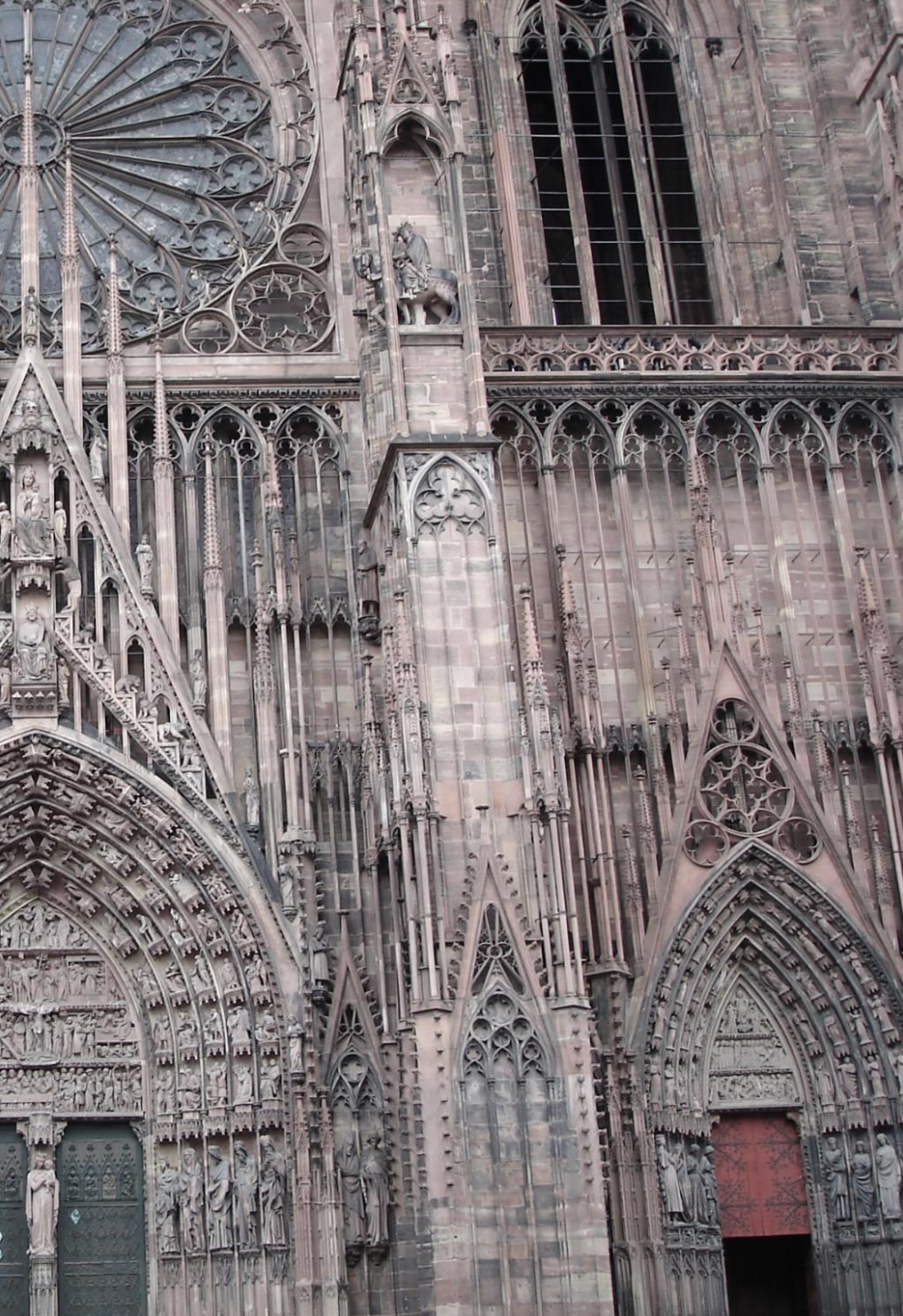
Façade of Strasbourg Cathedral (13 th - 15 th century); Sculptures referencing the parable of the 'Wise and Foolish Virgins'