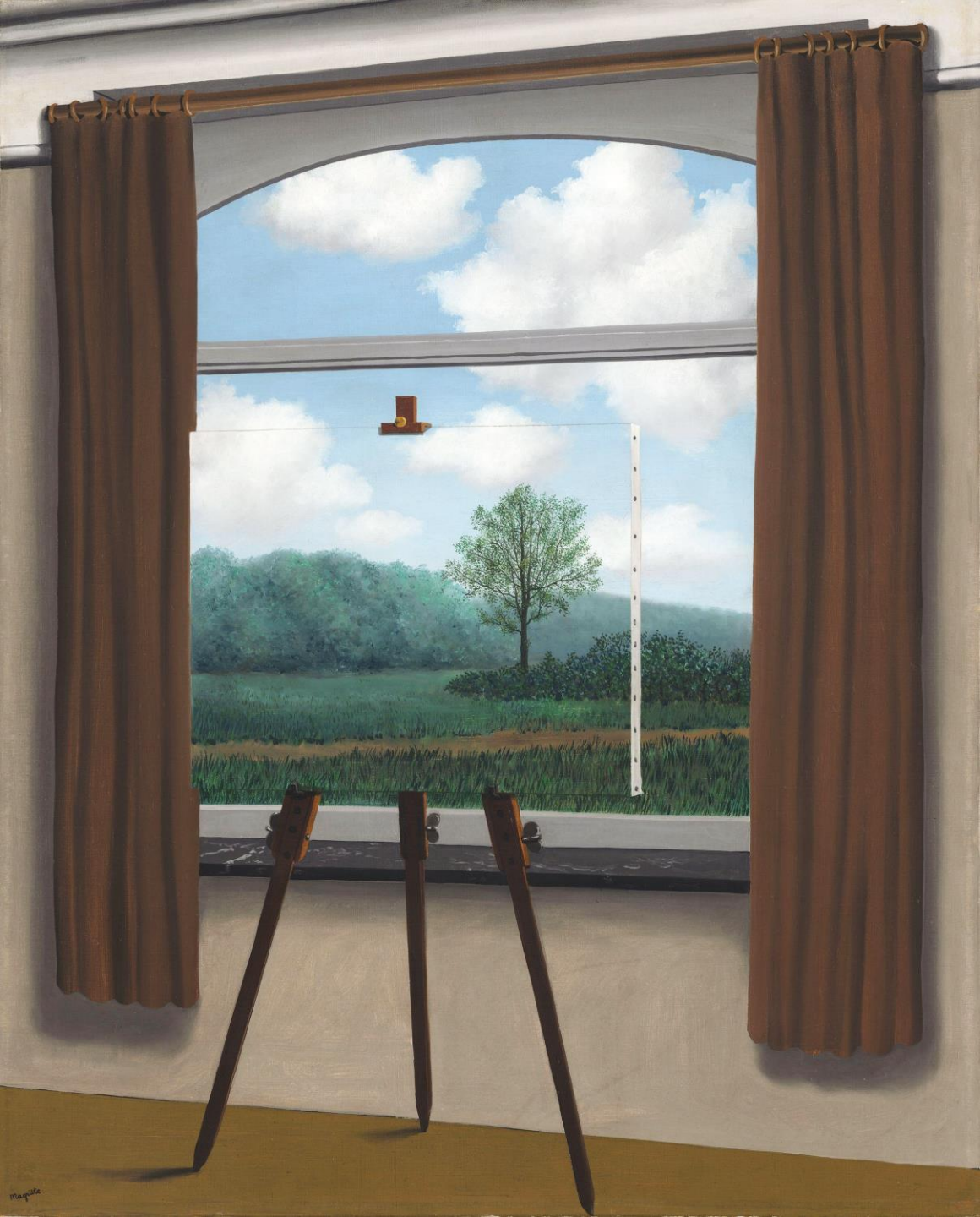
René Magritte, "La condition humaine" (France, 1933)