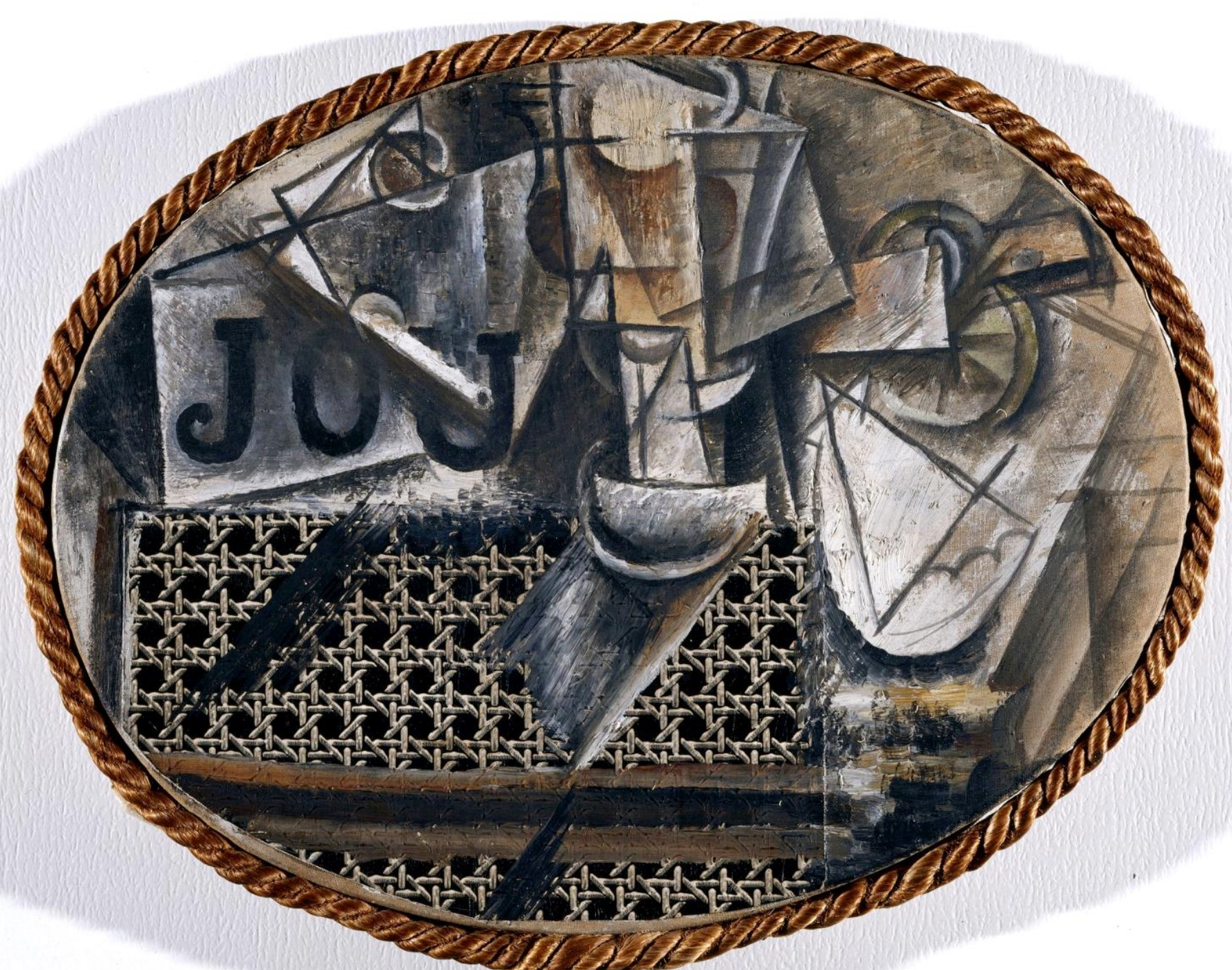
Pablo Picasso, "Still Life with Chair Caning" (France, 1912)