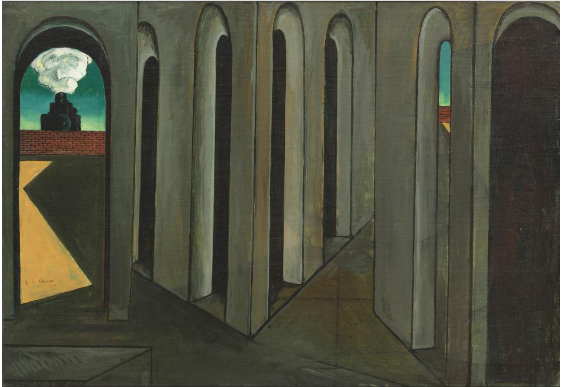
Giorgio de Chirico, "The Anxious Journey" (France, 1913)