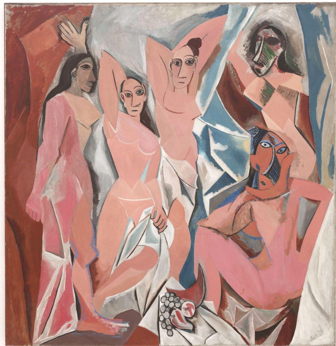
Pablo Picasso, "Demoiselles" (1907); Greek sculptures of a "Kouros" (c.600 BCE) and "Aphrodite" (2 nd century BCE)