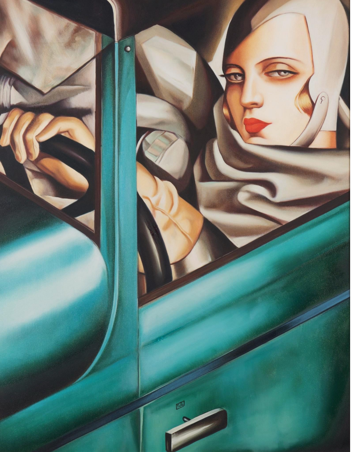
Tamara de Lempicka, "My Portrait" (Poland → France, 1929)