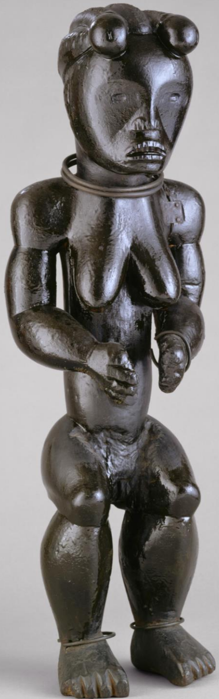
“Eyema Byeri (Reliquary Guardian Figure)” from Gabon (19 th century); Pablo Picasso, “Demoiselles” (1907)