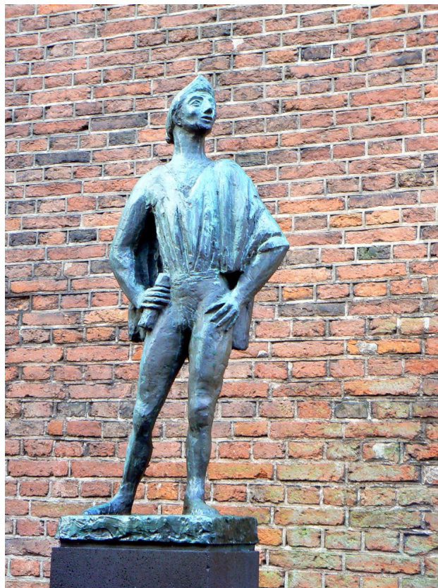
Francois Villon by Utrecht

Nay, never ask this week, fair lord, Where they are gone, nor yet this year, Except with this for an overword-- "But where are the snows of yesteryear?"