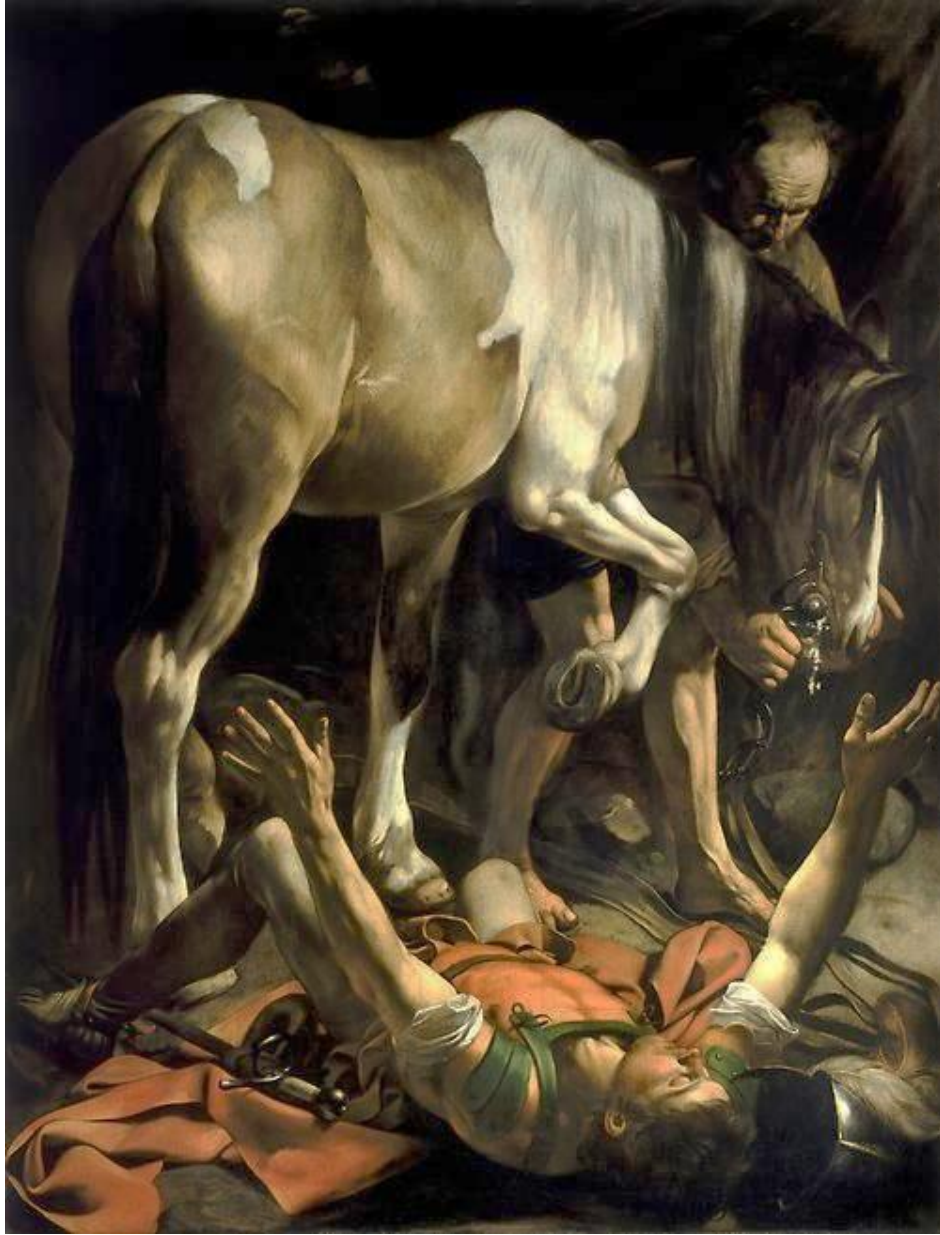
Caravaggio, 'Conversion of Saint Paul' (c.1600); Annibale Carracci, 'Assumption of the Virgin' (c.1600)