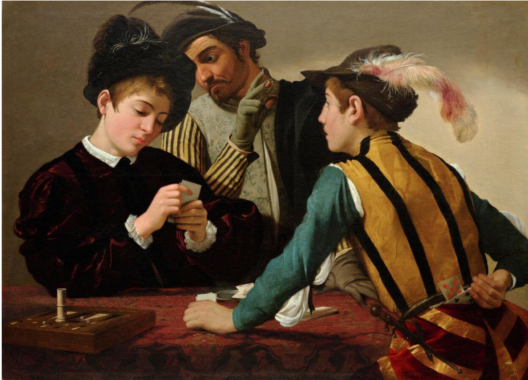
Caravaggio, 'The Cardsharps' (1594)