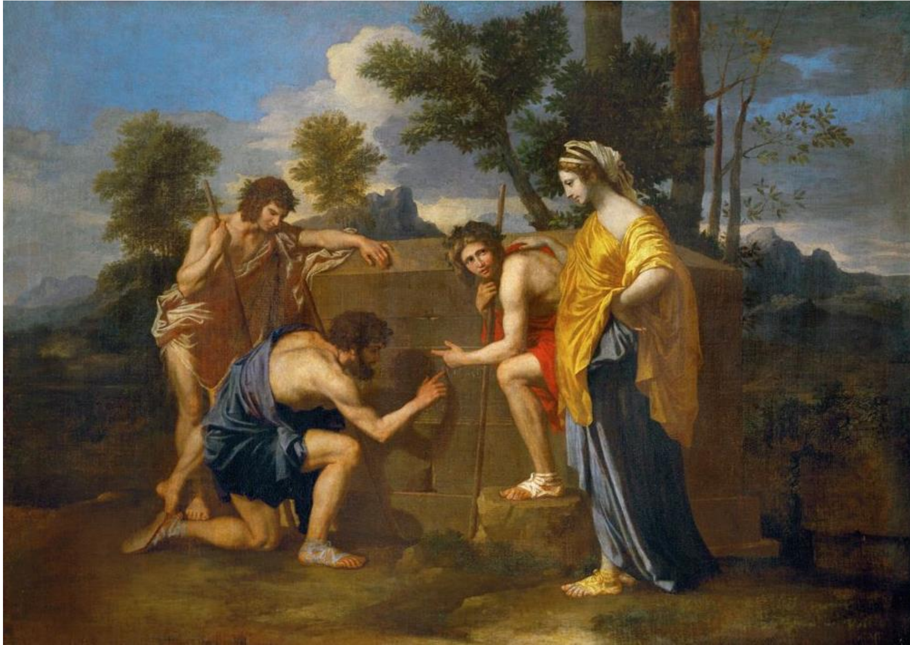
Nicolas Poussin, 'Arcadian Shepherds' (c.1638)