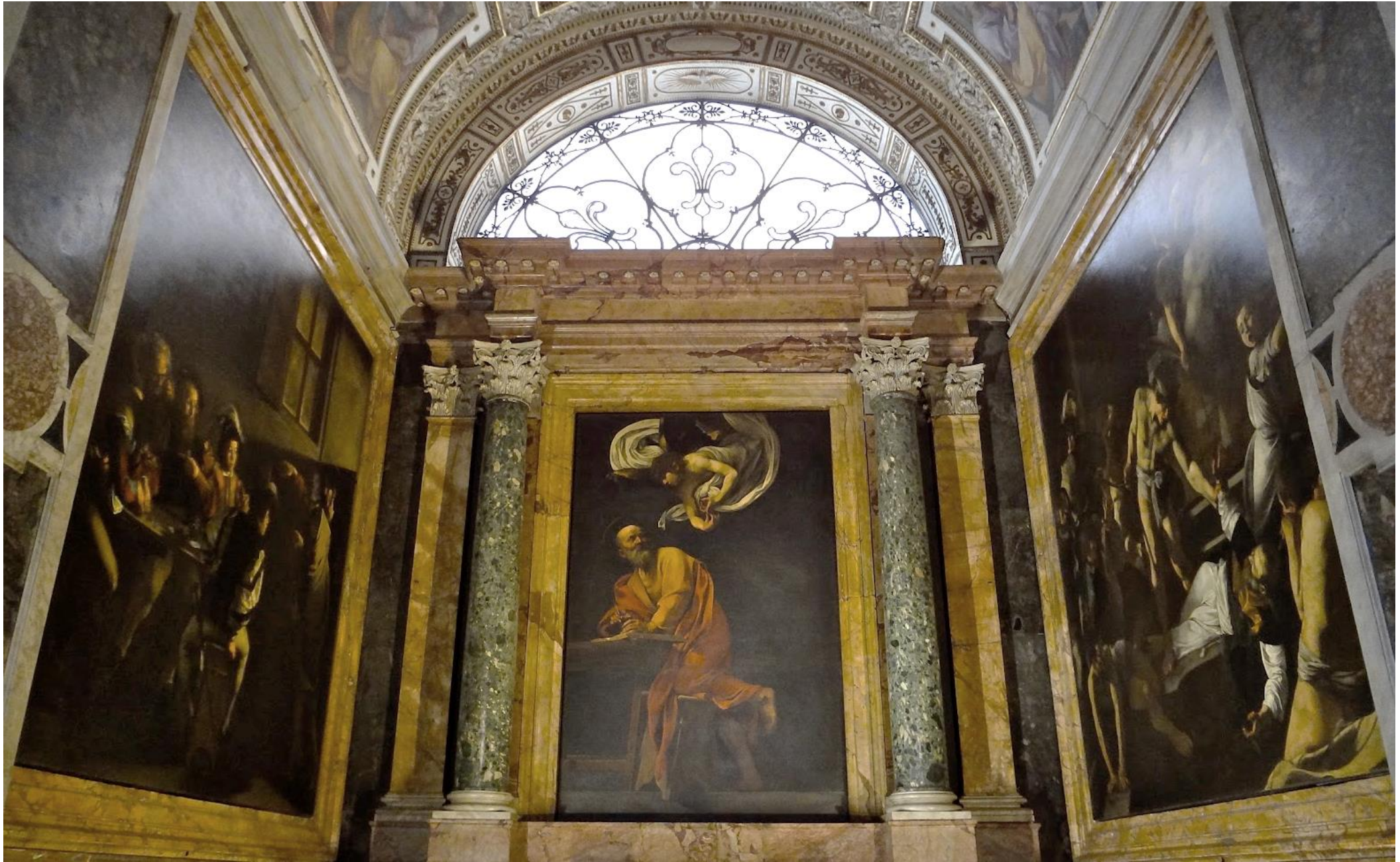
San Luigi dei Francesi: Contarelli Chapel with paintings by Caravaggio (Rome, c.1600)