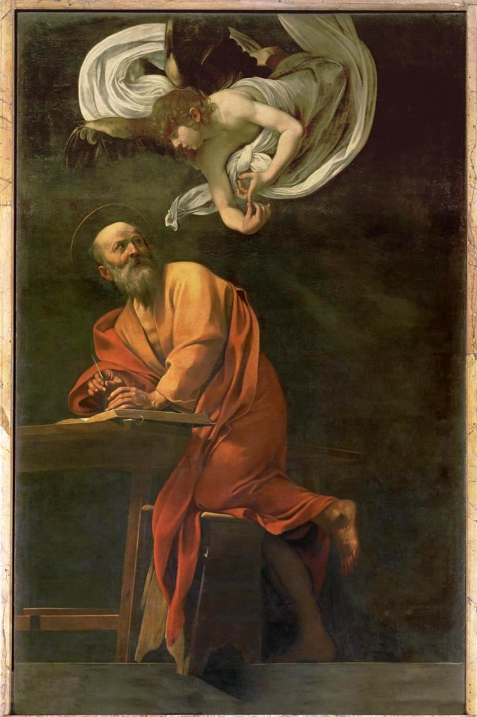
Caravaggio, 'Saint Matthew and the Angel' (c.1600)