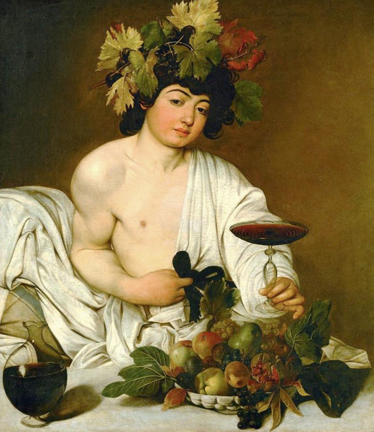
Caravaggio, 'Bacchus' (c.1596)