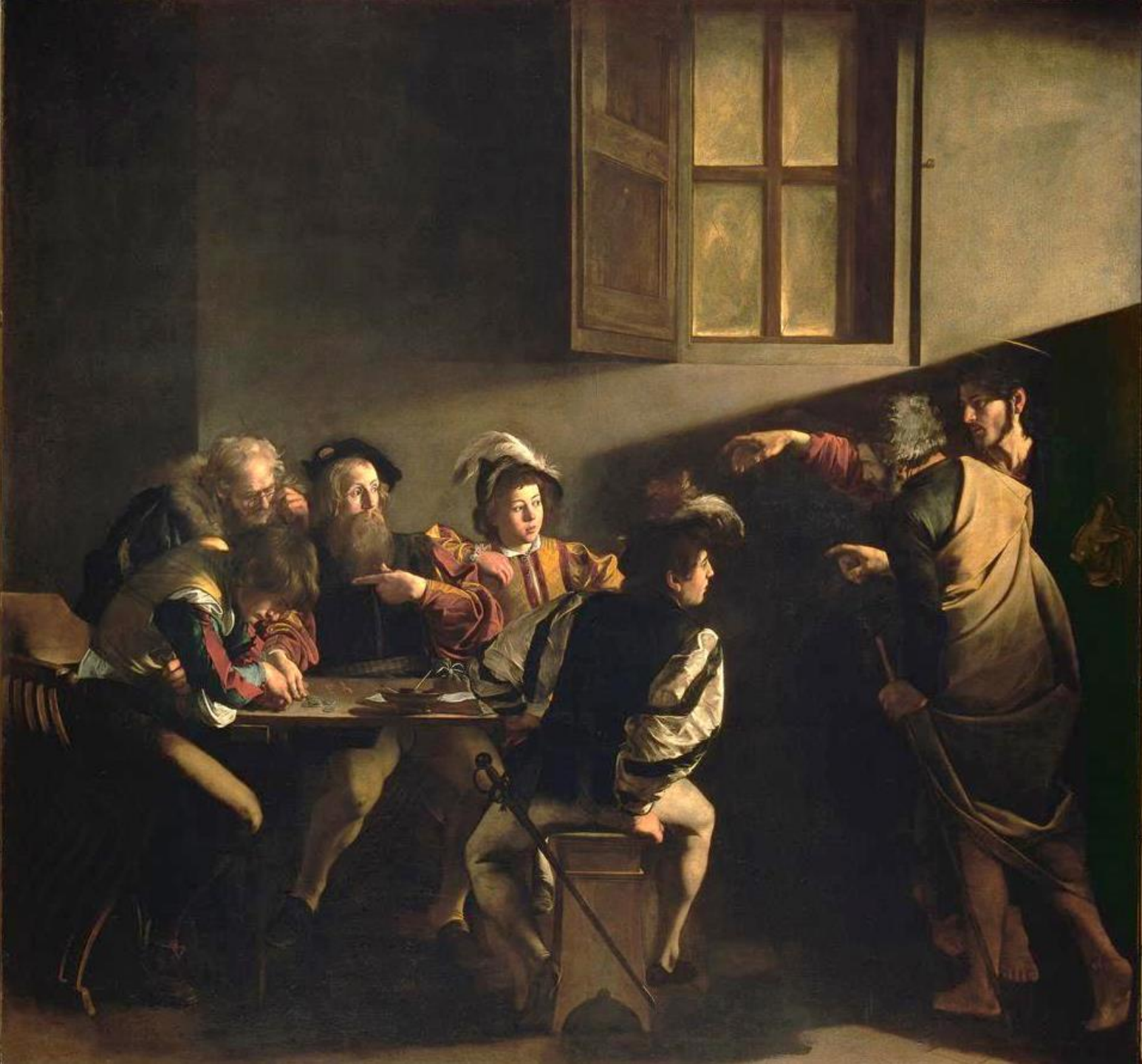
Caravaggio, 'Calling of Saint Matthew' (c.1600)