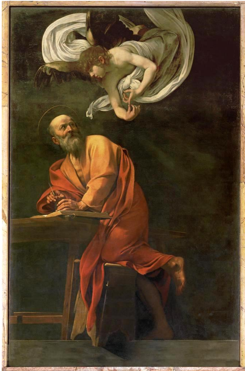
Caravaggio's two versions of 'Saint Matthew and the Angel' (first, below – rejected by the original patron)