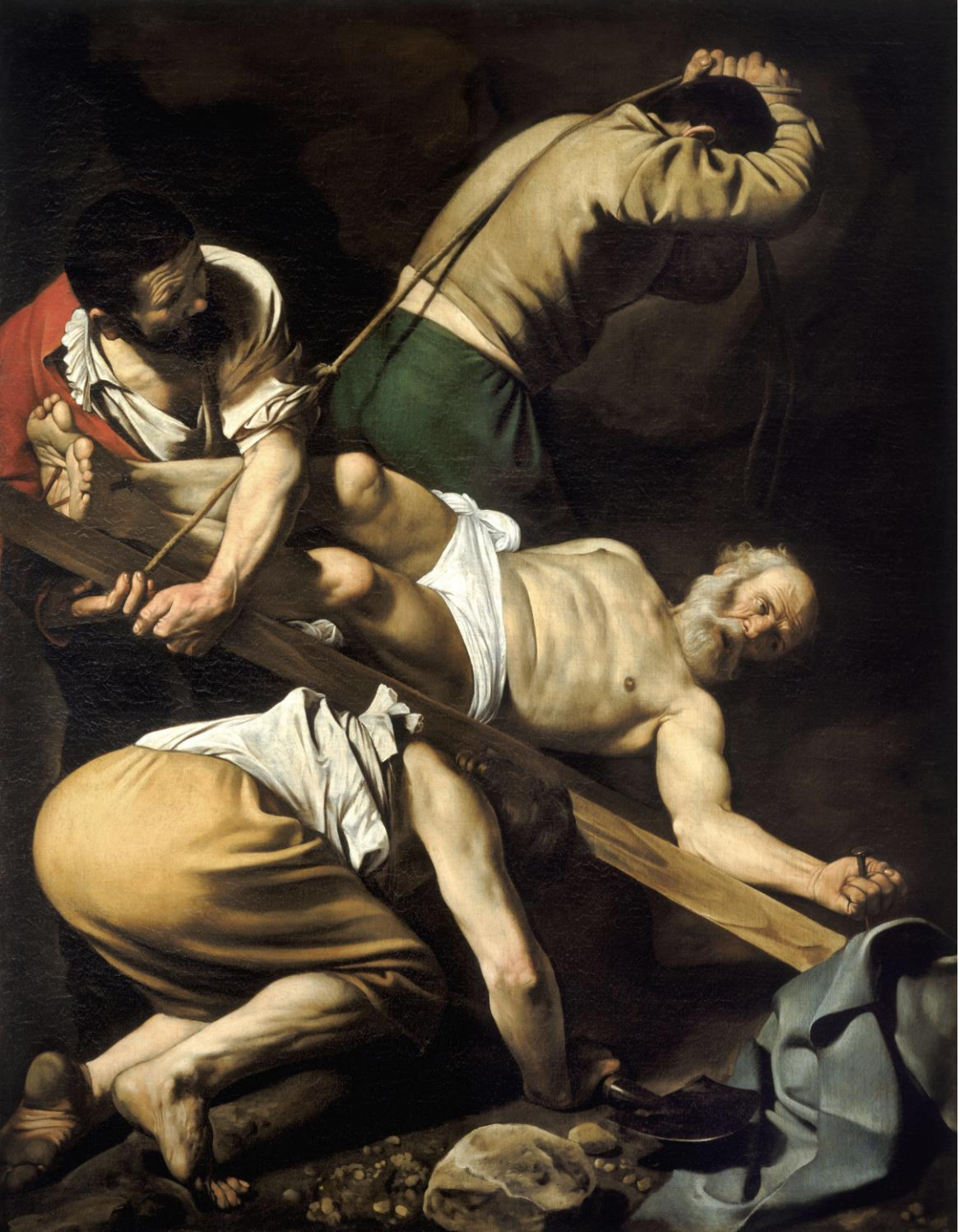
Caravaggio, 'Crucifixion of Saint Peter' (c.1600)