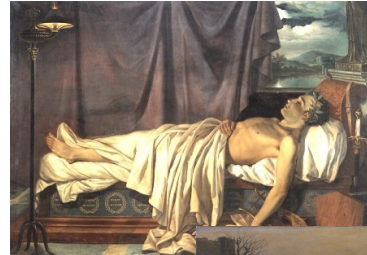
Lord Byron on his Death-bed c. 1826 by Joseph Dionysius Odevaere