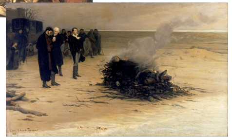
The Funeral of Shelley by Louis Edouard