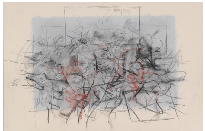
In the Realm of the Mothers III (2014) by Jenny Saville